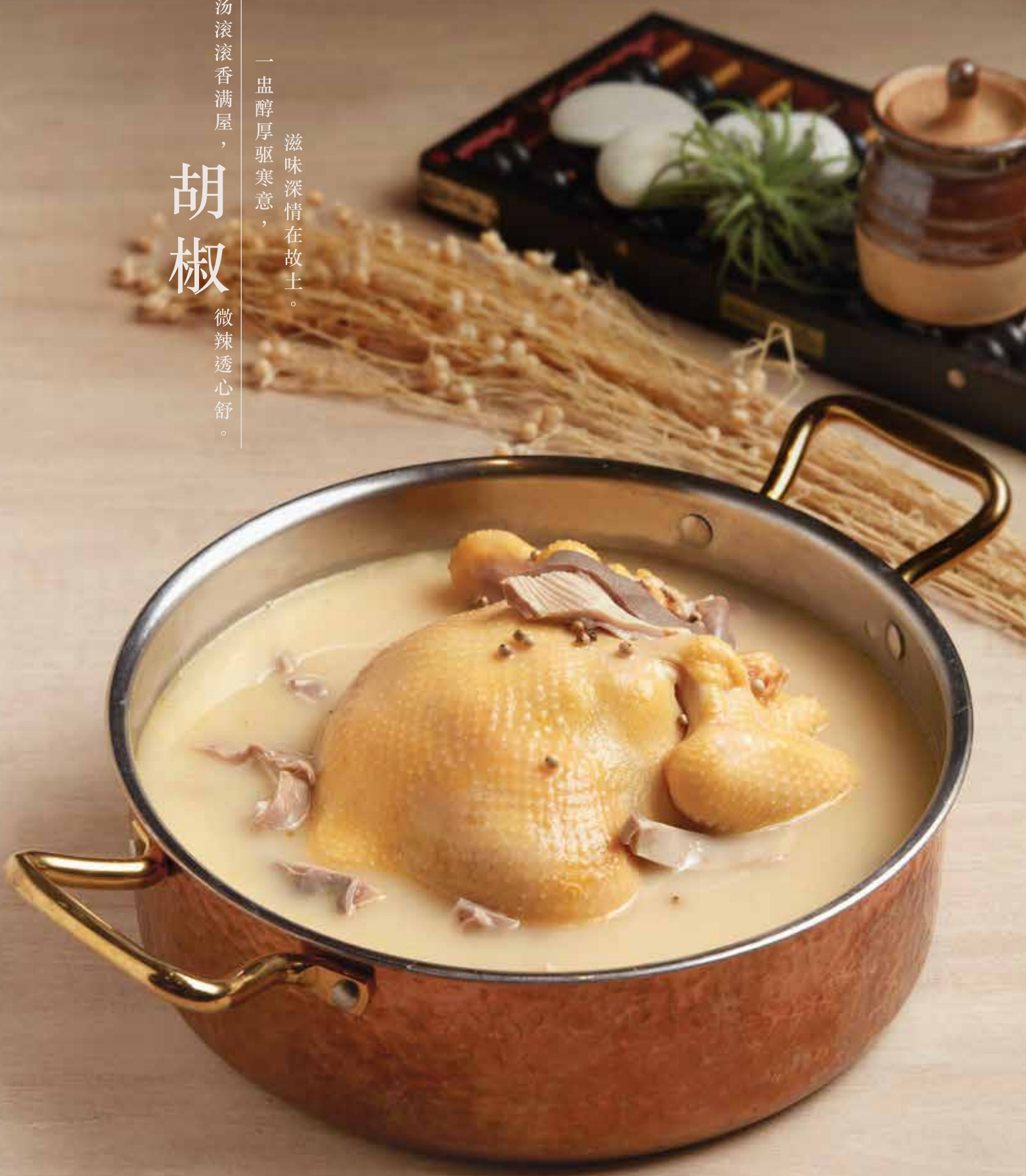
403 胡椒猪肚鸡汤 Peppery Pig's Stomach and Chicken Soup