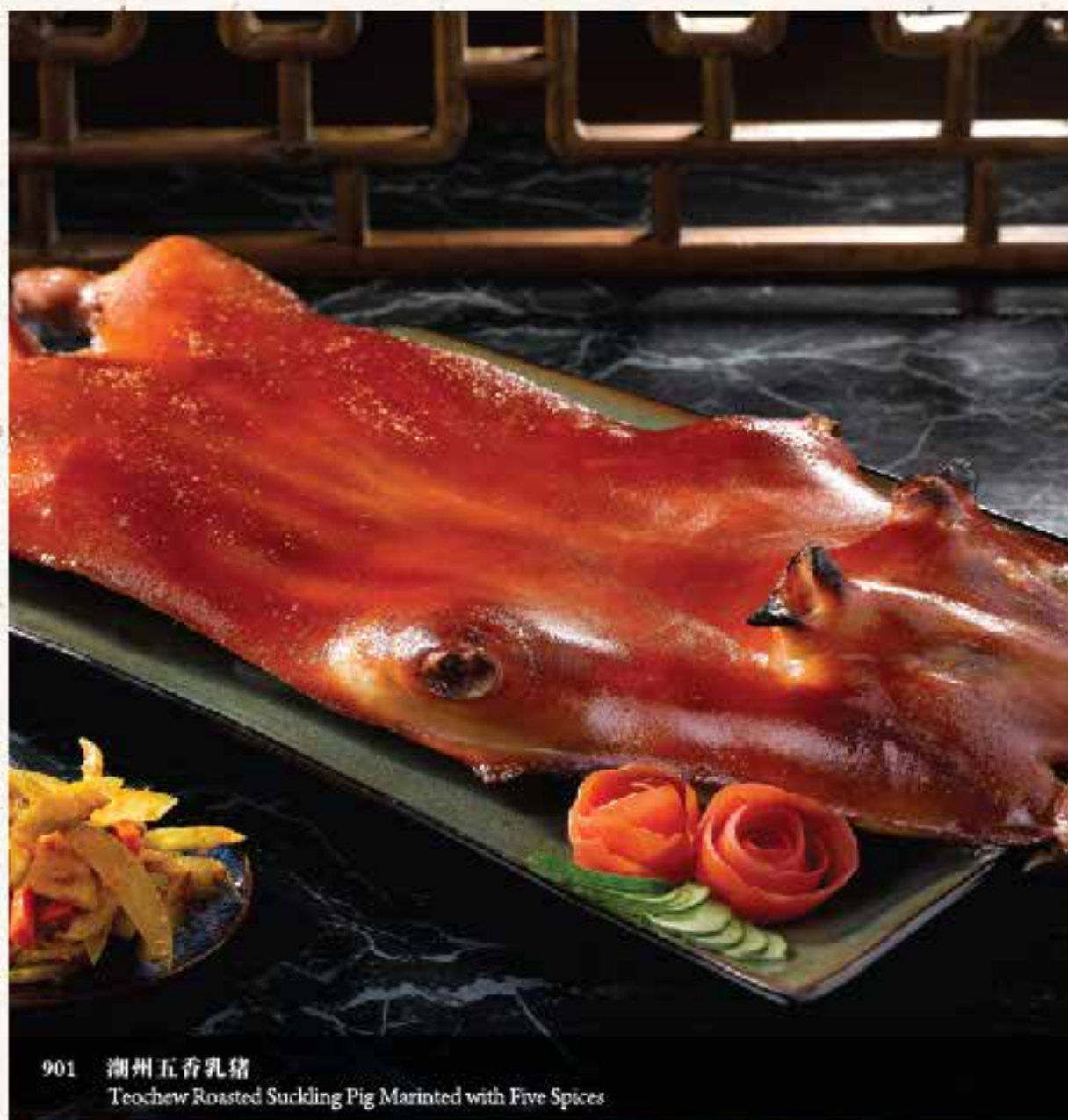
901 潮州五香乳猪 Teochew Roasted Suckling Pig Marinated with Five Spices