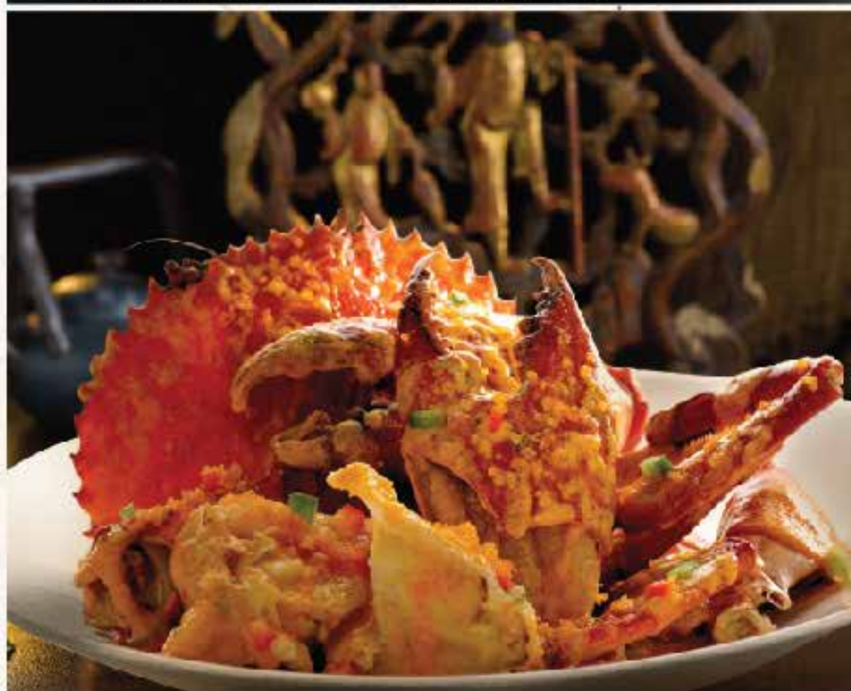
502E 咸蛋金沙炒活青蟹 Live Mud Crab Wok Fried with Golden Salted Egg