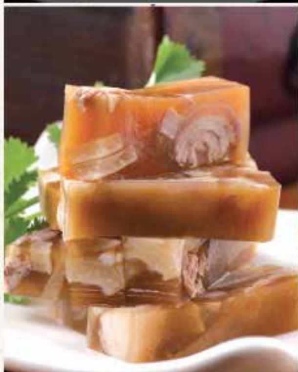
112 猪脚冻 Pig Trotter Terrine