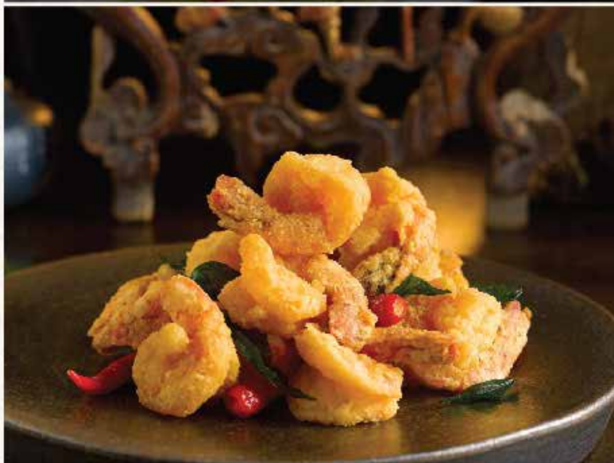
702D 咸蛋金沙炒虾球 Shelled Prawns Wok Fried with Golden Salted Egg