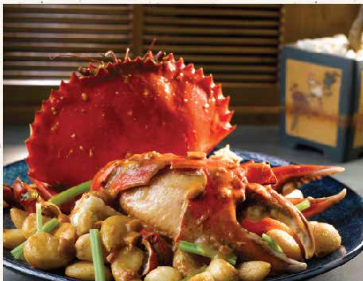
502C 蒜香豆醬焗活青蟹 Live Mud Crab Wok Baked with Fermented Bean and Garlic Teochew Style