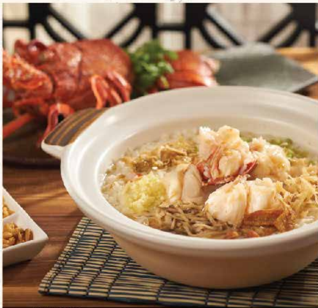
401I 活澳洲龙虾泡饭 Live Australian Lobster and Rice Boiled in Superior Broth