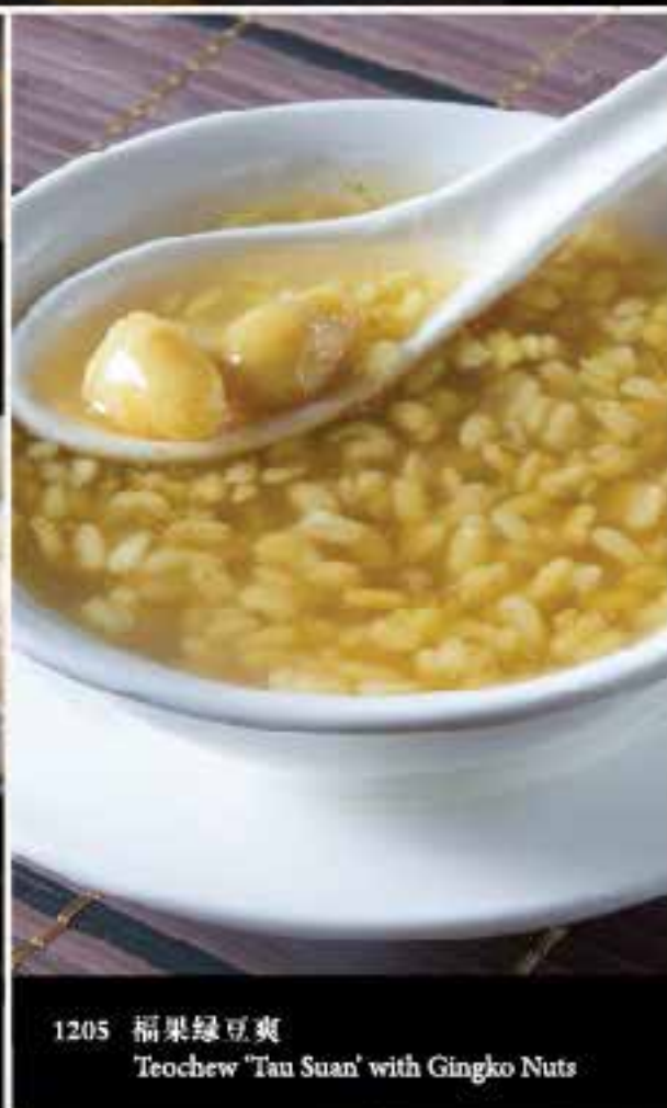
1205 福果绿豆爽 Teochew 'Tau Suan' with Ginkgo Nuts