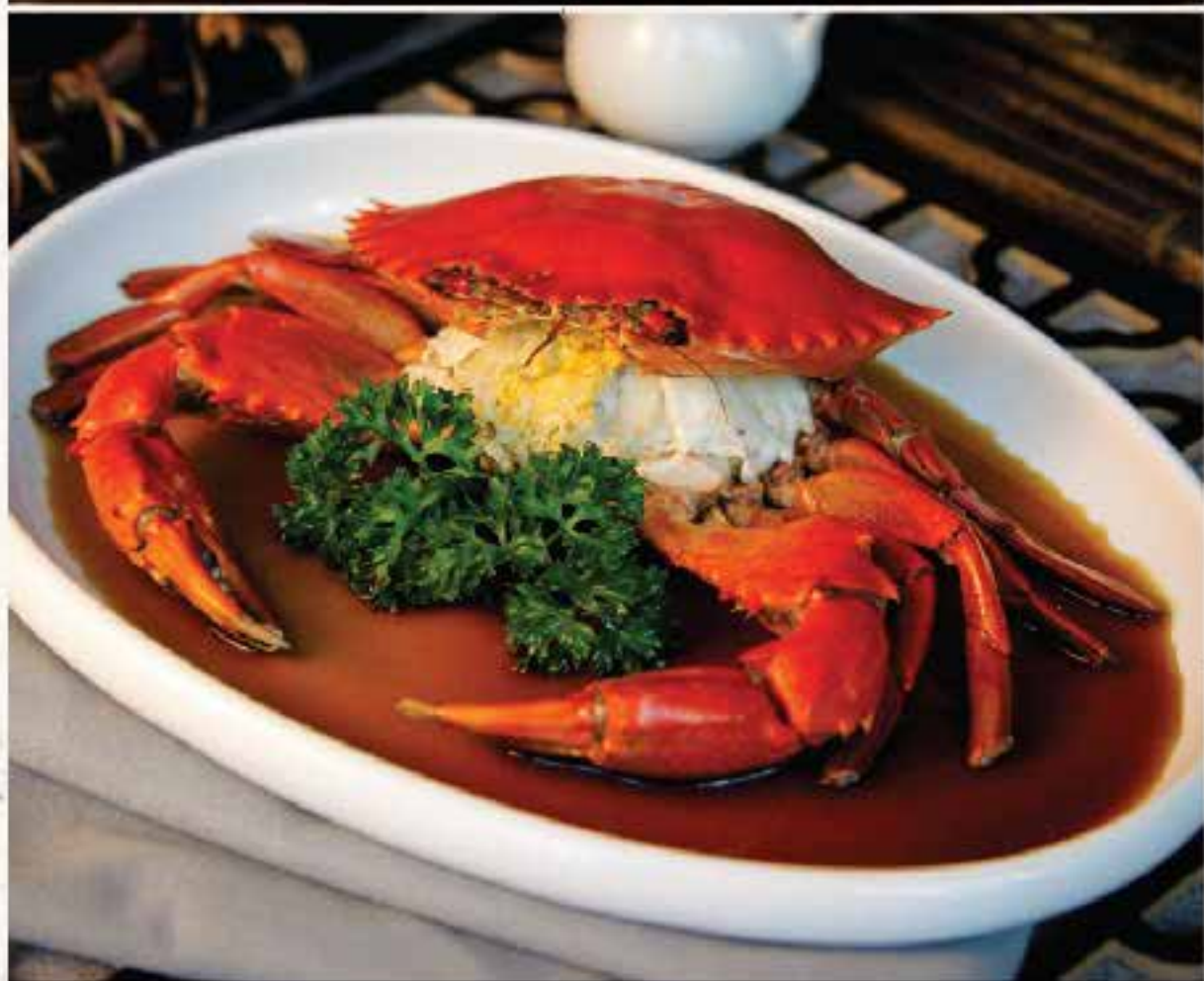
108 冻醉黄膏蟹 Chilled Roe Crab with Chinese Wine