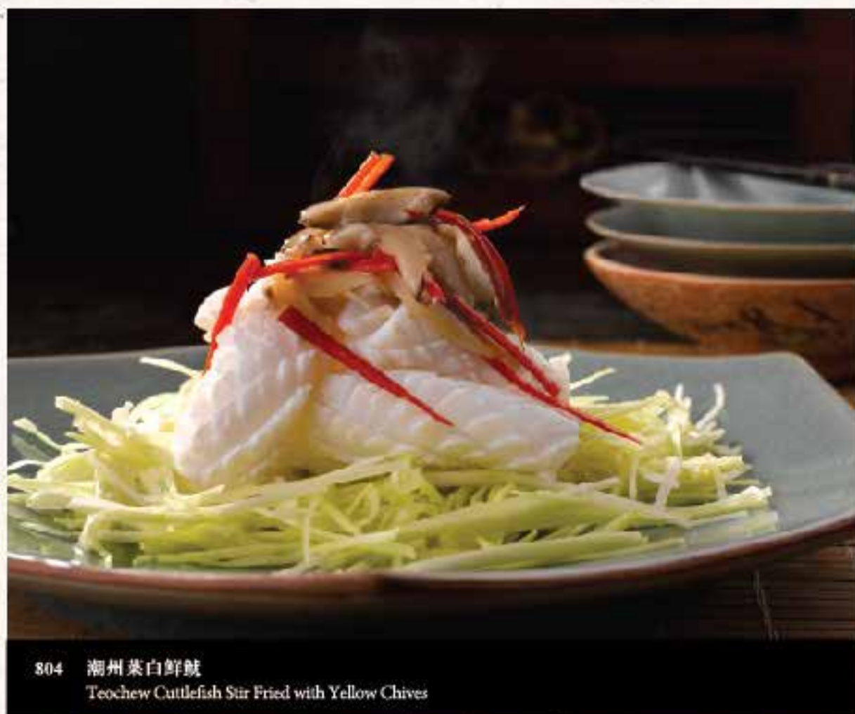
804 潮州菜白鲜鱿 Teochew Cuttlefish Stir Fried with Yellow Chives