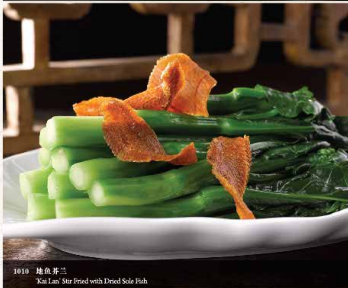
1010 地鱼芥兰 'Kai Lan' Stir Fried with Dried Sole Fish