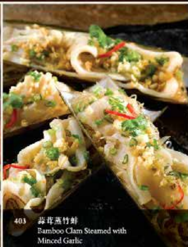
403 蒜茸蒸竹蚌 Bamboo Clam Steamed with Minced Garlic