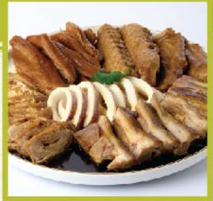
08 潮州卤水拼盘 Teochew Braised Platter