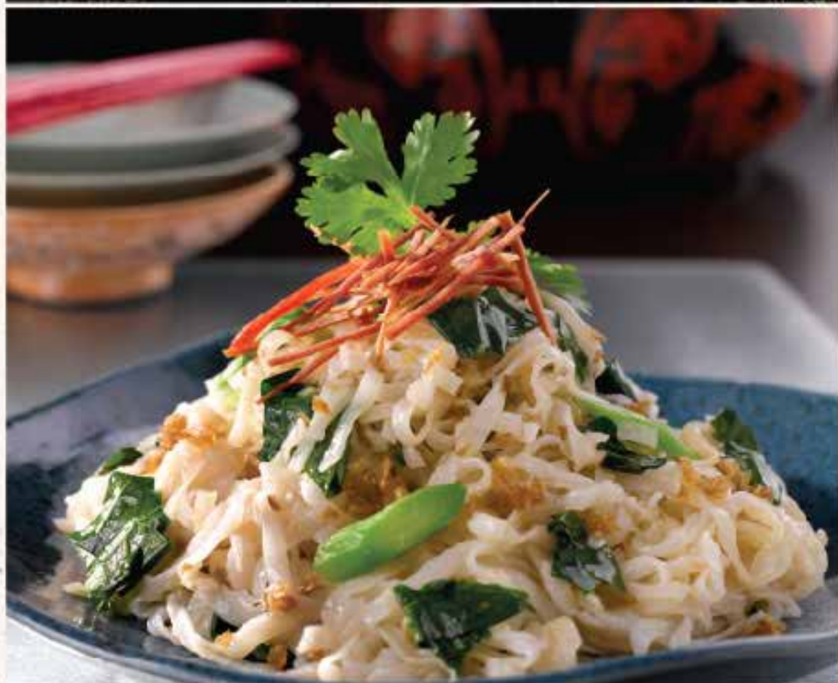
1104 菜脯芥兰炒粿条 Wok Fried 'Kway Teow' with Diced 'Kai Lan' and Preserved Radish