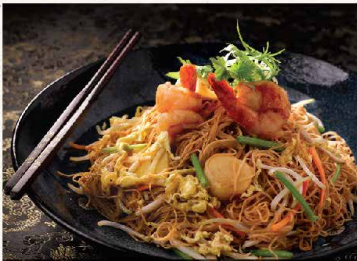
1102 海鲜干炒面线 Wok Fried 'Mee Sua' with Seafood