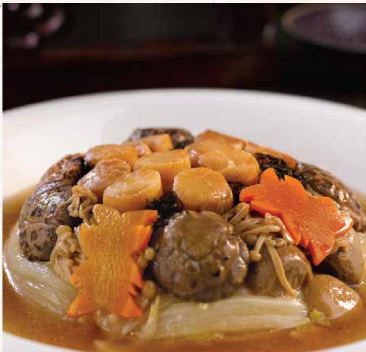
1001 干贝八宝蔬 Conpoy Braised with Eight Vegetarian Treasures