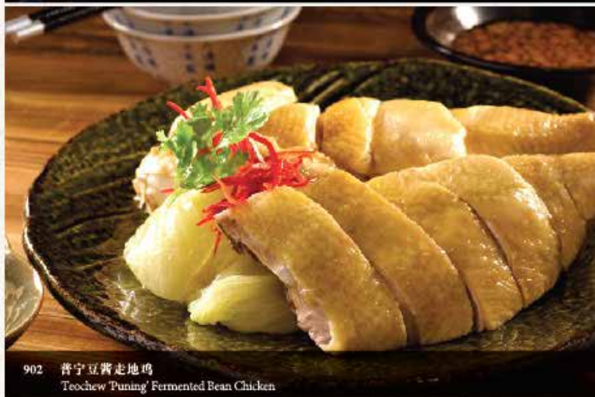
902 普宁豆酱走地鸡 Teochew 'Puning' Fermented Bean Chicken