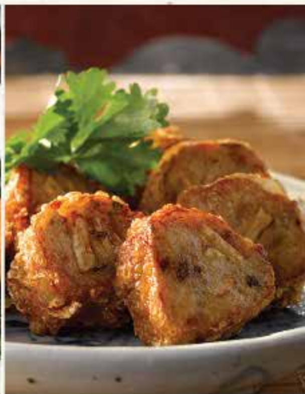
111 五香枣 Deep Fried 'Nghoh Hiang'