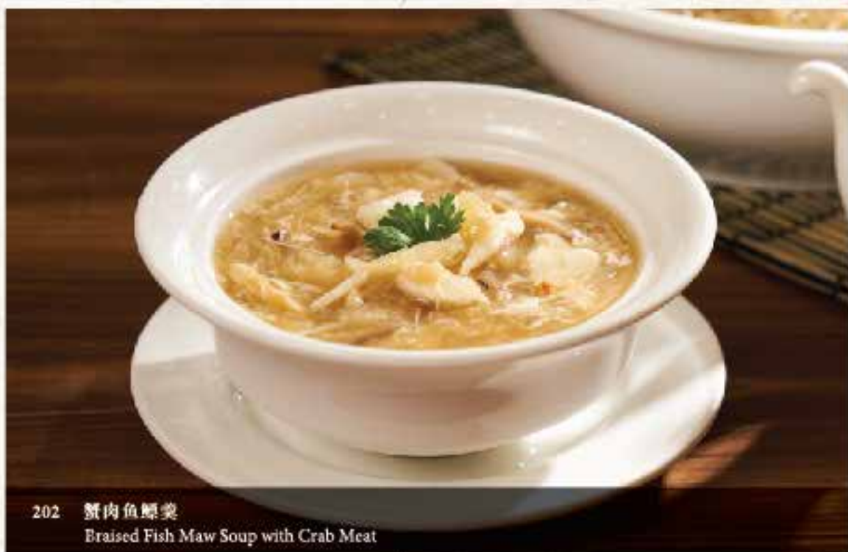
202 蟹肉魚鰾羹 Braised Fish Maw Soup with Crab Meat