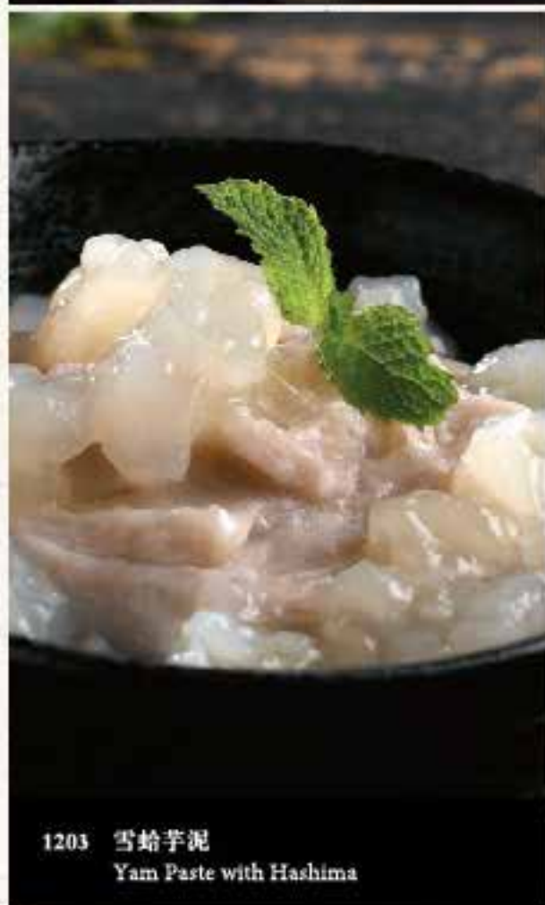
1203 雪蛤芋泥 Yam Paste with Hashima