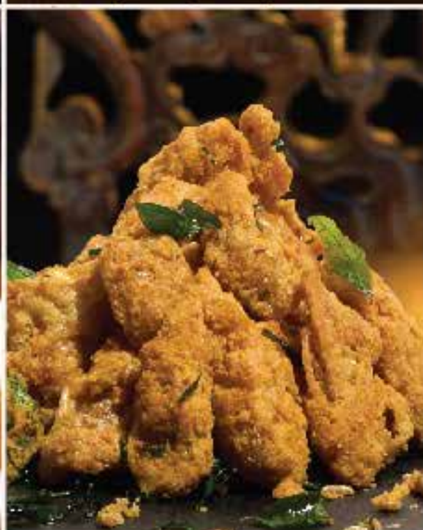
113 咸蛋金沙虾吧 Golden Salted Egg Prawn Chins