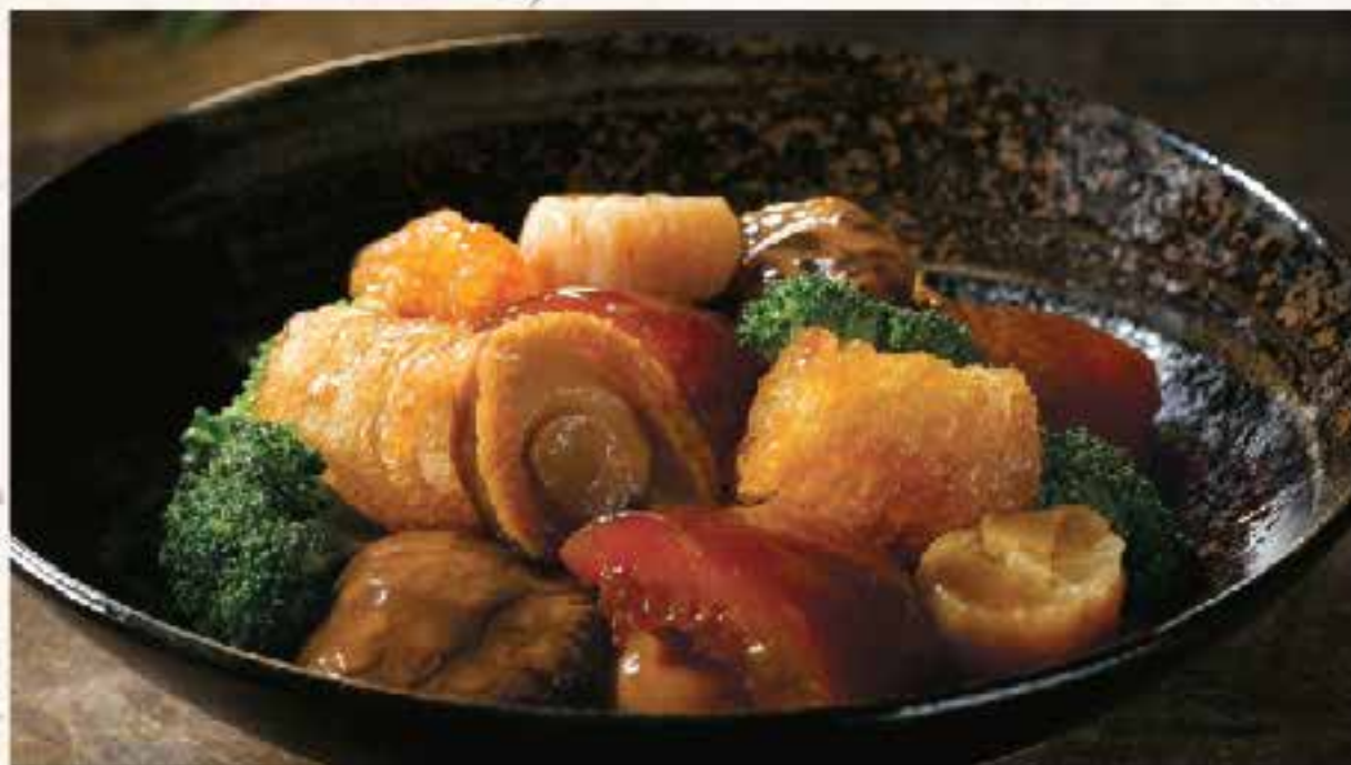
301 鲍参八珍一品锅 Eight Treasures Seafood Claypot with Braised Abalone and Sea Cucumber