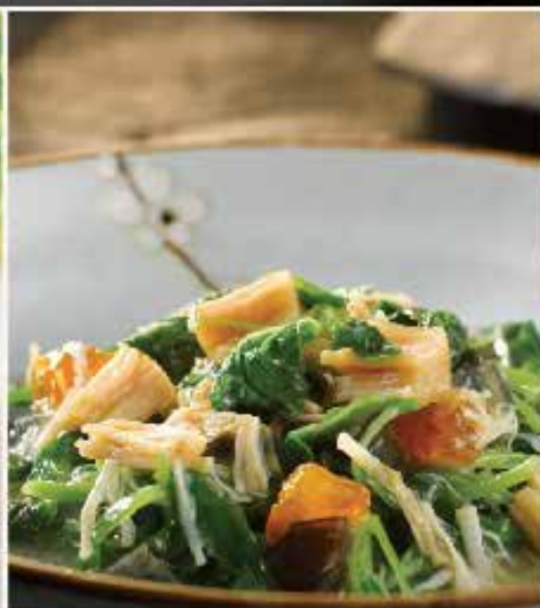
1004 干贝三色蛋菹菜苜 Chinese Spinach Braised with Conpoy and Trio Egg