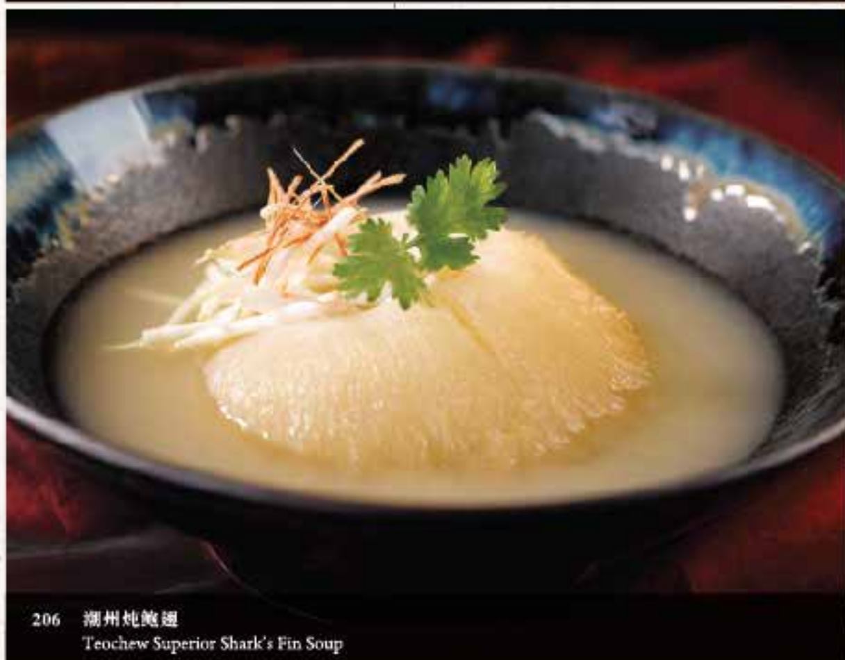
206 潮州炖鮫翅 Teochew Superior Shark's Fin Soup