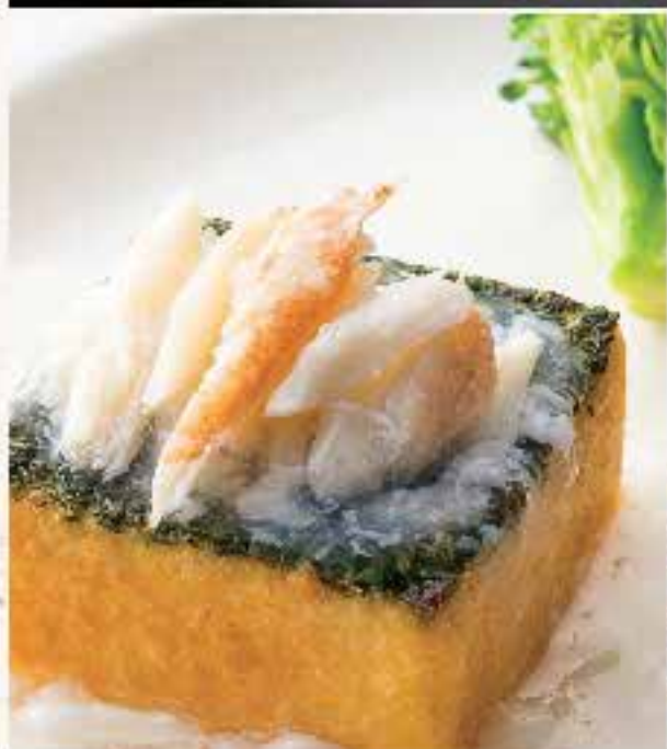
1002 蟹扒翡翠豆腐 Home-made Vegetable Skin Beancurd Braised with Crab Meat