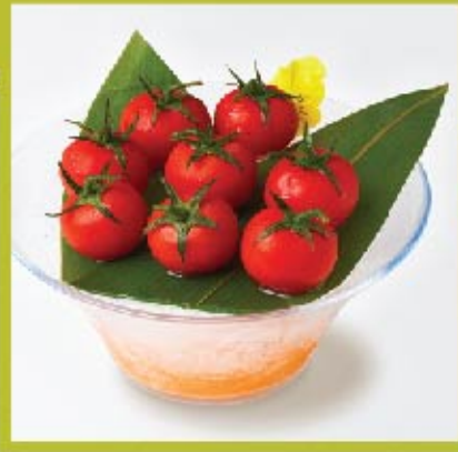
01 冰镇梅汁小番茄 Chilled Cherry Tomatoes Marinated with Sour Plum