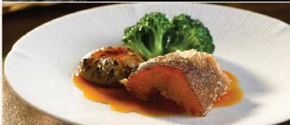
306 鲍汁脆皮海参扣花菇 Crispy Fried Sea Cucumber and Shiitake Mushroom with Abalone Sauce