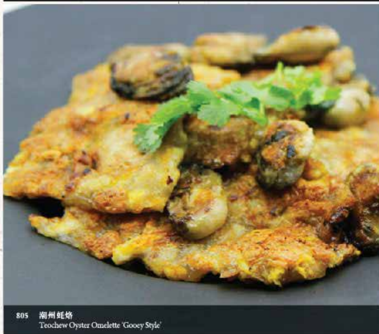
805 潮州蚝烙 Teochew Oyster Omelette 'Gooey Style'