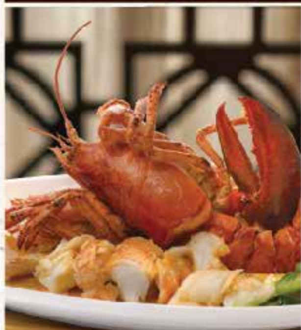
402D 上汤焗活波士顿龙虾 Live Boston Lobster Braised with Superior Broth