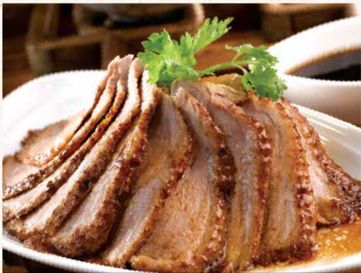
103 卤鸭拼豆干 Braised Duck with Beancurd