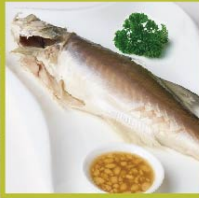
06 午鱼笋潮州鱼饭 Poached Threadfin Served with Fermented Bean Paste