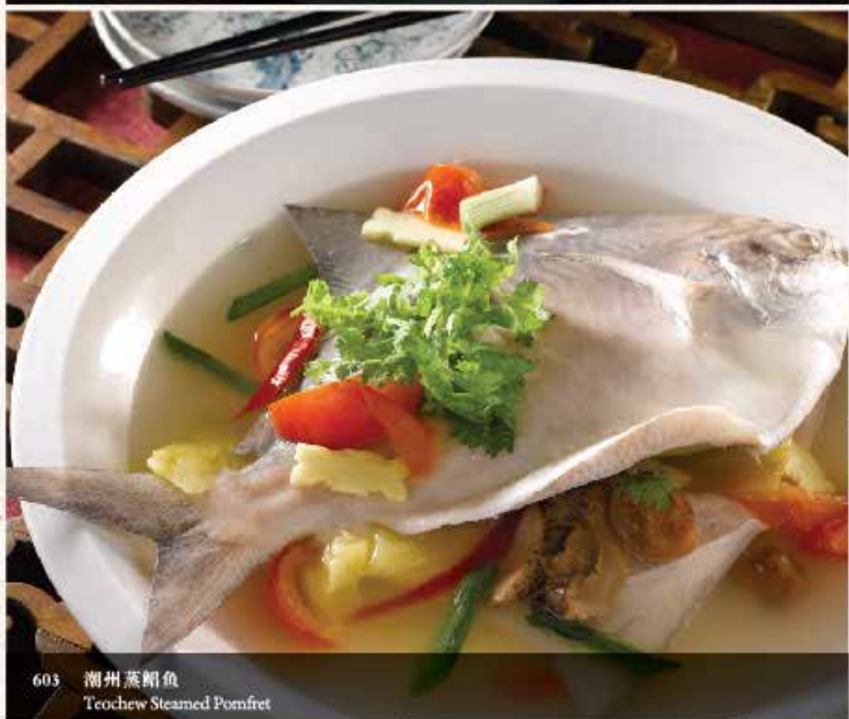
603 潮州蒸鮫魚 Teochew Steamed Pomfret