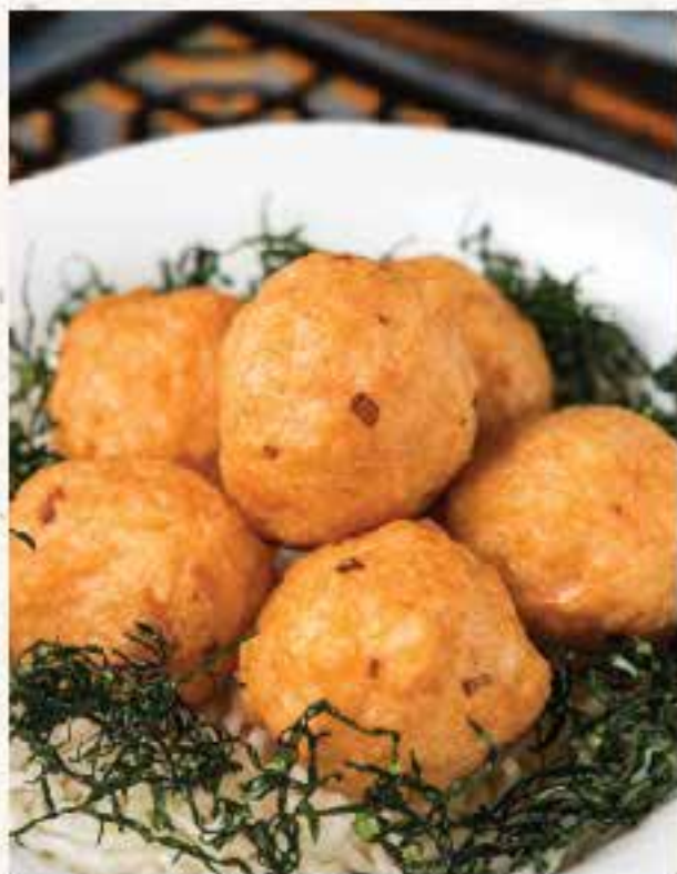
110 虾丸 Deep Fried Prawn Balls