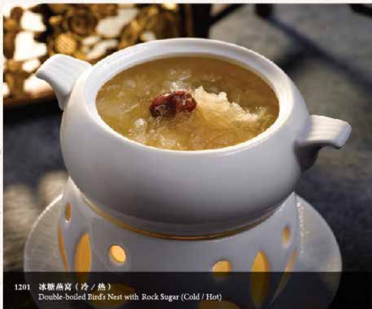
1201 冰糖燕窝 (冷/热) Double-boiled Bird's Nest with Rock Sugar (Cold / Hot)