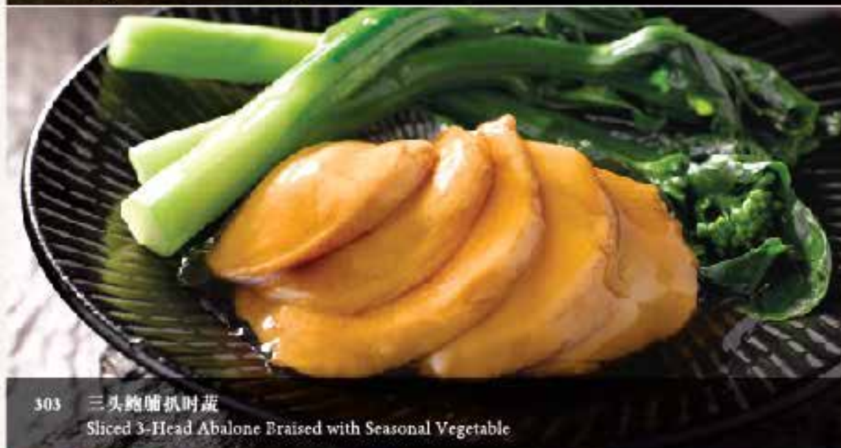
303 三头鲍脯扒时蔬 Sliced 3-Head Abalone Braised with Seasonal Vegetable