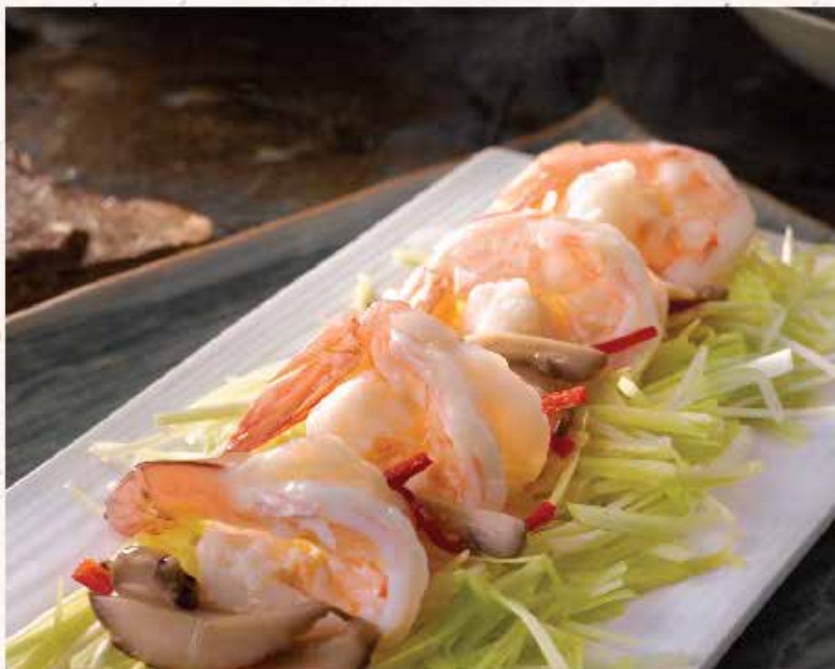
701C 潮州菜白炒大明虾球 Shelled King Prawns Stir Fried with Yellow Chives