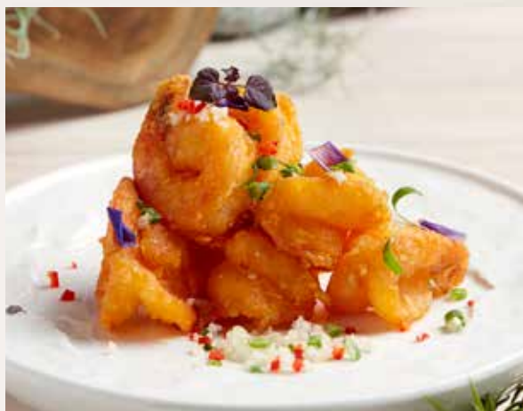
904F 虾球炒咸蛋金沙 Shelled Prawns Stir-fried with Golden Salted Egg