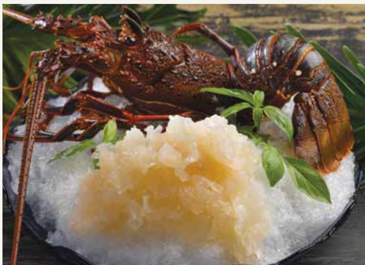
701A 澳洲龙虾刺身 Australian Lobster Sashimi

703 蒜蓉粉丝蒸竹蚌 Steamed Bamboo Clam with Minced Garlic and Glass Vermicelli 只 each (70g - 90g) $16 只 each (91g - 109g) $18 只 each (110g - 130g) $20