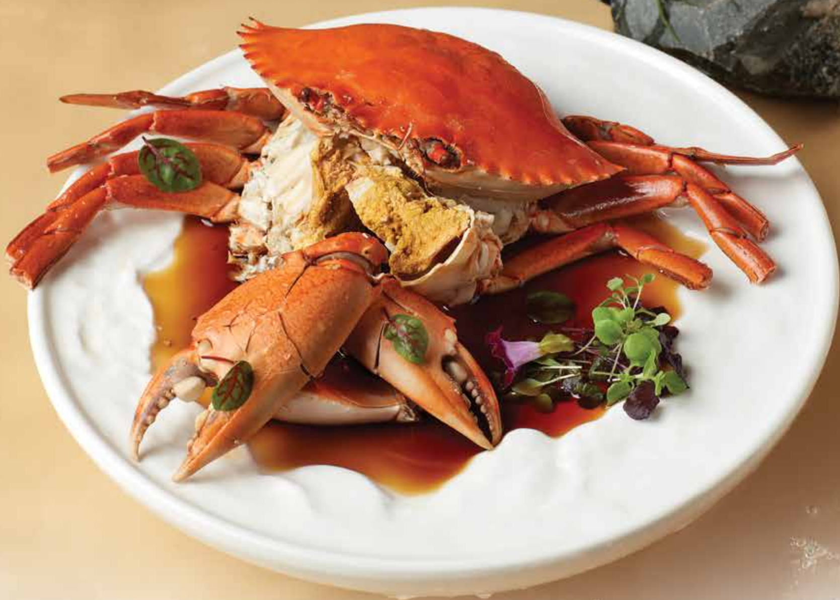
601 冻醉黄膏蟹 Chilled Roe Crab with Chinese Wine