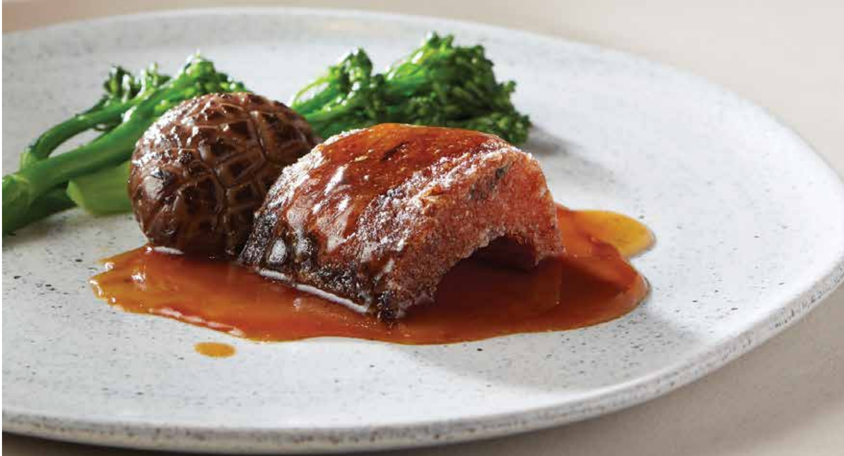
506 鲍汁脆皮海参扣花菇 Crispy Sea Cucumber and Shiitake Mushroom with Abalone Sauce