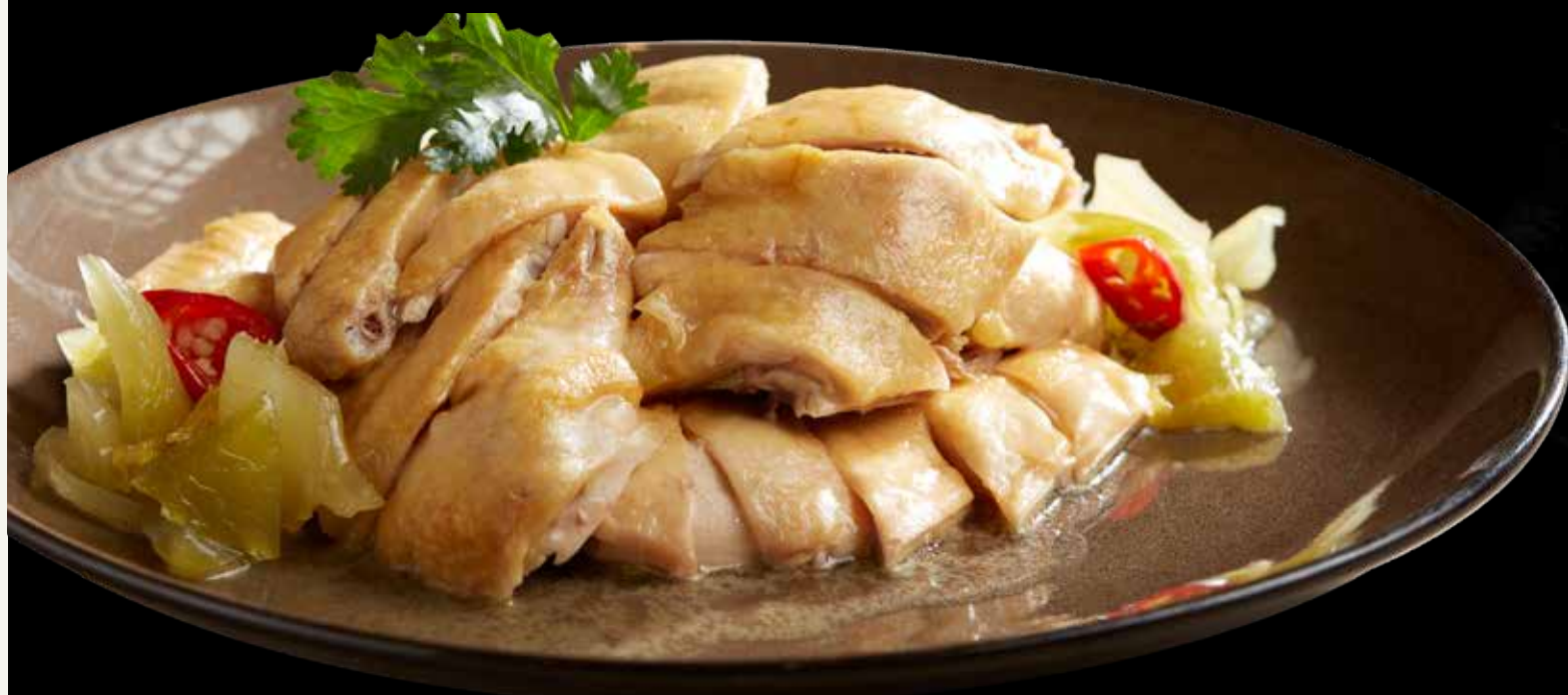
1103 普宁豆酱走地鸡 Teochew Puning Fermented Bean Free-range Chicken