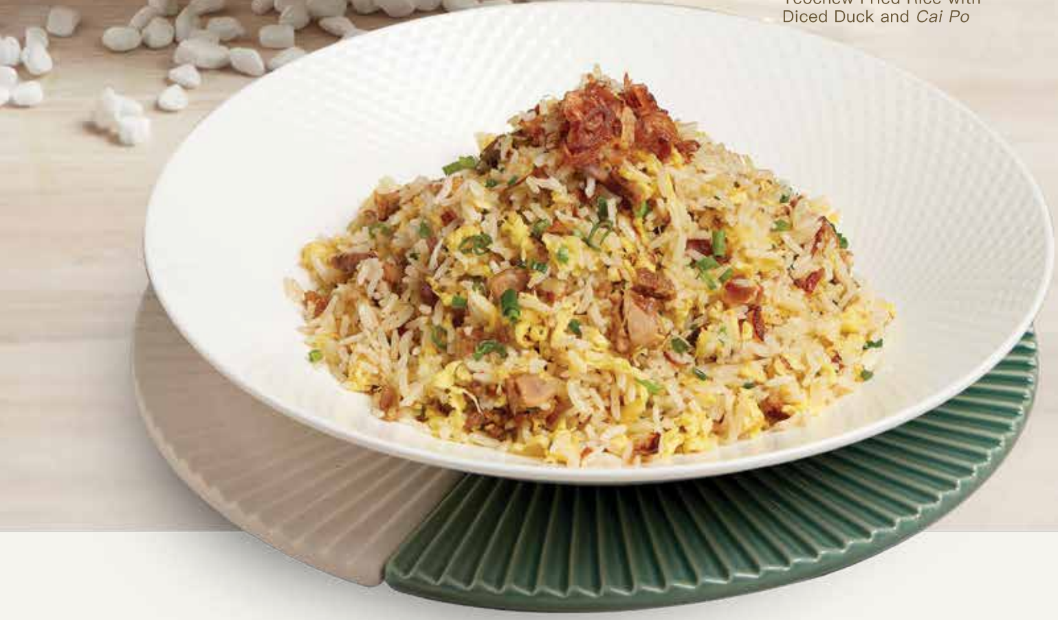
1305 潮州鸭粒菜脯炒饭 Teochew Fried Rice with Diced Duck and Cai Po