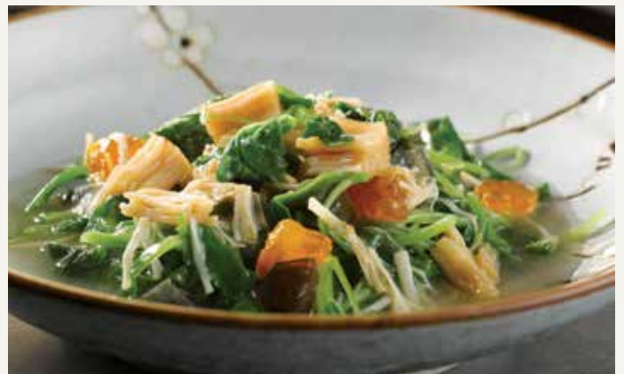
1206 干贝三色蛋苋菜苗 Poached Chinese Spinach with Conpoy and Trio Eggs