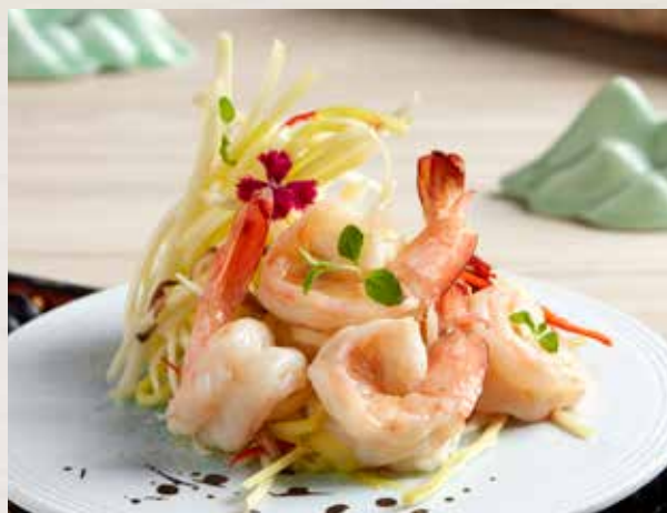
903E 大明虾球炒潮州菜白 Shelled King Prawns Stir-fried with Yellow Chives