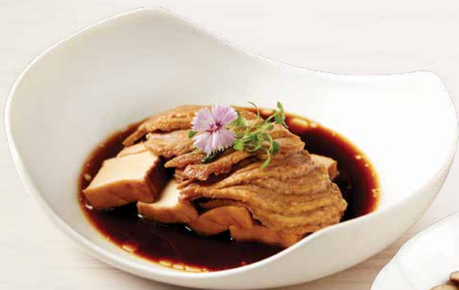
102 卤鸭拼豆干 Braised Duck with Beancurd