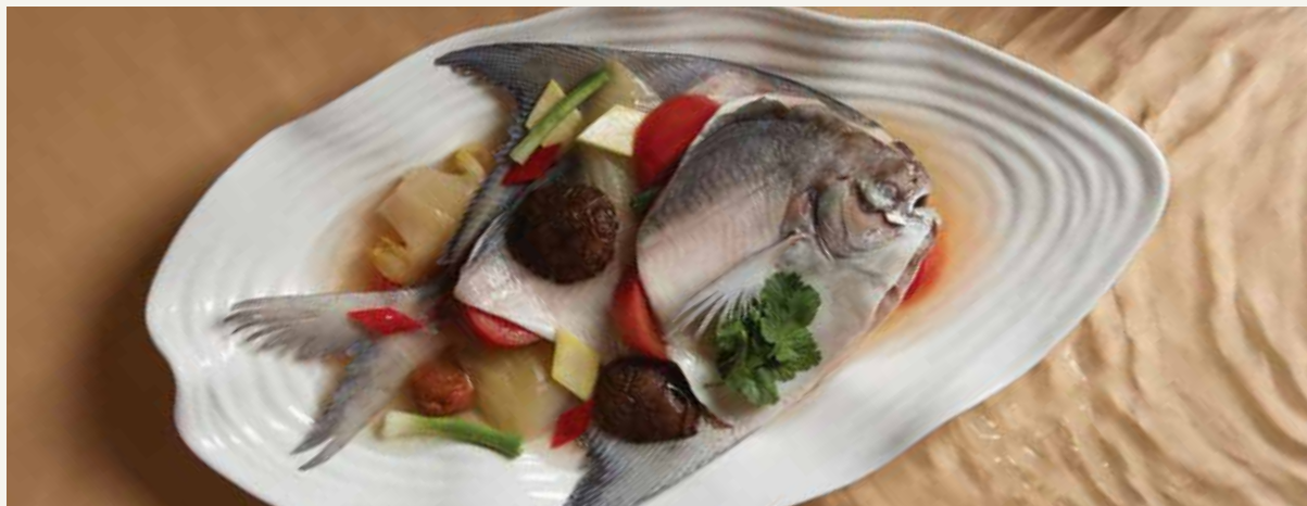
805 潮州蒸鲳鱼 Fresh Pomfret Steamed in Teochew Style