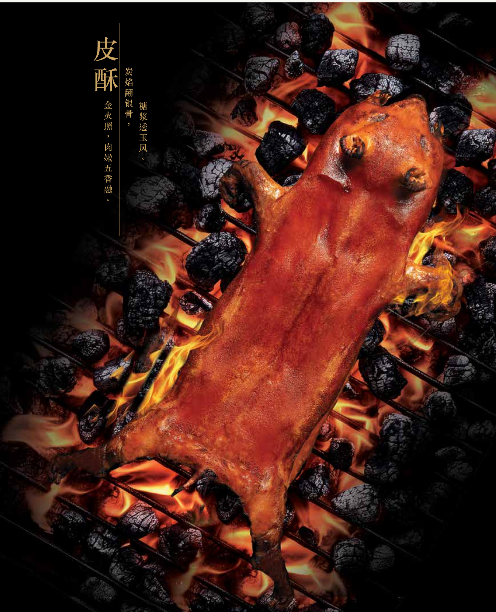
1101 潮州五香乳猪 Teochew Five-spice Suckling Pig

我们的食物可能含有或接触过（包含但不限于）牛奶，鸡蛋，鱼，贝类，坚果，花生，小麦和大豆。如果您有任何担忧，请与我们的服务员联络。服务费与消费税另计。照片只供参考之用。Our food may contain or come into contact with (but not limited to) milk, egg, fish, shellfish, tree nut, peanuts, wheat and soybeans. Please speak to our service staff if you have any concerns. Prices are subject to service charge and prevailing GST. Photos are for illustration purposes only.