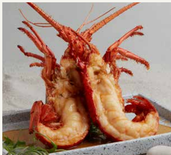
701D 澳洲龙虾上汤焗 Australian Lobster Braised with Superior Broth