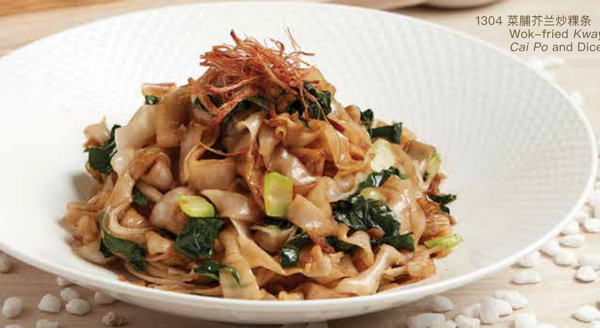
1304 菜脯芥兰炒粿条 Wok-fried Kway Teow with Cai Po and Diced Kai Lan