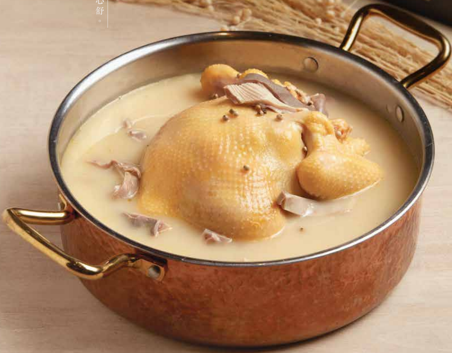
403 胡椒猪肚鸡汤 Peppery Pig's Stomach and Chicken Soup