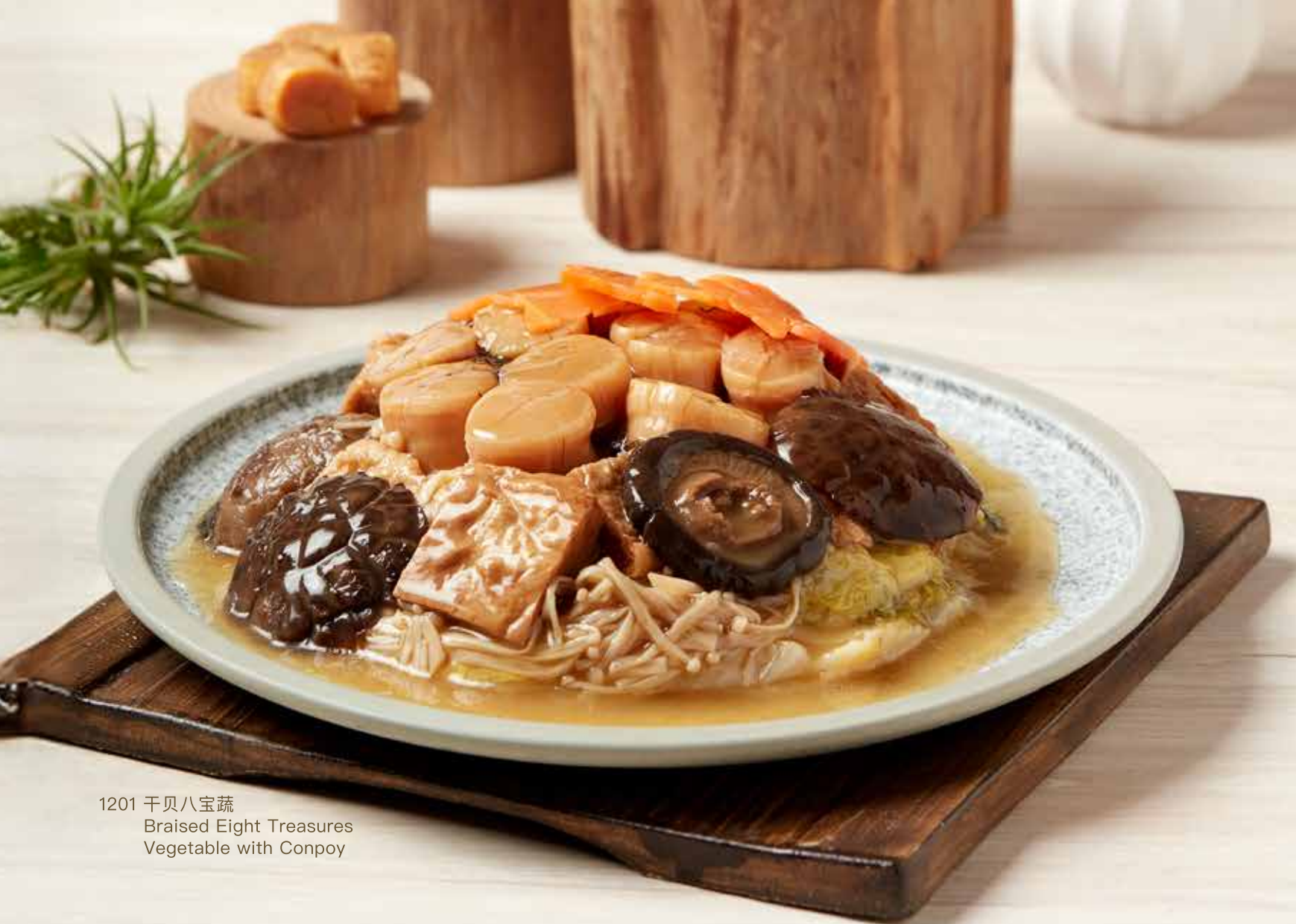
1201 干贝八宝蔬 Braised Eight Treasures Vegetable with Conpoy

醉 1201 干贝八宝蔬 Braised Eight Treasures Vegetable with Conpoy 小 S $38 中 M $57 | 大 L $76