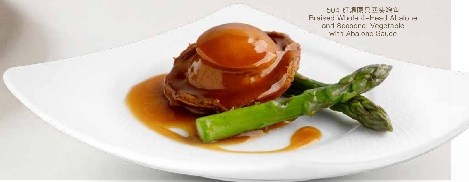
504 红煨原只四头鲍鱼 Braised Whole 4-Head Abalone and Seasonal Vegetable with Abalone Sauce