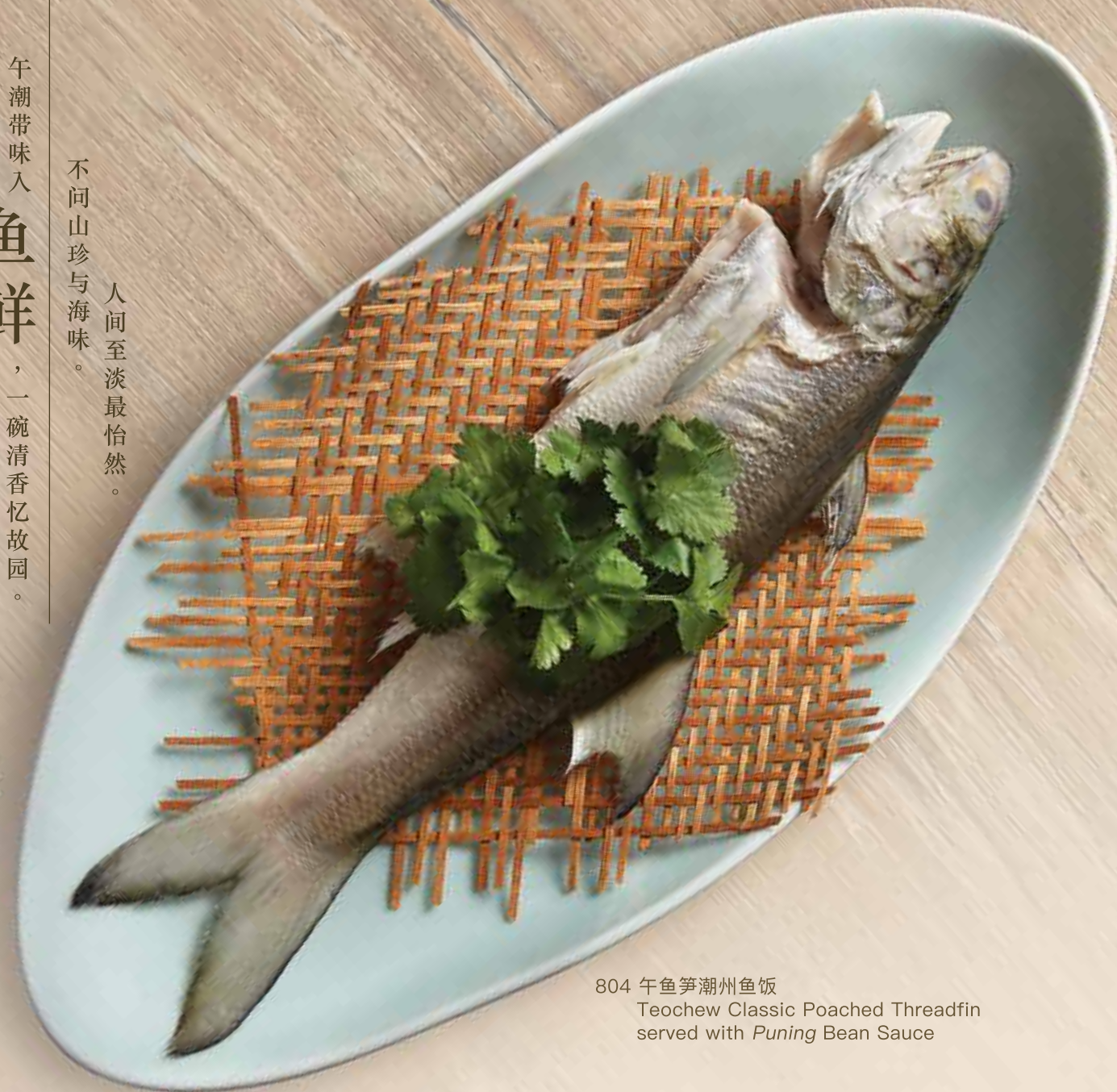
804 午鱼笋潮州鱼饭 Teochew Classic Poached Threadfin served with Puning Bean Sauce