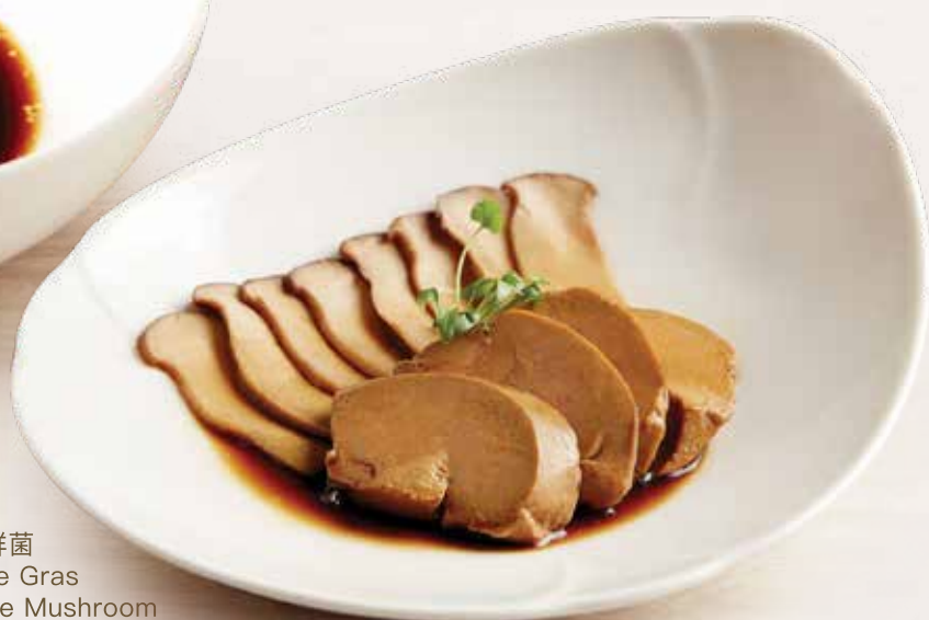
103 卤水鹅肝拼鲜菌 Braised Foie Gras with Abalone Mushroom