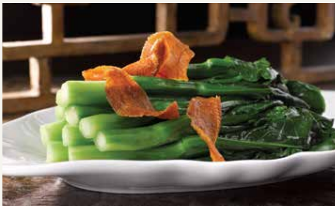
1205 地鱼芥兰 Stir-fried Kai Lan with Crispy Dried Sole Fish