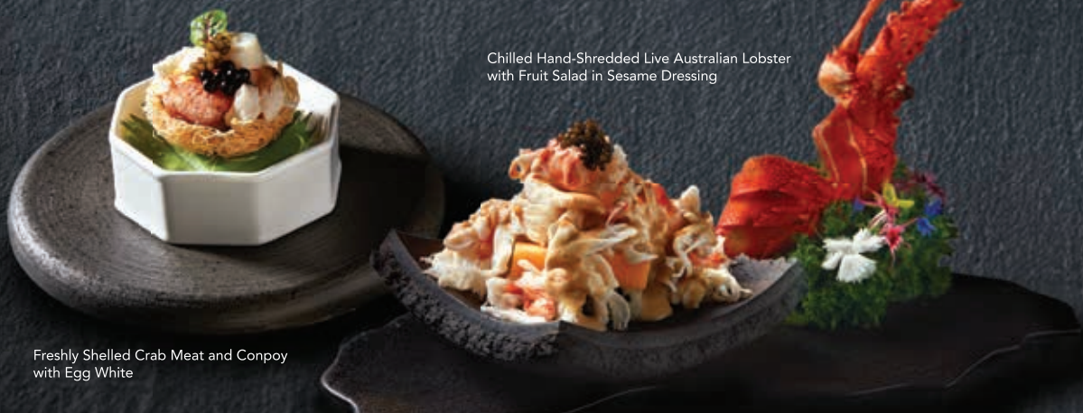
Freshly Shelled Crab Meat and Conpoy with Egg White