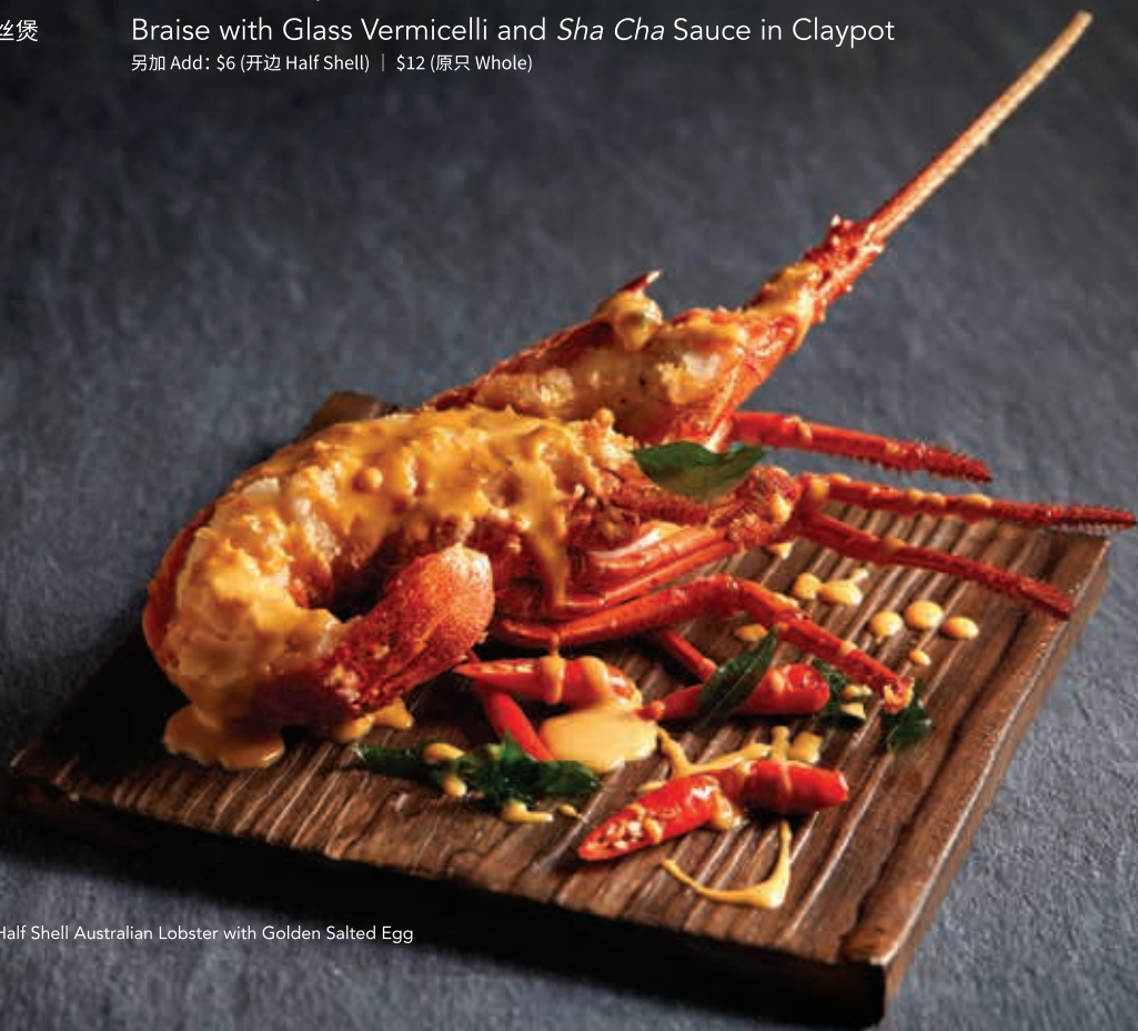
Stir-fried Half Shell Australian Lobster with Golden Salted Egg

另加 Add: $6 (开边 Half Shell) | $12 (原只 Whole)