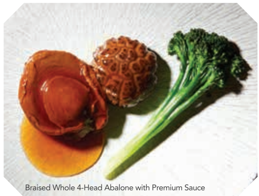
Braised Whole 4-Head Abalone with Premium Sauce

Our food may contain or come into contact with (but not limited to) milk, egg, fish, shellfish, tree nuts, peanuts, wheat and soybeans. Please speak to our service staff if you have any concerns. Prices are subject to service charge and prevailing GST.