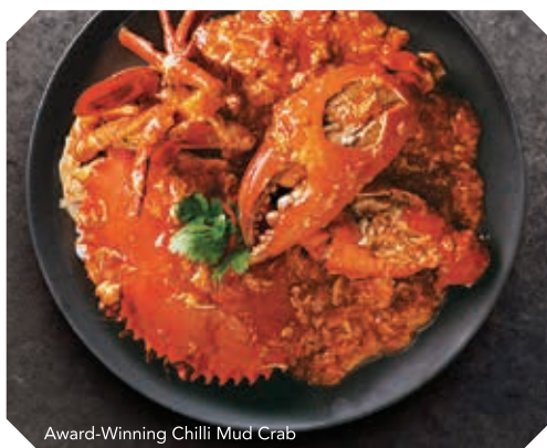
Award-Winning Chilli Mud Crab