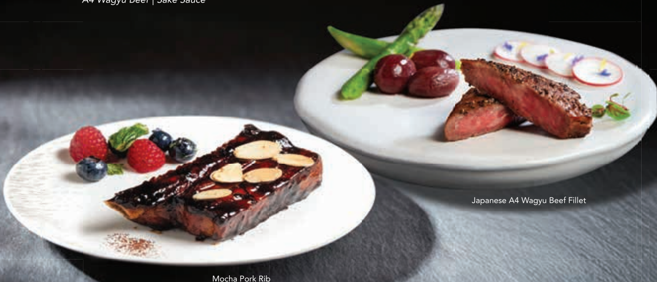
Mocha Pork Rib