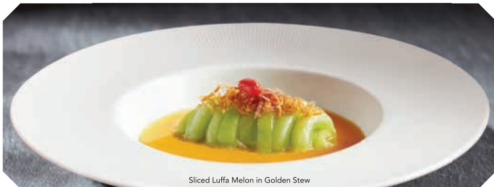
Sliced Luffa Melon in Golden Stew

X.O. 酱炒 (+2) Stir-fry with X.O. Sauce (+2)