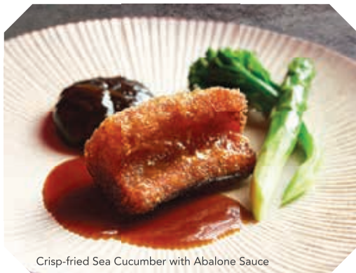
Crisp-fried Sea Cucumber with Abalone Sauce