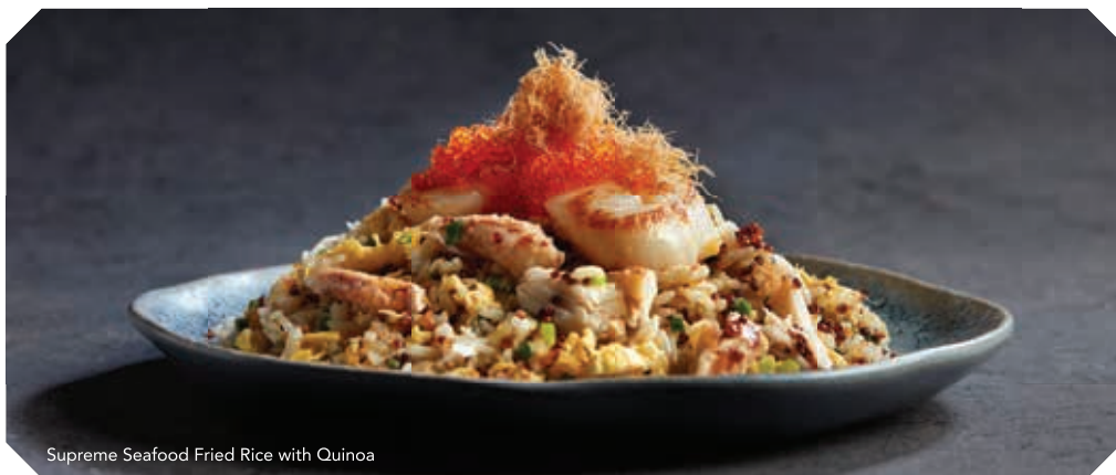
Supreme Seafood Fried Rice with Quinoa

Australian Abalone | Dashi Stock | Sesame Seeds