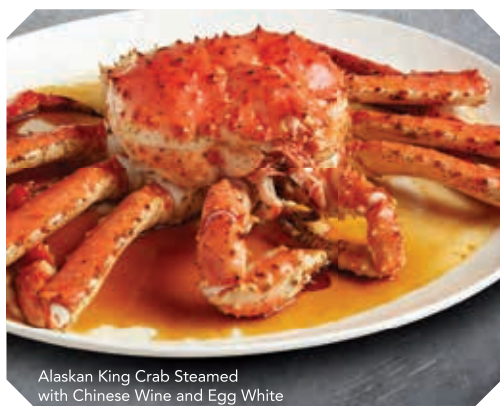
Alaskan King Crab Steamed with Chinese Wine and Egg White