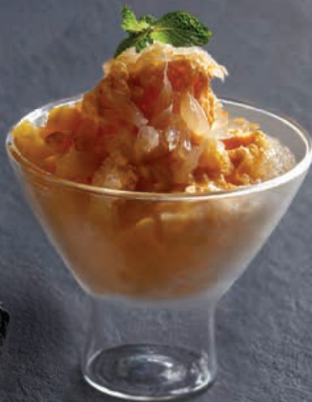
Chilled Mango Sago Pomelo