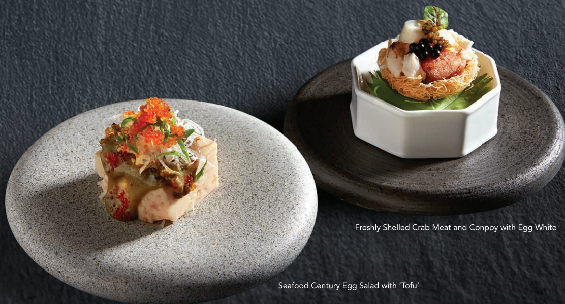
Freshly Shelled Crab Meat and Conpoy with Egg White