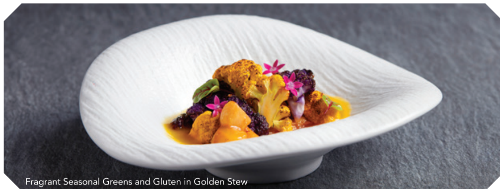
Fragrant Seasonal Greens and Gluten in Golden Stew

X.O. 酱炒 (+2) Stir-fry with X.O. Sauce (+2)