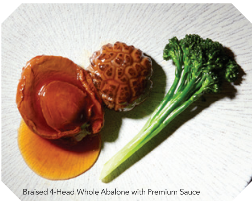
Braised 4-Head Whole Abalone with Premium Sauce

Our food may contain or come into contact with (but not limited to) milk, egg, fish, shellfish, tree nuts, peanuts, wheat and soybeans. Please speak to our service staff if you have any concerns. Prices are subject to service charge and prevailing GST.