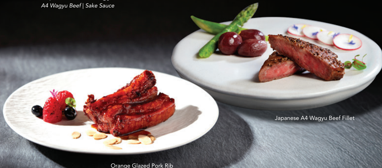
Orange Glazed Pork Rib