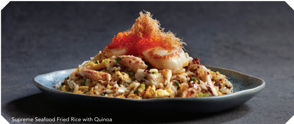
Supreme Seafood Fried Rice with Quinoa

清汤稻庭乌冬面配5头鲍脯 62 澳洲鲍鱼 | 日式清汤 | 芝麻 Sliced 5-Head Abalone with Inaniwa Udon in Clear Stock Australian Abalone | Dashi Stock | Sesame Seeds