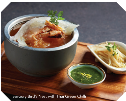
Savoury Bird's Nest with Thai Green Chilli

18-Head South Africa Dried Abalone | Shiitake Mushroom | Seasonal Greens