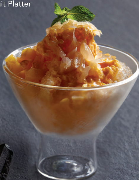
Chilled Mango Sago Pomelo