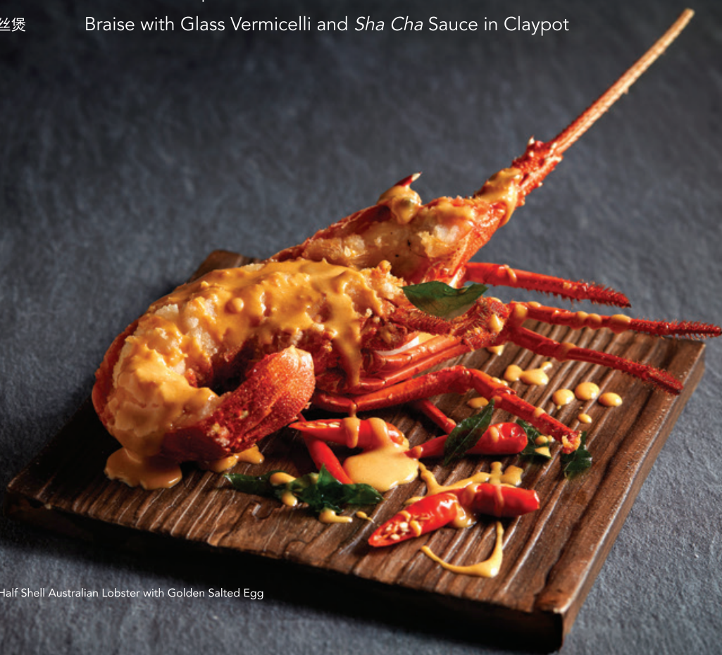
Stir-fried Half Shell Australian Lobster with Golden Salted Egg

Braise with Glass Vermicelli and Sha Cha Sauce in Claypot