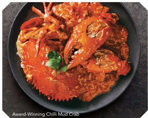
Award-Winning Chilli Mud Crab

我们的食物可能含有或接触过 (包含但不限于) 牛奶, 鸡蛋, 鱼, 贝类, 坚果, 花生, 小麦和大豆。如果您有任何担忧, 请与我们的服务员联系。不包括服务费及消费税。