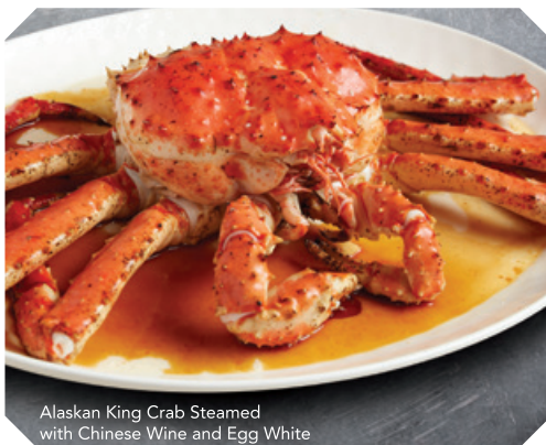
Alaskan King Crab Steamed with Chinese Wine and Egg White