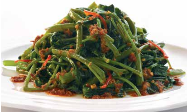
406. 马来风光 Kang Kong Stir Fried with Sambal