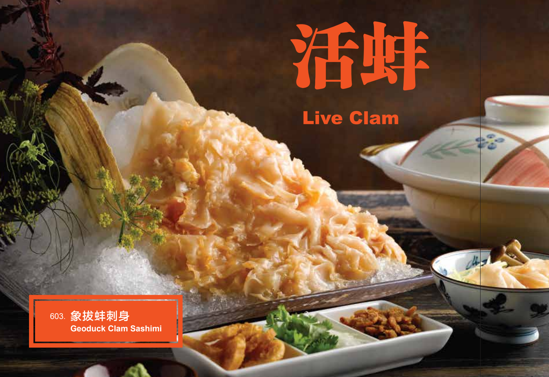
603. 象拔蚌刺身 Geoduck Clam Sashimi