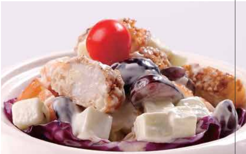
食 105. 鲜果生汁油条 Seafood Donut Tossed in Salad Cream