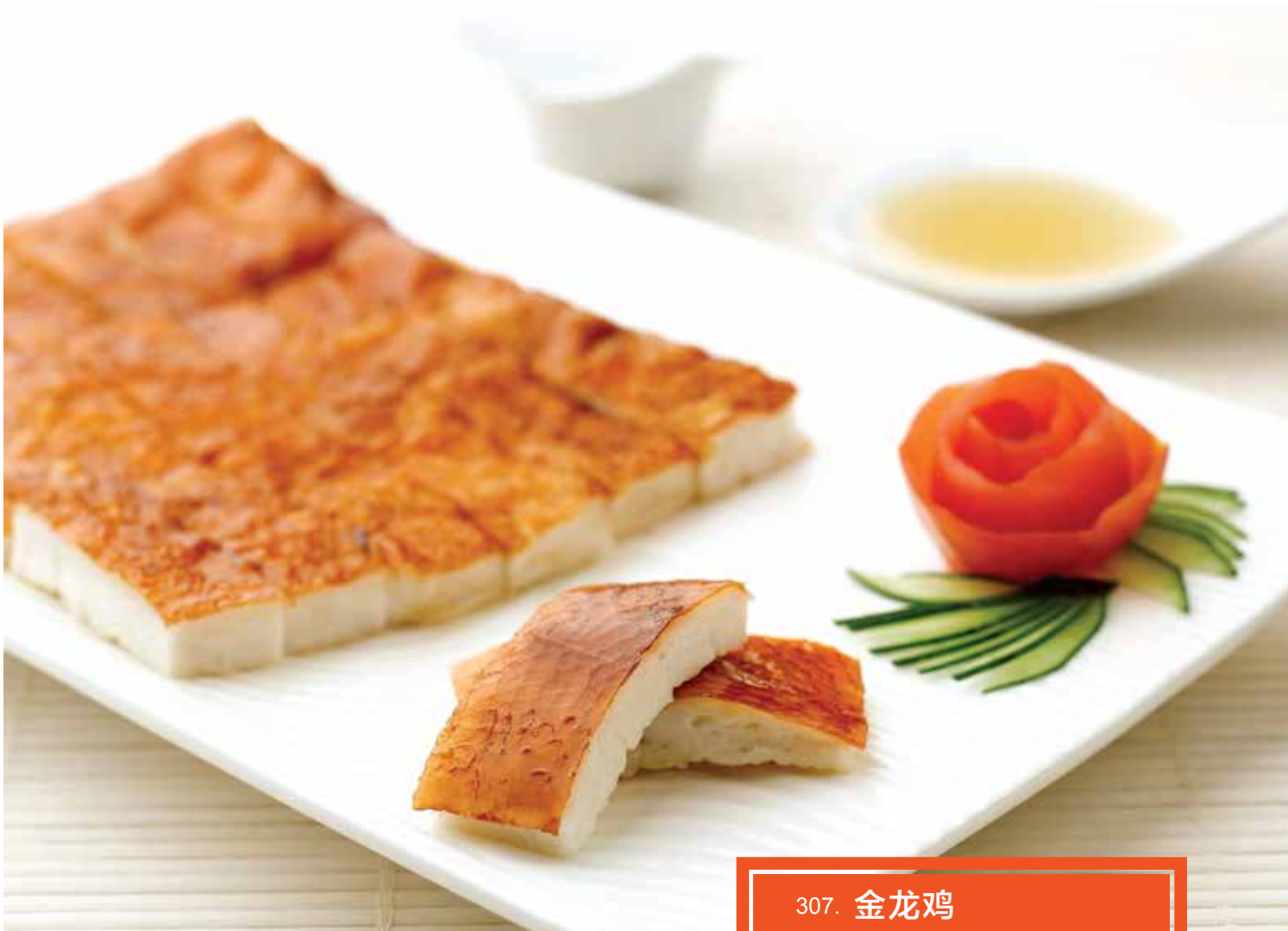
307. 金龙鸡 Golden Phoenix Chicken