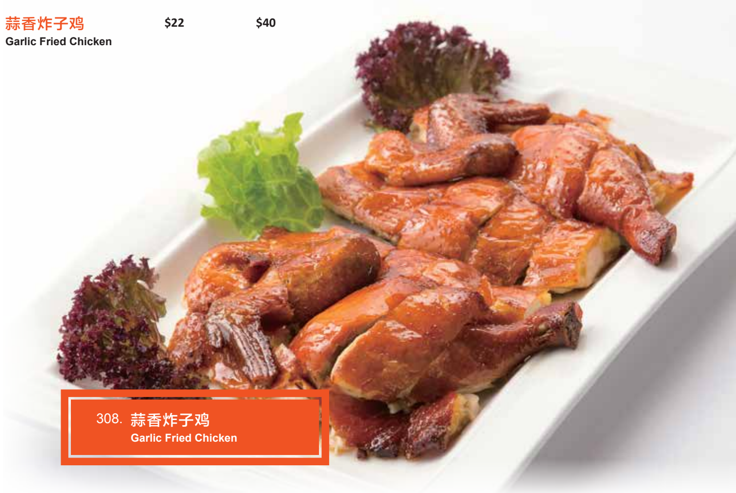
308. 蒜香炸子鸡 Garlic Fried Chicken