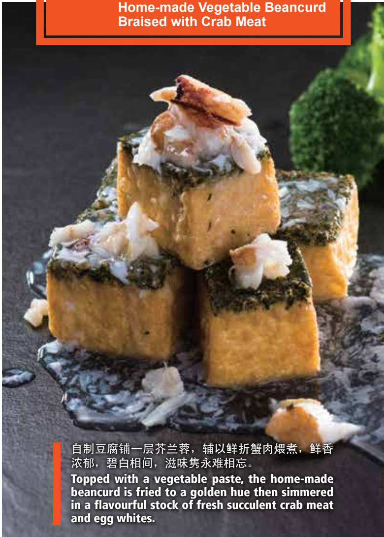
食 401. 蟹肉扒翡翠豆腐 Home-made Vegetable Beancurd Braised with Crab Meat

自制豆腐铺一层芥兰蓉，辅以鲜折蟹肉煨煮，鲜香浓郁，碧白相间，滋味隽永难相忘。 Topped with a vegetable paste, the home-made beancurd is fried to a golden hue then simmered in a flavourful stock of fresh succulent crab meat and egg whites.