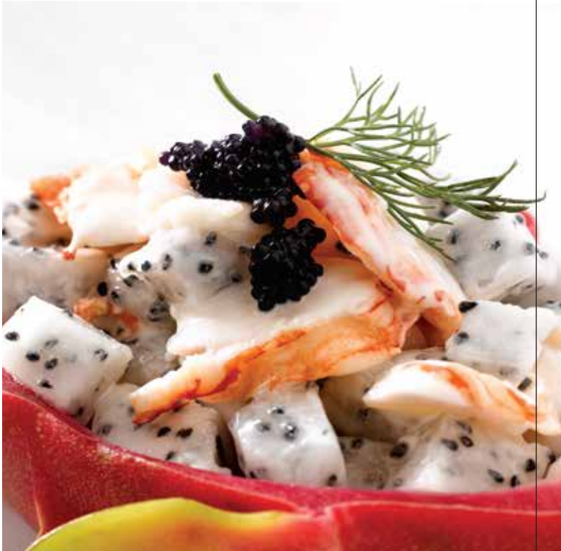
食 102. 鱼子酱龙珠果龙虾沙律 Dragonfruit Lobster Salad with Lumpfish Caviar

106. 咸蛋金沙虾吧 $9.80 Golden Salted Egg Prawn Chins