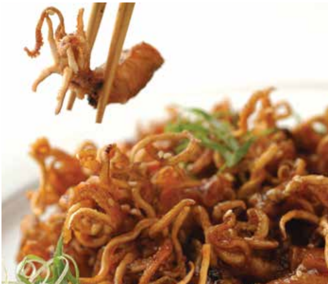
食 506. 脆炸苏东仔 Crispy Fried Baby Squid