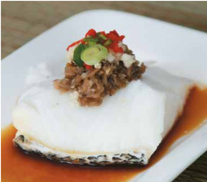
食 503. 剁椒菜脯蒸鳕鱼 Cod Fish Steamed with Preserved Radish and Diced Chilli