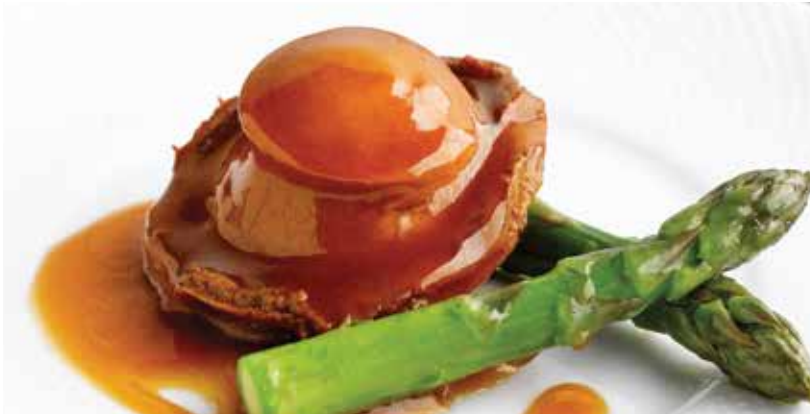
210. 红煨原只四头鲜鲍 Whole 4-Head Abalone Braised with Abalone Sauce and Seasonal Vegetable