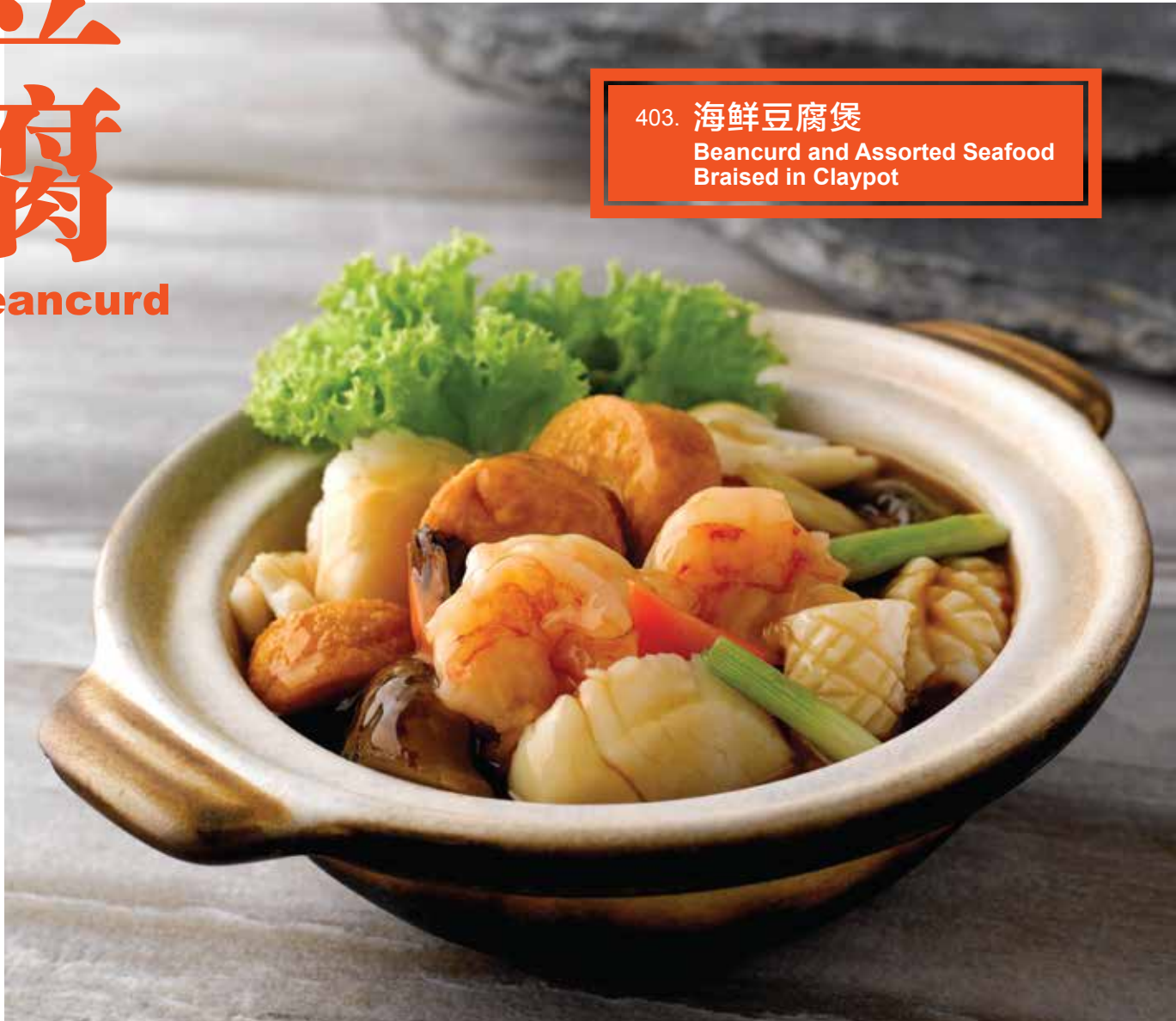
403. 海鲜豆腐煲 Beancurd and Assorted Seafood Braised in Claypot