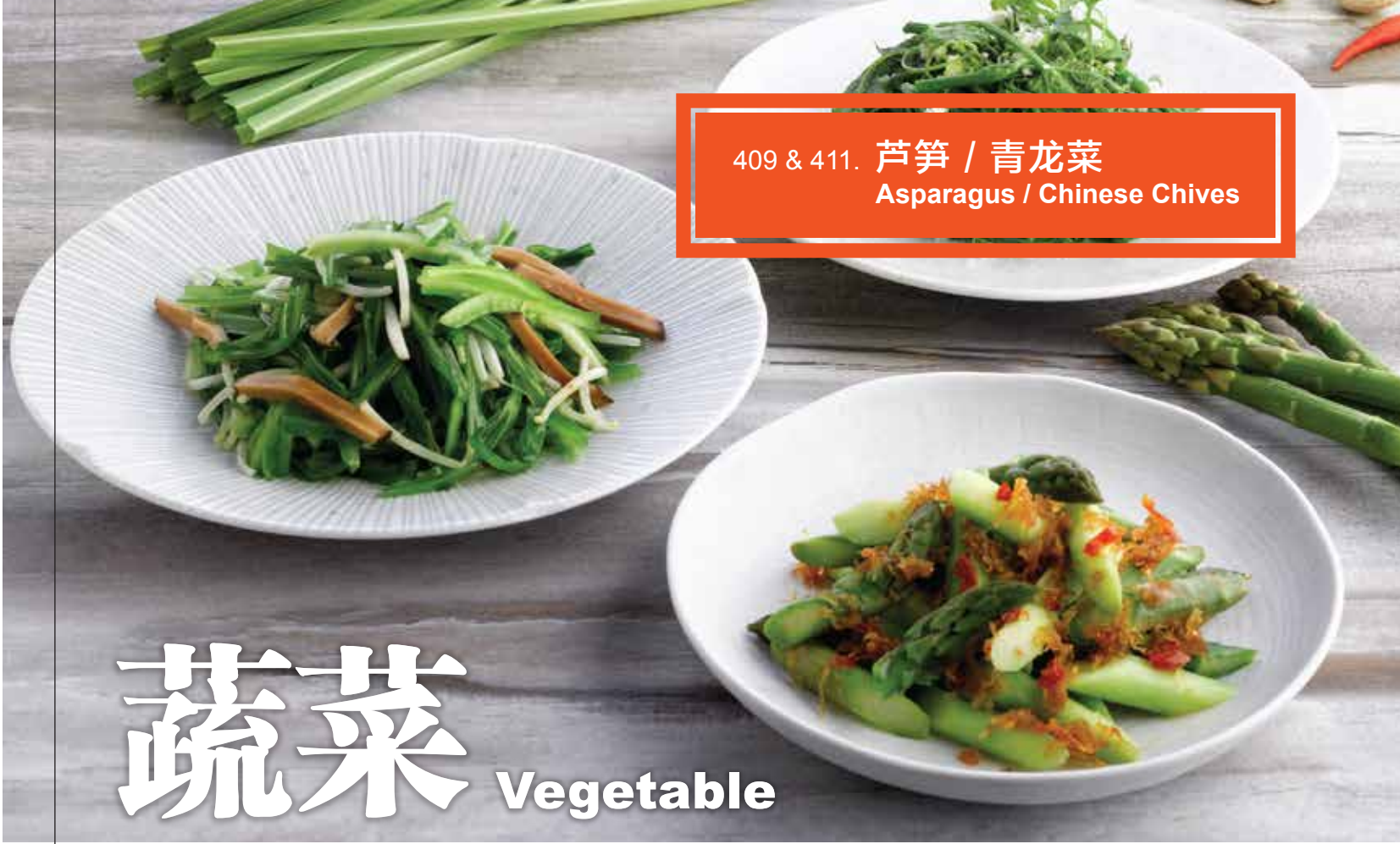
409 & 411. 芦笋 / 青龙菜 Asparagus / Chinese Chives