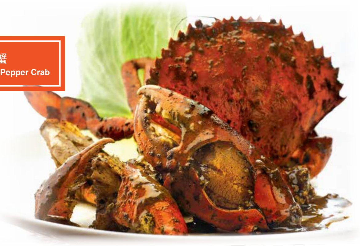
B. 招牌黑胡椒蟹 Signature Black Pepper Crab