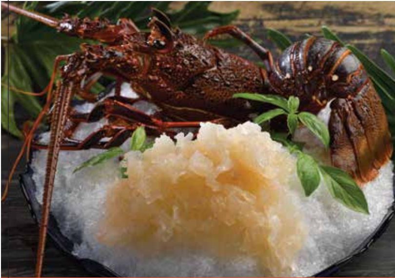
601A. 澳洲龙虾刺身 Australian Lobster Sashimi

A deceptively simple dish that truly exhibits the natural nectar of fresh, live seafood; Boston lobster is carefully braised in superior stock, the sweet broth itself brewed for at least 6 hours with a variety of rich ingredients including premium pork, Yunnan ham and pig skin.