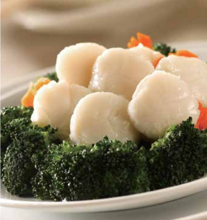
405. 带子炒西兰花 Broccoli Stir Fried with Scallops