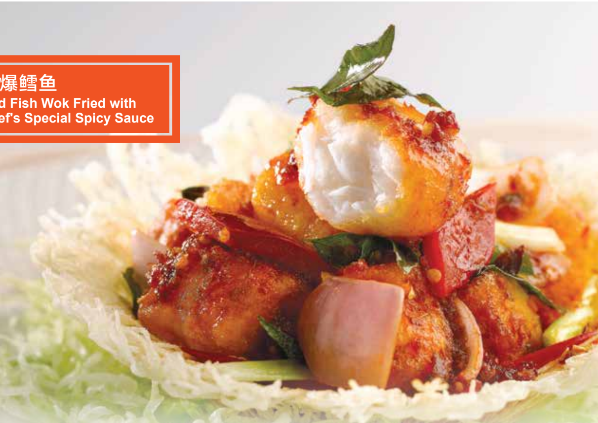
食 501. 酱爆鳕鱼 Cod Fish Wok Fried with Chef's Special Spicy Sauce

色泽金黄的鳕鱼块辅以辛辣的东南亚特色酱料，外层香辣酥脆，内里细腻鲜美！ This delicious creation of golden cod fish ingots is glazed with a piquant sauce made from a blend of exotic Southeast Asian spices, crusty on the outside, whilst moist and tender within.