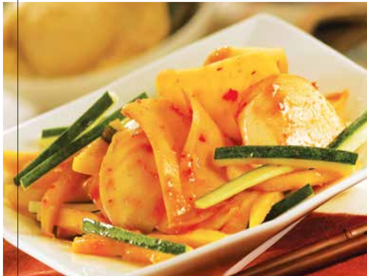
208. 生捞鲍片 Chilled Sliced Abalone with Chef's Special Sauce

在厨师们的巧手之下，金黄色的南瓜和新鲜的上等海鲜，如扇贝和虾，都会摇身一变成香甜诱人的金汤，保证让食客们胃口大增。 Whet your appetite with a pot of liquid sunshine: this rich, velvety golden soup showcases a medley of premium seafood ingredients; the sweetness of fresh scallops and prawns against a backdrop of creamy, ambrosial pumpkin.