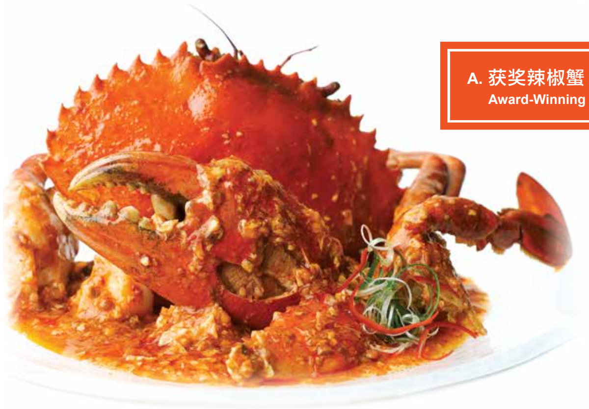
A. 获奖辣椒蟹 Award-Winning Chilli Crab