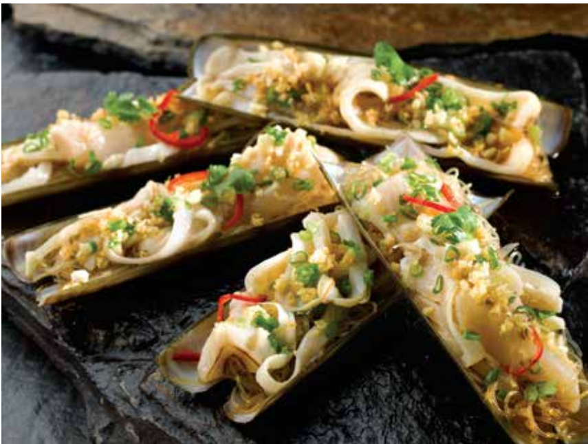
606. 蒜蓉蒸竹蚌 Bamboo Clam Steamed with Minced Garlic