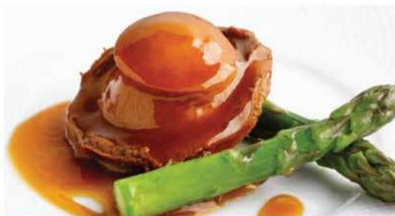
209. 红煨原只四头鲜鲍 Whole 4-Head Abalone Braised with Abalone Sauce and Seasonal Vegetable