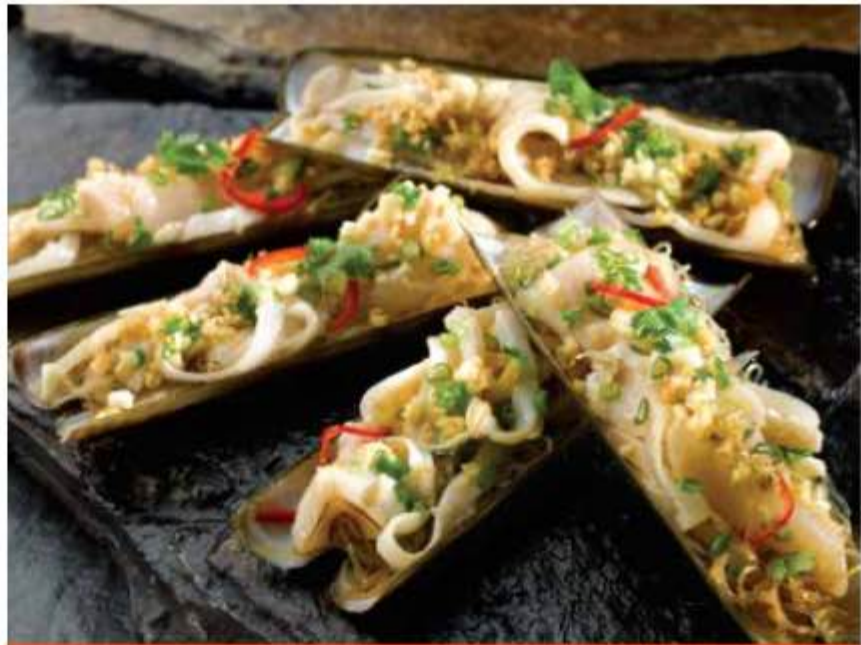
606. 蒜蓉蒸竹蚌 Bamboo Clam Steamed with Minced Garlic