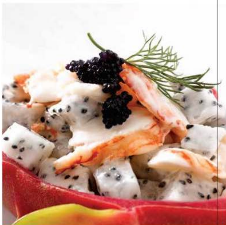
🍴 102. 鱼子酱龙珠果龙虾沙律 Dragonfruit Lobster Salad with Lumpfish Caviar