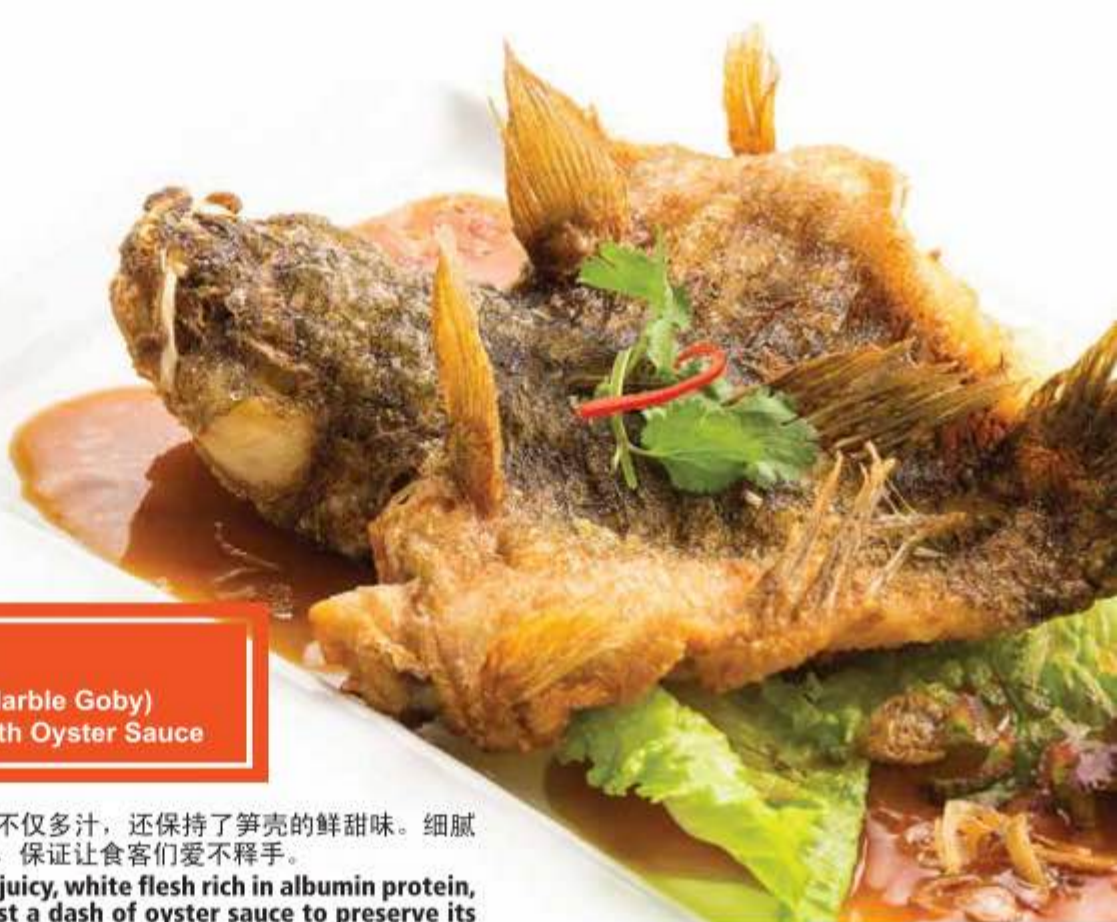
🍽️ 703D. 油浸笋壳 Soon Hock (Marble Goby) Deep Fried with Oyster Sauce

鲜嫩的笋壳在厨师的巧手下不仅多汁，还保持了笋壳的鲜甜味。细腻的肉质经过油炸后更有弹性，保证让食客们爱不释手。