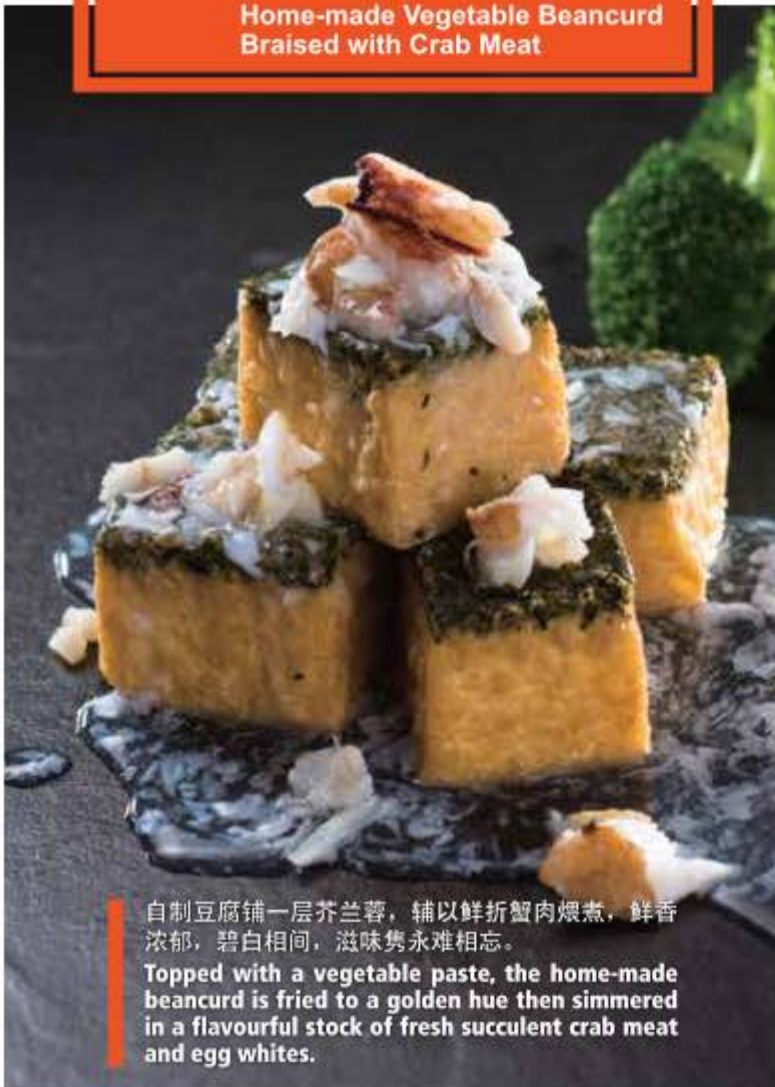
401. 蟹肉扒翡翠豆腐 Home-made Vegetable Beancurd Braised with Crab Meat