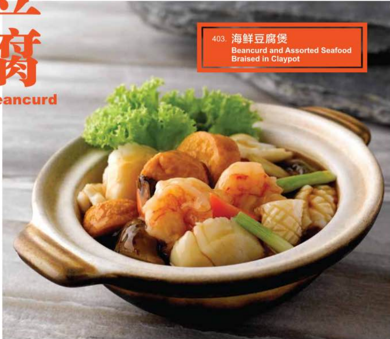
403. 海鲜豆腐煲 Beancurd and Assorted Seafood Braised in Claypot