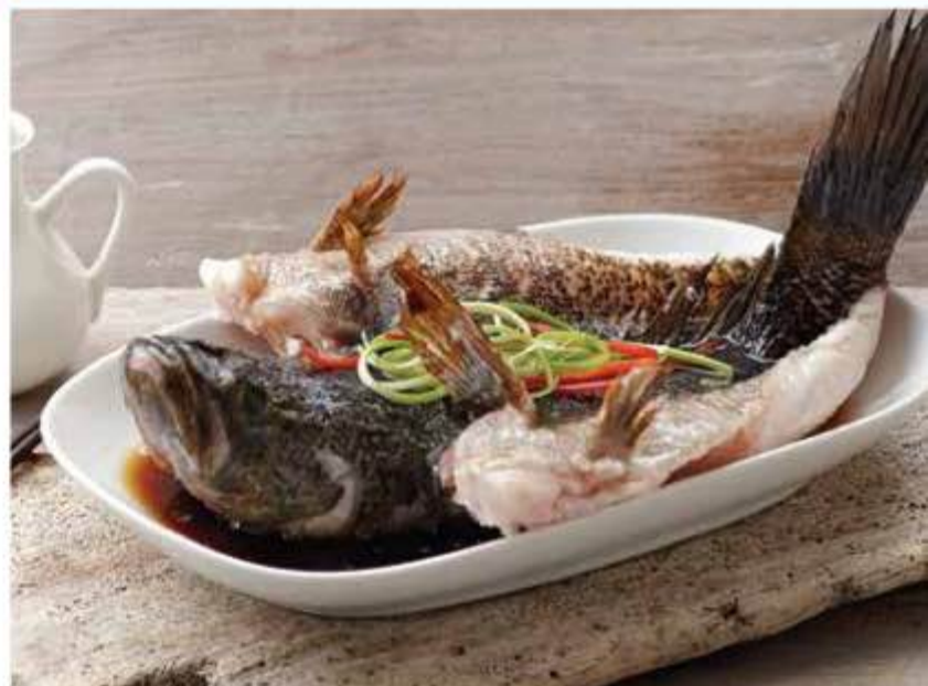
703A. 清蒸笋壳 Soon Hock (Marble Goby) Steamed with Soya Sauce