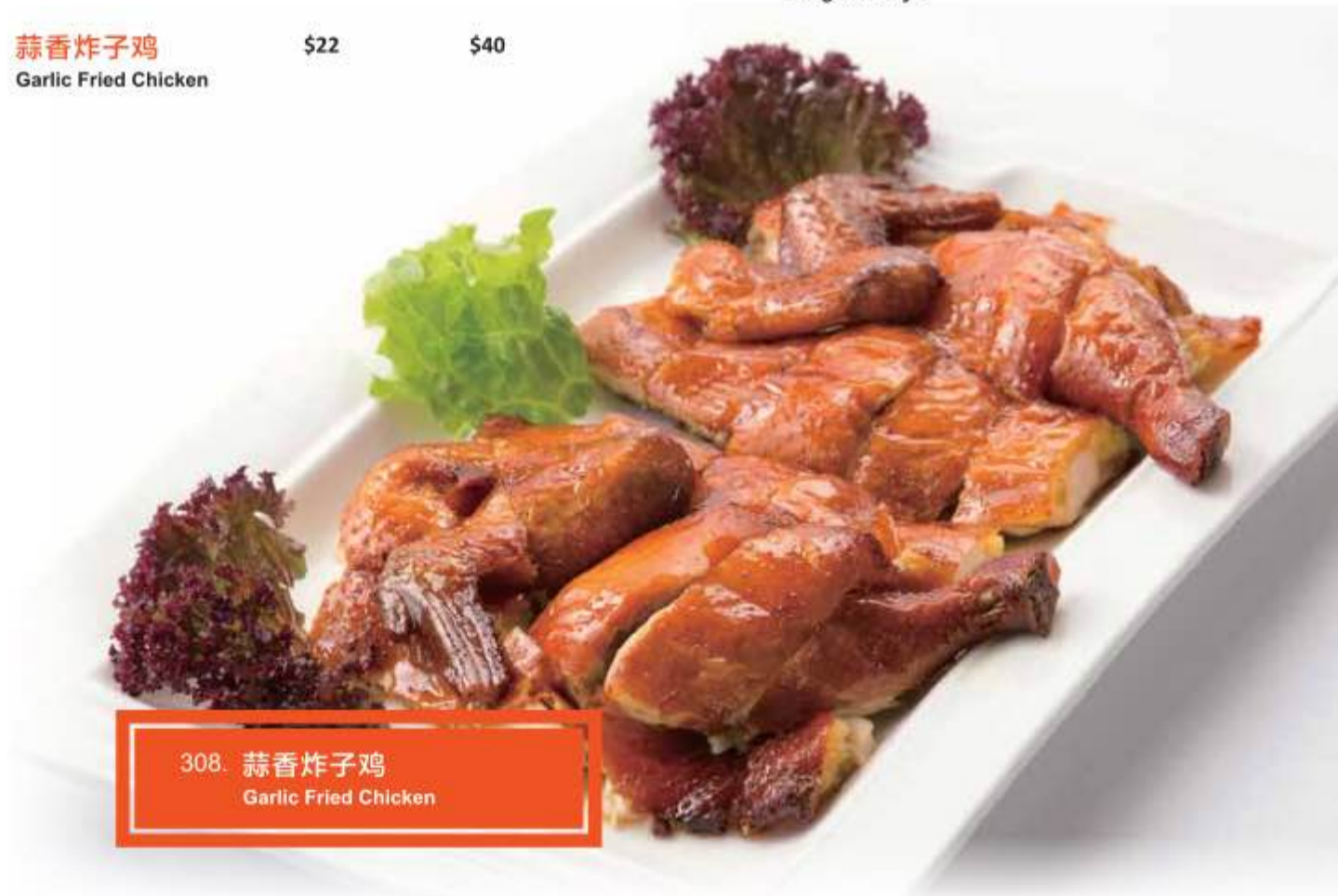
308. 蒜香炸子鸡 Garlic Fried Chicken