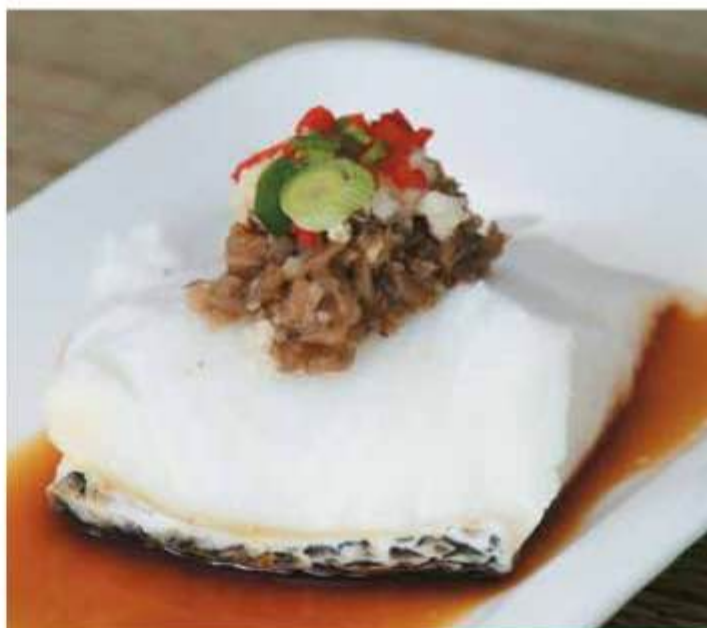
食 503. 剁椒菜脯蒸鳕鱼 Cod Fish Steamed with Preserved Radish and Diced Chilli