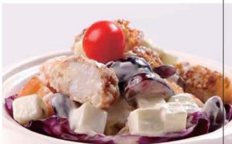
🍴 105. 鲜果生汁油条 Seafood Donut Tossed in Salad Cream