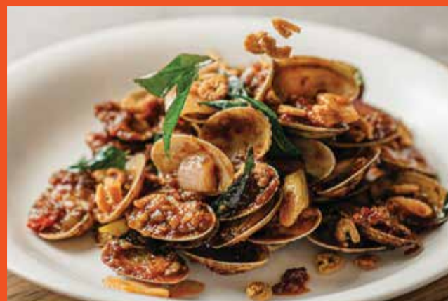
02 甘香啦啦 Live Korean Clam Stir Fried 'Kum Hiong' Style