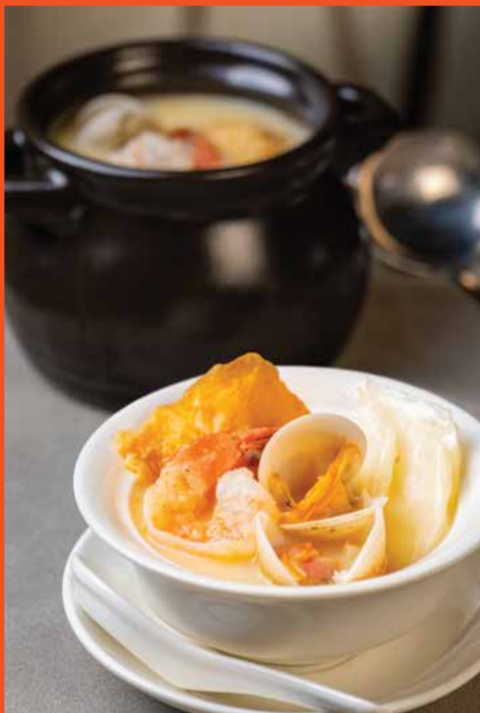
01 三宝汤 Trio Seafood Treasures in Superior Stock