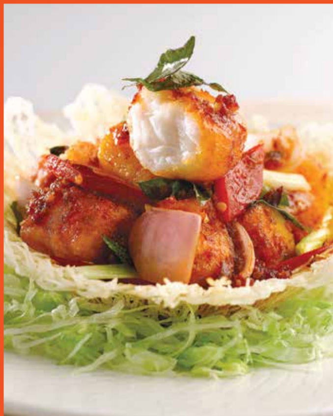
05 酱爆鳕鱼 Cod Fish Wok Fried with Chef's Special Sauce