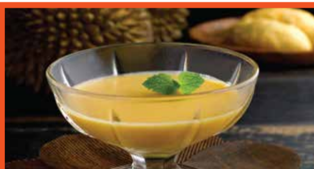
10 猫山王榴梿布丁 Mao Shan Wang Durian Pudding