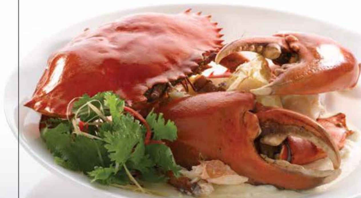
D. 花雕蛋白蒸蟹 Steamed Crab with Chinese Wine and Egg White

爱吃螃蟹的行家都会以螃蟹的鲜甜味为主，坚决选择吃蒸蟹。厨师们采用了豆浆，花雕酒和蛋白让蒸蟹显得更为突出。花雕酒不仅提升螃蟹的鲜味，也带出豆浆和蛋白的纤细口感，凸显出蟹肉的甜味。