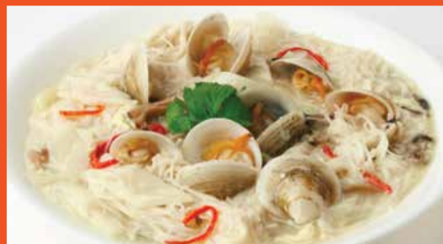
06 啦啦焖米粉 Live Korean Clam Braised 'Bee Hoon' in Aromatic Broth