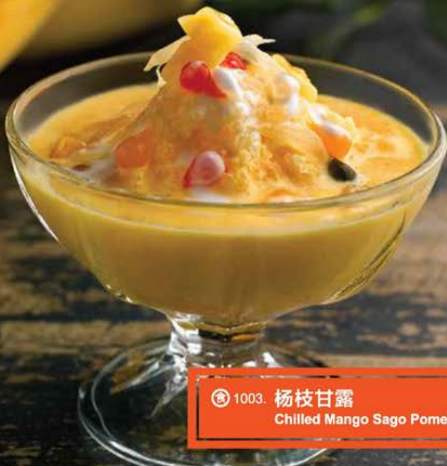
🍽️ 1003. 杨枝甘露 Chilled Mango Sago Pomelo