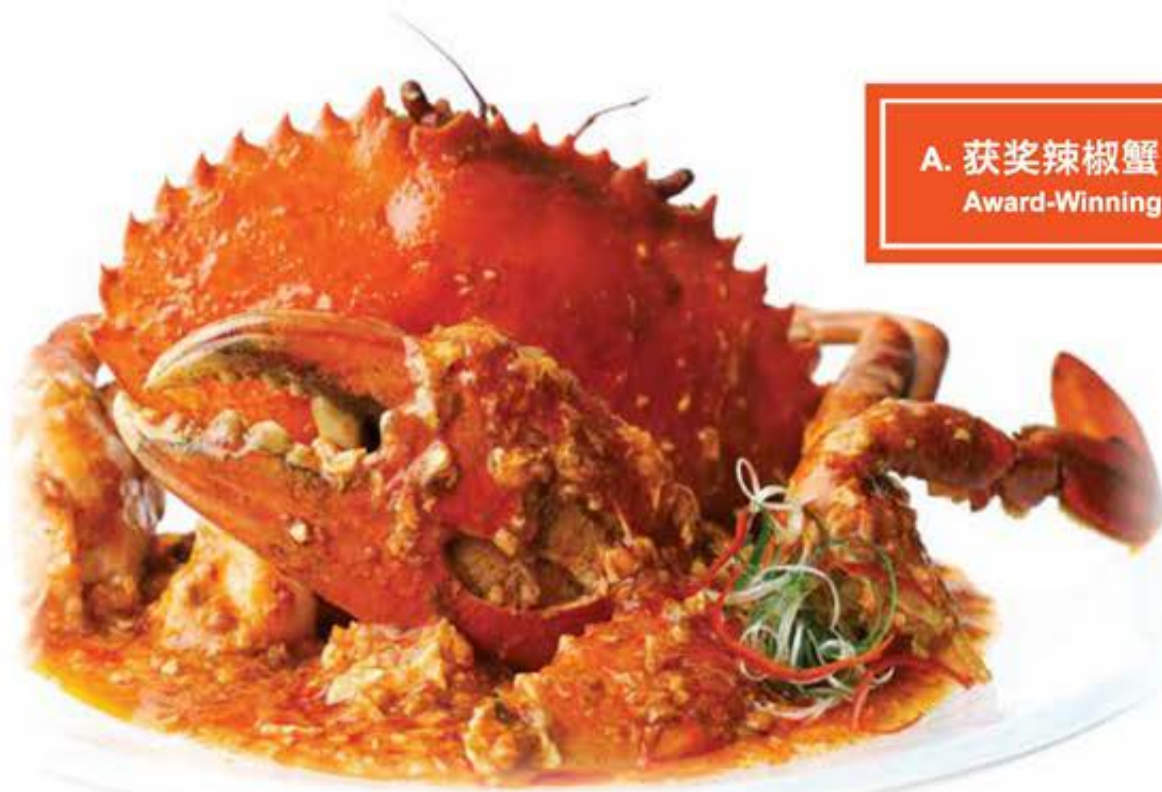
A. 获奖辣椒蟹 Award-Winning Chilli Crab