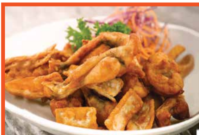
04 干炸田鸡 Crispy Fried Frog Leg with Sliced Ginger