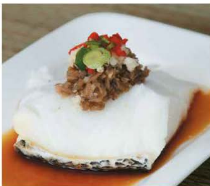
⑤ 503. 剁椒菜脯蒸鳕鱼 Cod Fish Steamed with Preserved Radish and Diced Chilli