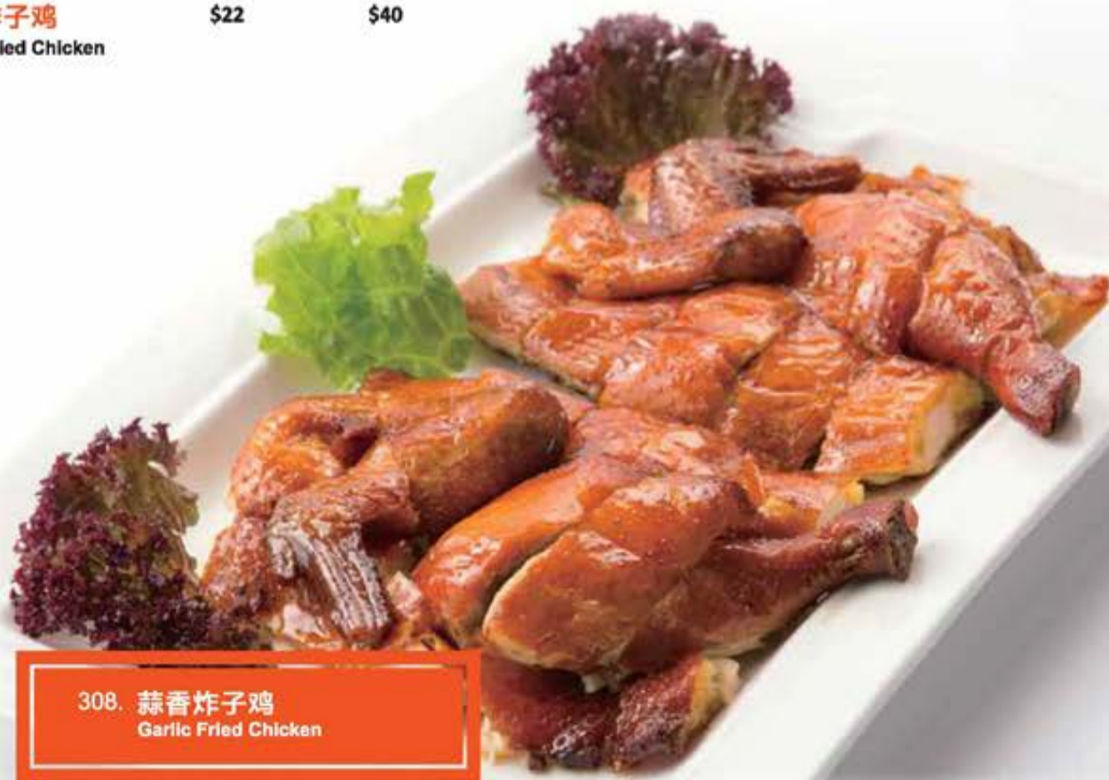
308. 蒜香炸子鸡 Garlic Fried Chicken