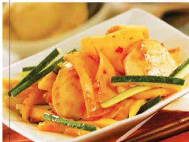
207. 生捞鲍片 Chilled Sliced Abalone with Chef's Special Sauce

Whet your appetite with a pot of liquid sunshine: this rich, velvety golden soup showcases a medley of premium seafood ingredients; the sweetness of fresh scallops and prawns against a backdrop of creamy, ambrosial pumpkin.