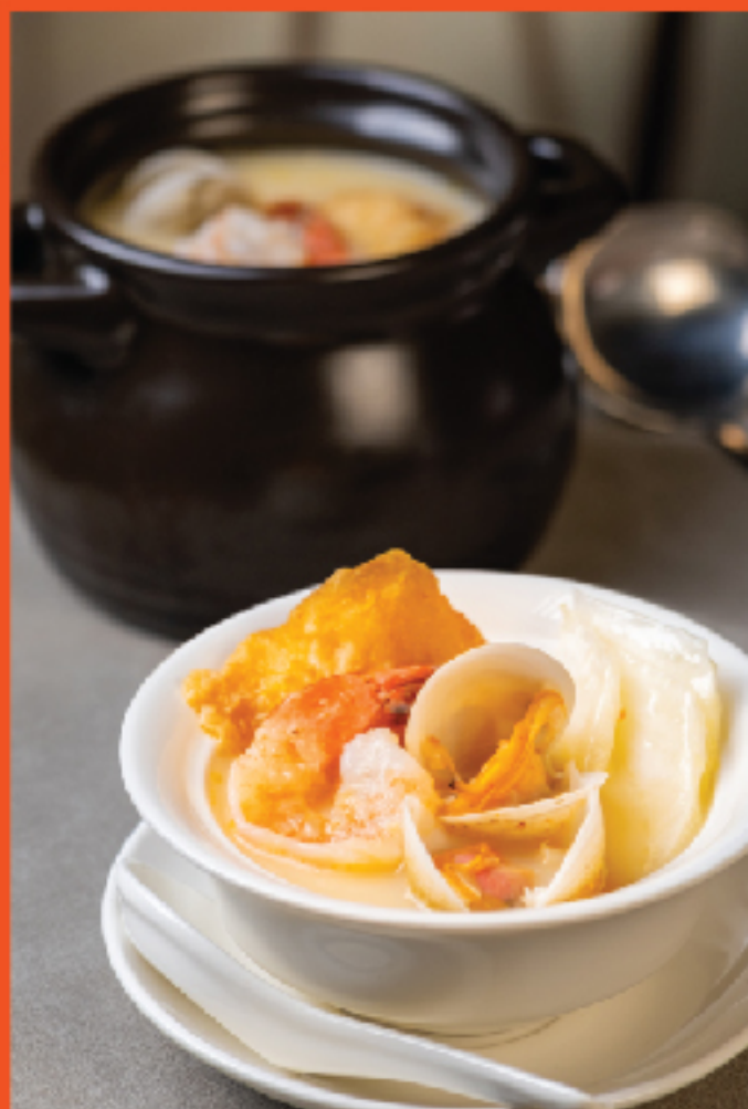
01 Trio Seafood Treasures in Superior Stock