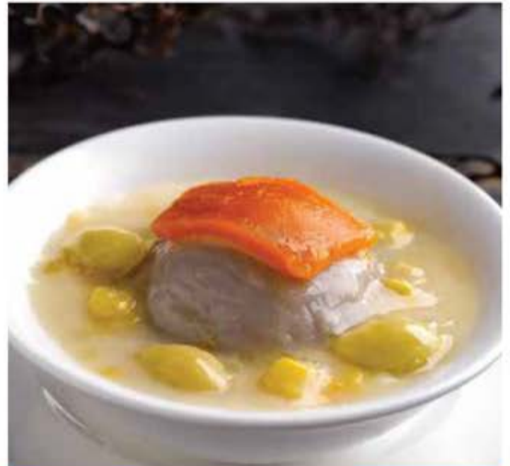
1001. 金瓜白果芋泥 Sweet Yam Paste with Gingko Nuts and Pumpkin