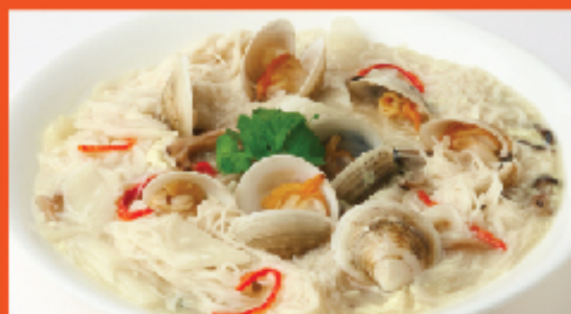
06 Live Korean Clam Braised 'Bee Hoon' in Aromatic Broth