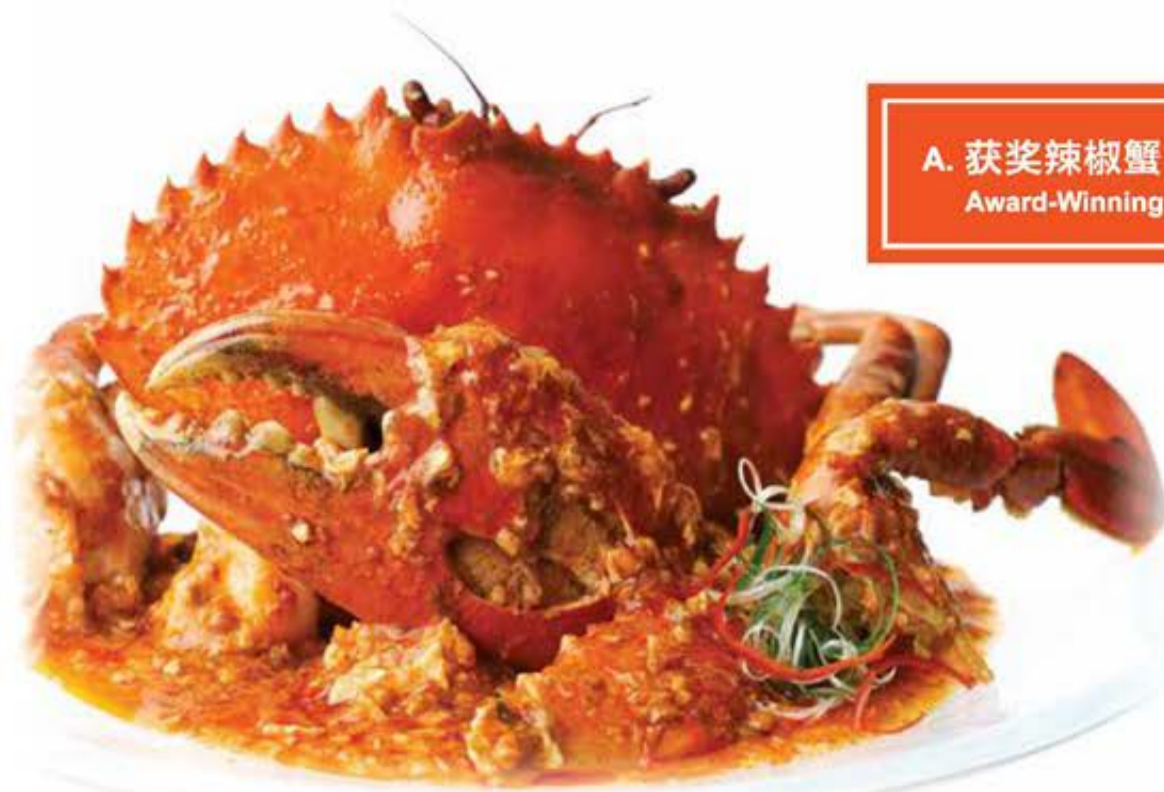
A. 获奖辣椒蟹 Award-Winning Chilli Crab