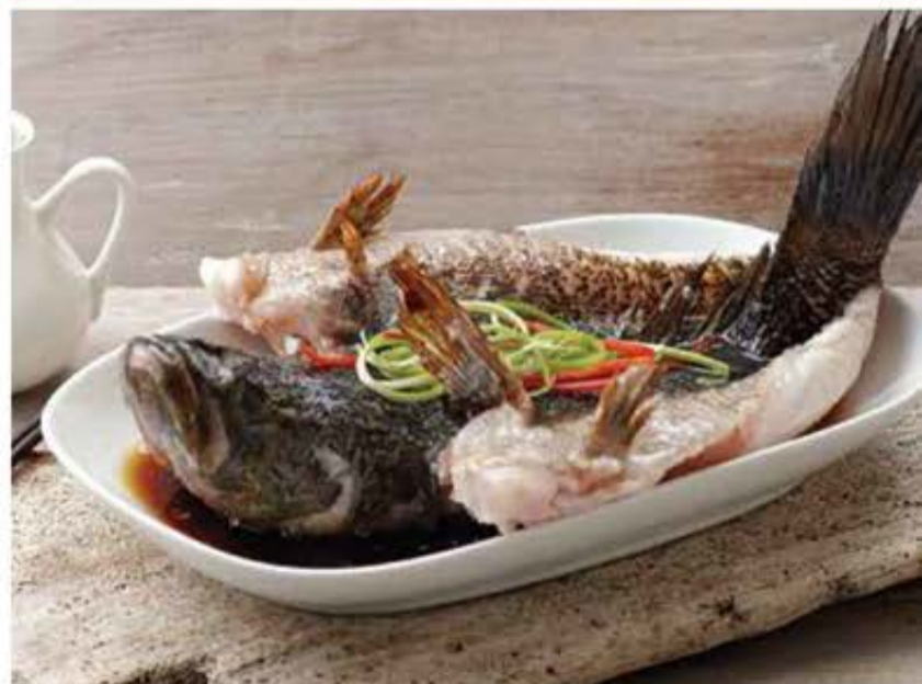
703A. 清蒸笋壳 'Soon Hock' (Marble Goby) Steamed with Soya Sauce