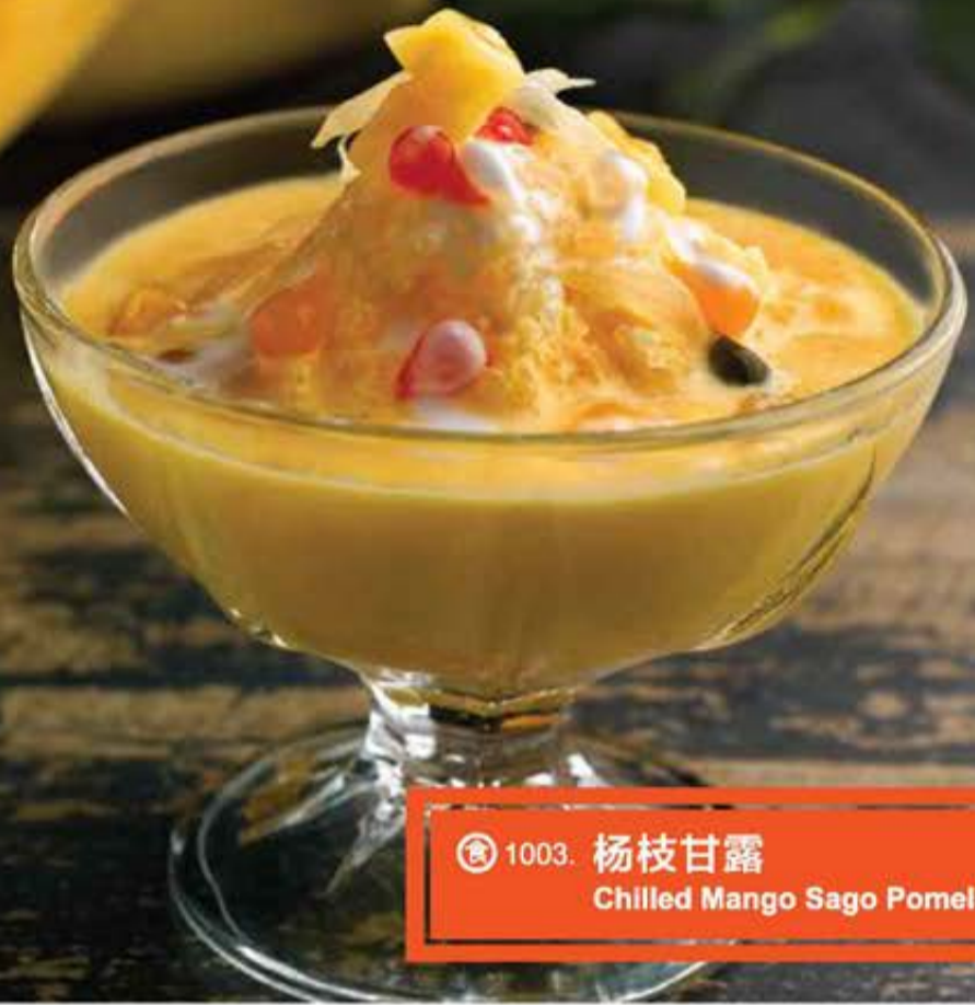
🍽️ 1003. 杨枝甘露 Chilled Mango Sago Pomelo