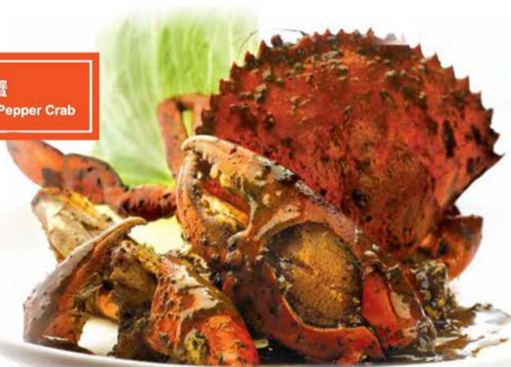
B. 招牌黑胡椒蟹 Signature Black Pepper Crab