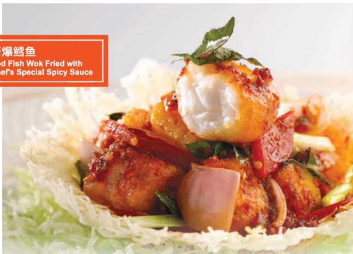
⑤ 501. 酱爆鳕鱼 Cod Fish Wok Fried with Chef's Special Spicy Sauce

色泽金黄的鳕鱼块辅以辛辣的东南亚特色酱料，外层香辣酥脆，内里细腻鲜美！ This delicious creation of golden cod fish ingots is glazed with a piquant sauce made from a blend of exotic Southeast Asian spices, crusty on the outside, whilst moist and tender within.