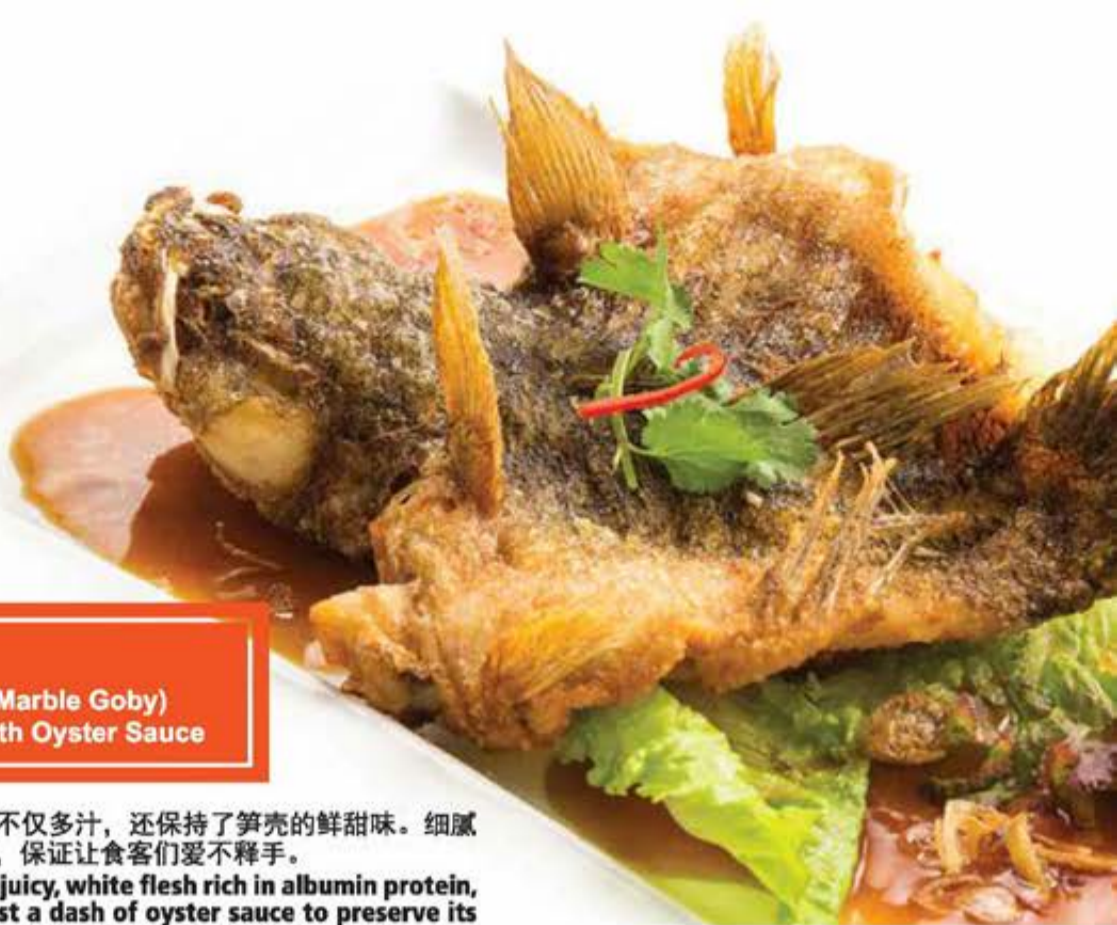
🍽️ 703D. 油浸笋壳 'Soon Hock' (Marble Goby) Deep Fried with Oyster Sauce

鲜嫩的笋壳在厨师的巧手下不仅多汁，还保持了笋壳的鲜甜味。细腻的肉质经过油炸后更有弹性，保证让食客们爱不释手。 Live Marble Goby boasts of juicy, white flesh rich in albumin protein, skillfully deep fried with just a dash of oyster sauce to preserve its sweet, delicate taste and the natural succulence of the meat.