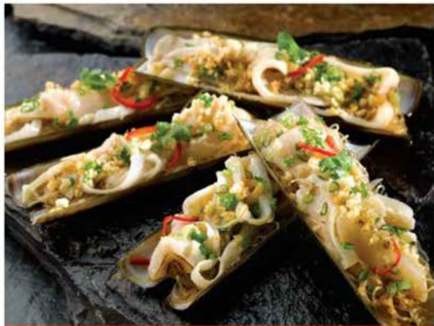
606. 蒜茸蒸竹蚌 Bamboo Clam Steamed with Minced Garlic