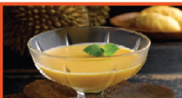
10 Mao Shan Wang Durian Pudding

05 酱爆鳕鱼 ..... $36 每份 / Per Portion Cod Fish Wok Fried with Chef's Special Sauce 色泽金黄的鳕鱼块辅以辛辣的东南亚特色酱料，外层香辣酥脆，内里细腻鲜美！ This delicious creation of golden cod fish ingots is glazed with a piquant sauce made from a blend of exotic Southeast Asian spices, crusty on the outside, whilst moist and tender within.