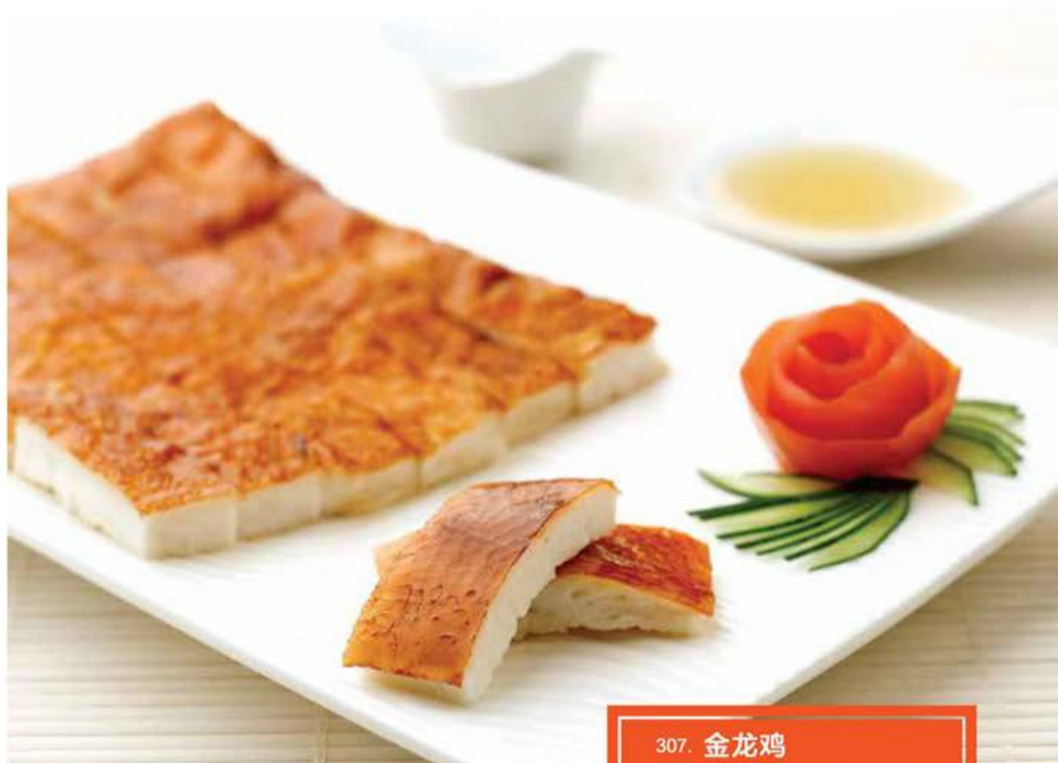
307. 金龙鸡 Golden Phoenix Chicken