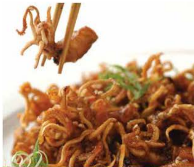
⑤ 507. 脆炸苏东仔 Crispy Fried Baby Squid