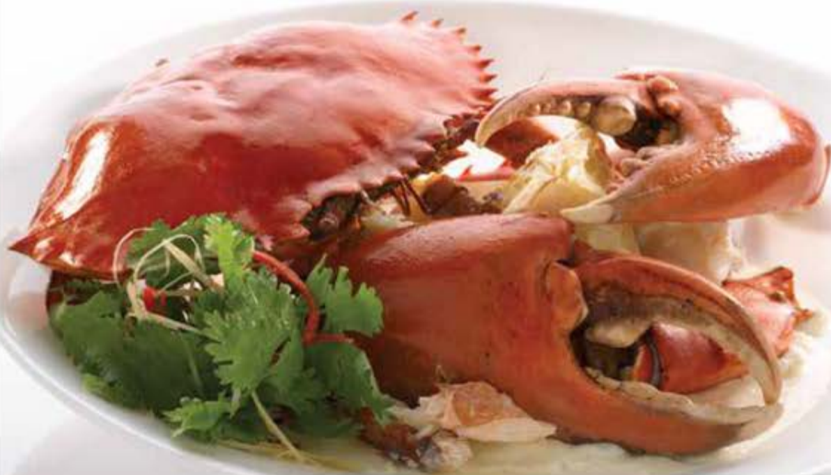
D. 花雕蛋白蒸蟹 Steamed Crab with Chinese Wine and Egg White

爱吃螃蟹的行家都会以螃蟹的鲜甜味为主，坚决选择吃蒸蟹。厨师们采用了豆浆，花雕酒和蛋白让蒸蟹显得更为突出。花雕酒不仅提升螃蟹的鲜味，也带出豆浆和蛋白的纤细口感，凸显出蟹肉的甜味。