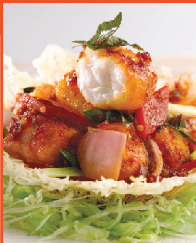
05 Cod Fish Wok Fried with Chef's Special Sauce