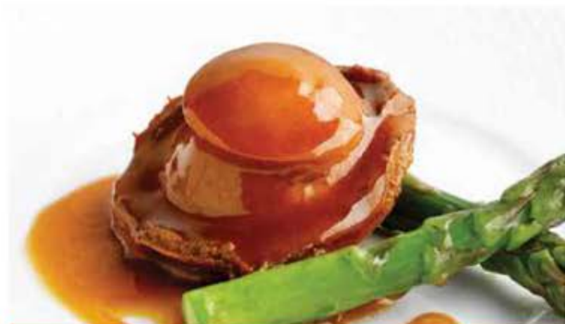
208. 蚝皇原只三头鲍鱼 Whole 3-Head Abalone Braised with Oyster Sauce