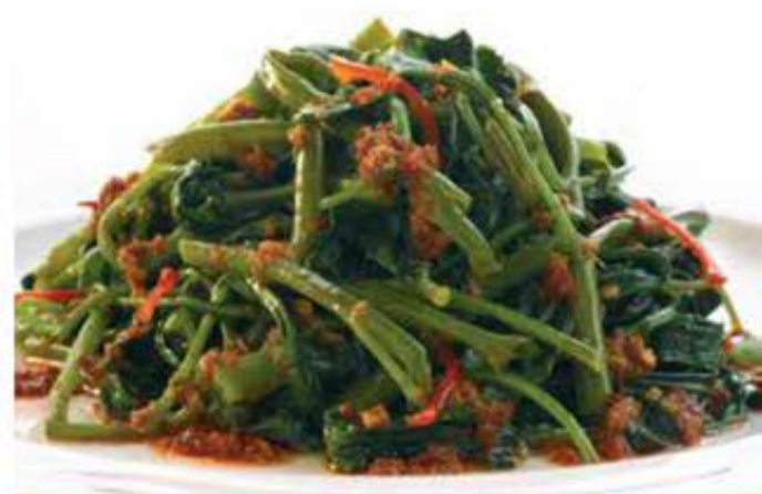
406. 马来风光 'Kang Kong' Stir Fried with Sambal