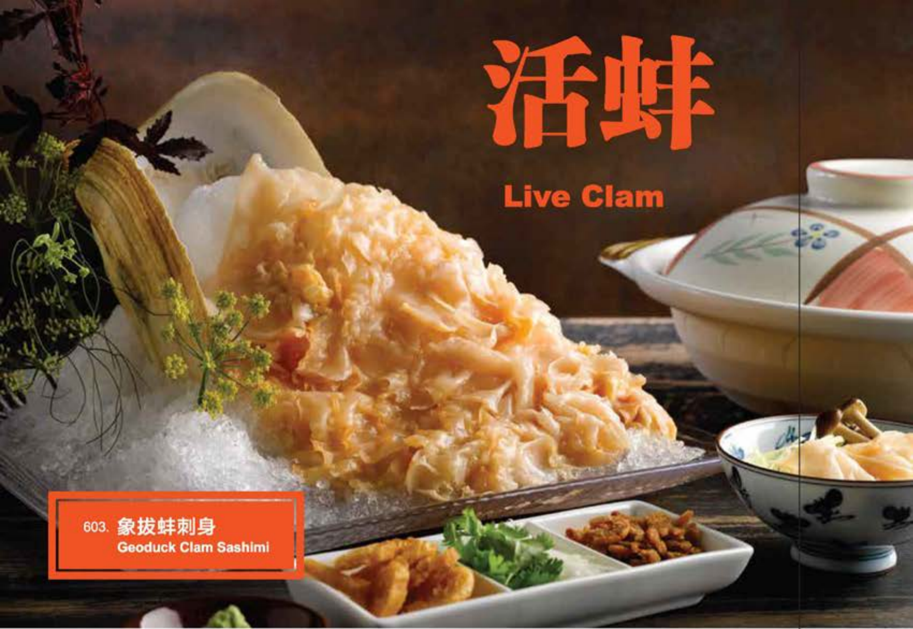
603. 象拔蚌刺身 Geoduck Clam Sashimi