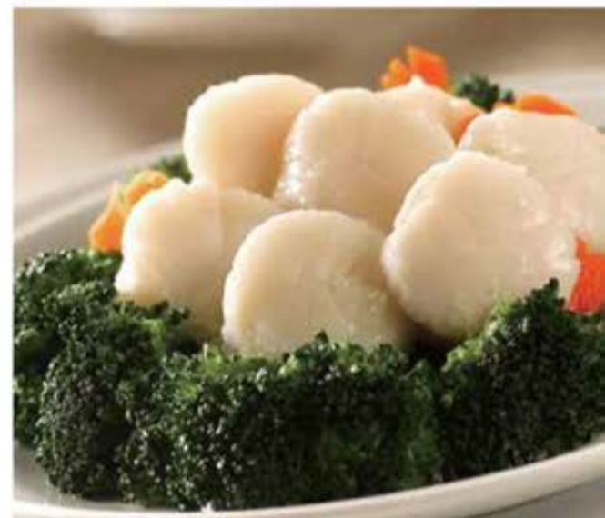
405. 带子炒西兰花 Broccoli Stir Fried with Scallops