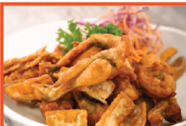
04 Crispy Fried Frog Leg with Sliced Ginger