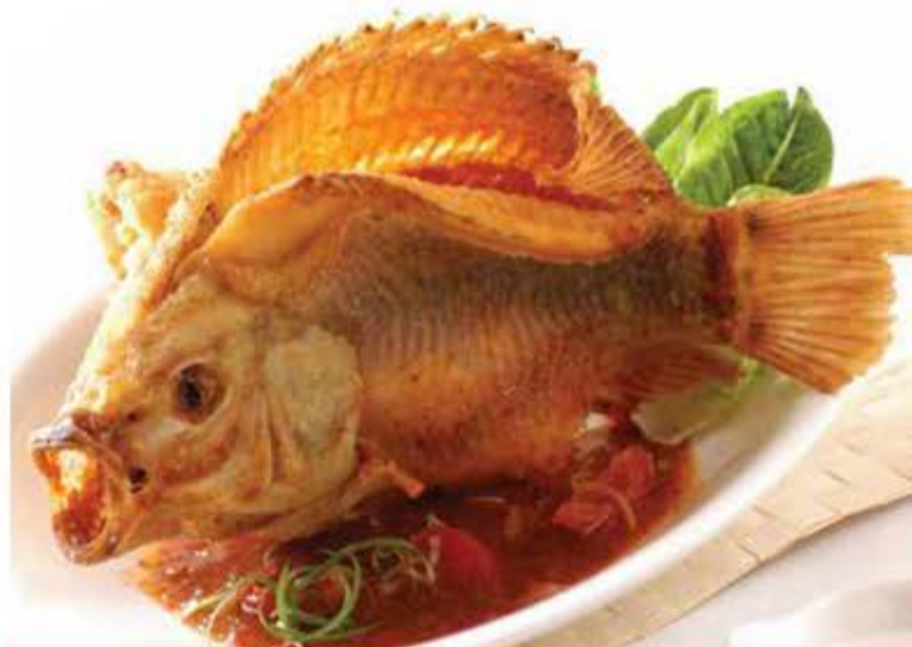
🍽️ 704E. 娘惹炸尼罗红 Red Tilapia Deep Fried with Nonya Sauce