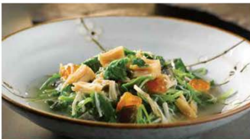
407. 干贝皮蛋苋菜苗 Chinese Spinach Braised with Conpoy and Century Egg