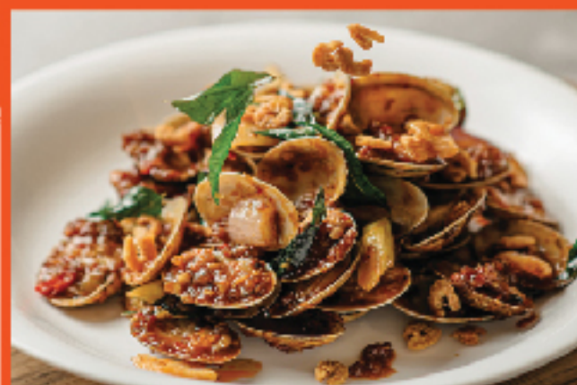
02 Live Korean Clam Stir Fried 'Kum Hiong' Style