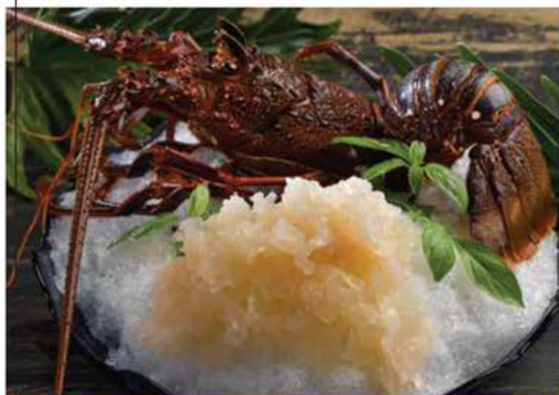
601A. 澳洲龙虾刺身 Australian Lobster Sashimi

A deceptively simple dish that truly exhibits the natural nectar of fresh, live seafood; Boston lobster is carefully braised in superior stock, the sweet broth itself brewed for at least 6 hours with a variety of rich ingredients including premium pork, Yunnan ham and pig skin.