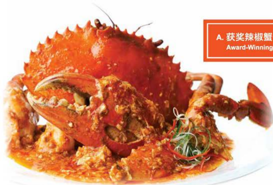
A. 获奖辣椒蟹 Award-Winning Chilli Crab