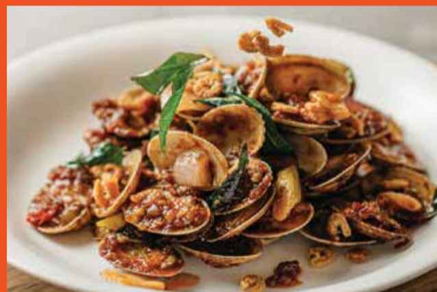
02 甘香啦啦 Live Korean Clam Stir Fried 'Kum Hiong' Style