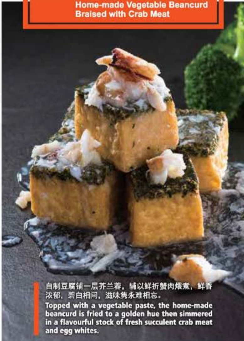
401. 蟹肉扒翡翠豆腐 Home-made Vegetable Beancurd Braised with Crab Meat

自制豆腐铺一层芥兰蓉，辅以鲜折蟹肉煨煮，鲜香浓郁，碧白相间，滋味隽永难相忘。 Topped with a vegetable paste, the home-made beancurd is fried to a golden hue then simmered in a flavourful stock of fresh succulent crab meat and egg whites.