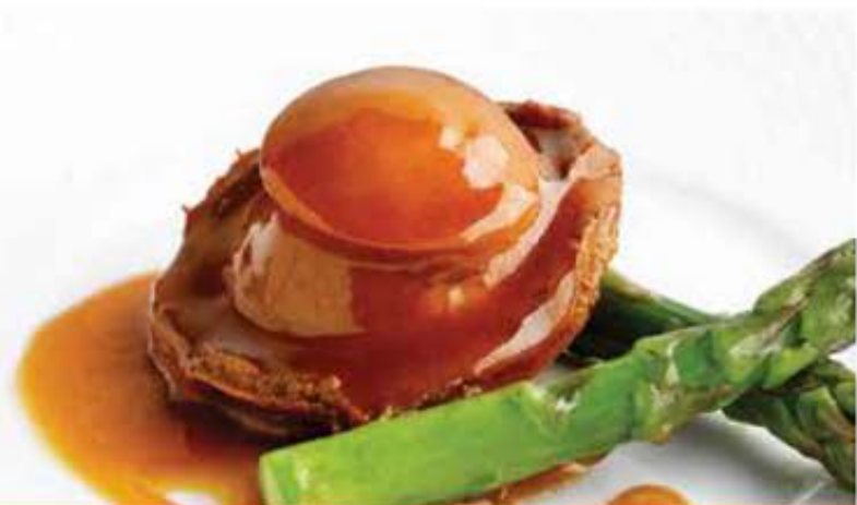
208. 蚝皇原只三头鲍鱼 Whole 3-Head Abalone Braised with Oyster Sauce