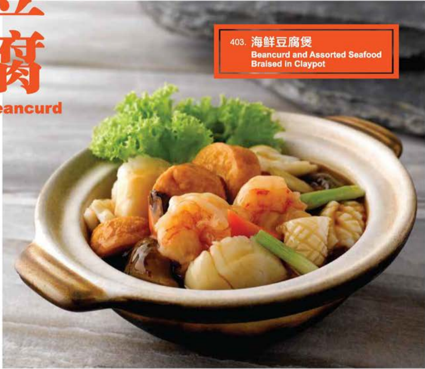
403. 海鲜豆腐煲 Beancurd and Assorted Seafood Braised in Claypot