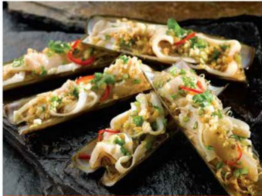
606. 蒜茸蒸竹蚌 Bamboo Clam Steamed with Minced Garlic