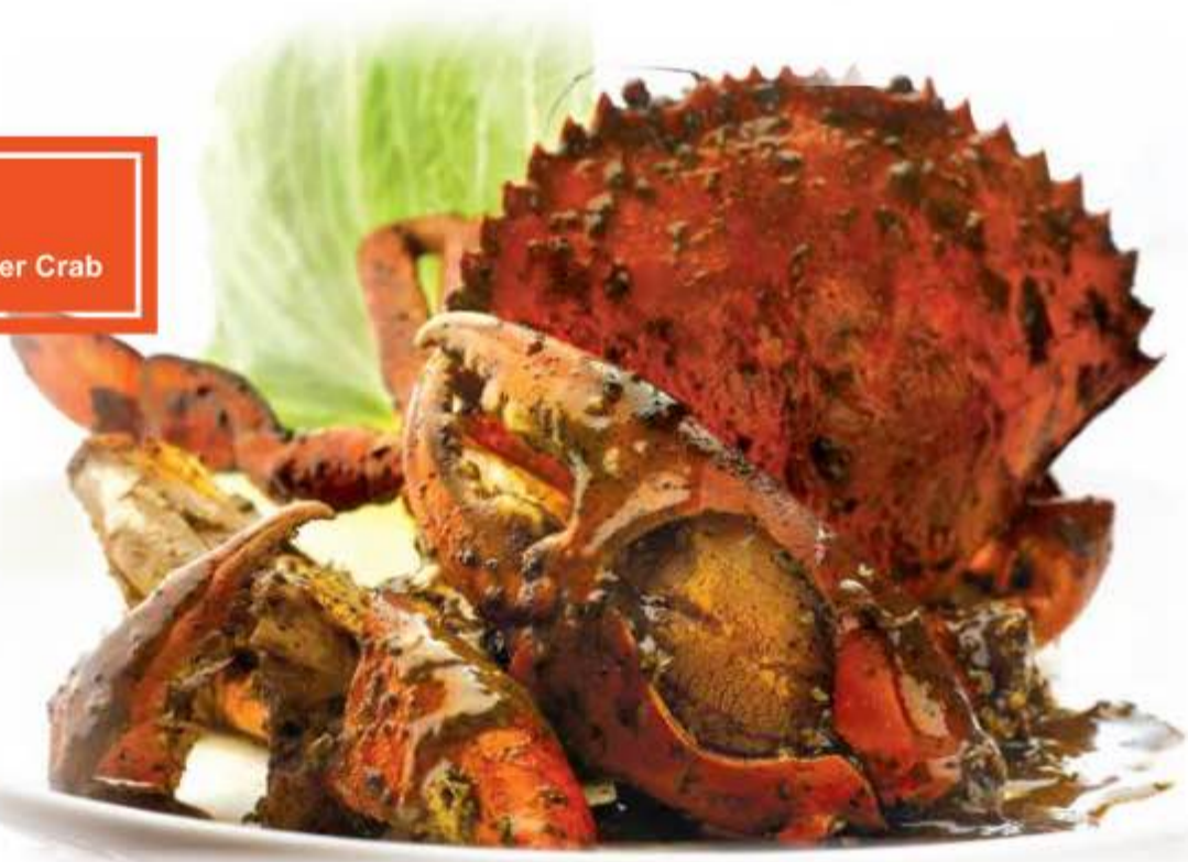
B. 招牌黑胡椒蟹 Signature Black Pepper Crab