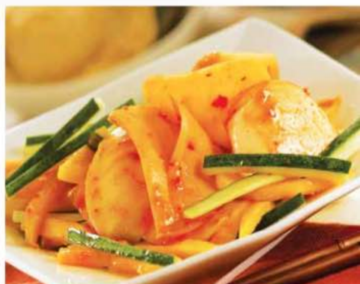
207. 生捞鲍片 Chilled Sliced Abalone with Chef's Special Sauce