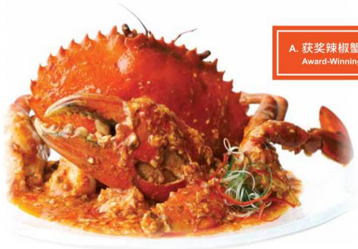
A. 获奖辣椒蟹 Award-Winning Chilli Crab