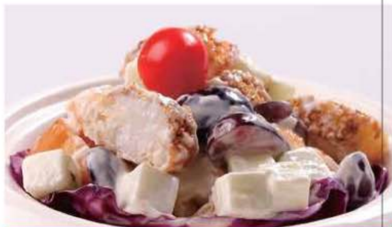
🍴 105. 鲜果生汁油条 Seafood Donut Tossed in Salad Cream