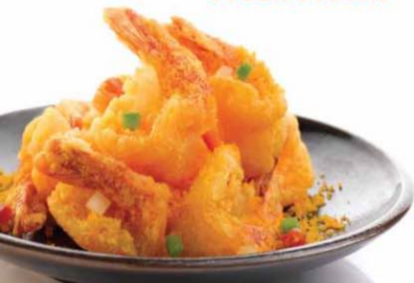
711. 咸蛋金沙虾球 Shelled Prawns Fried with Golden Salted Egg