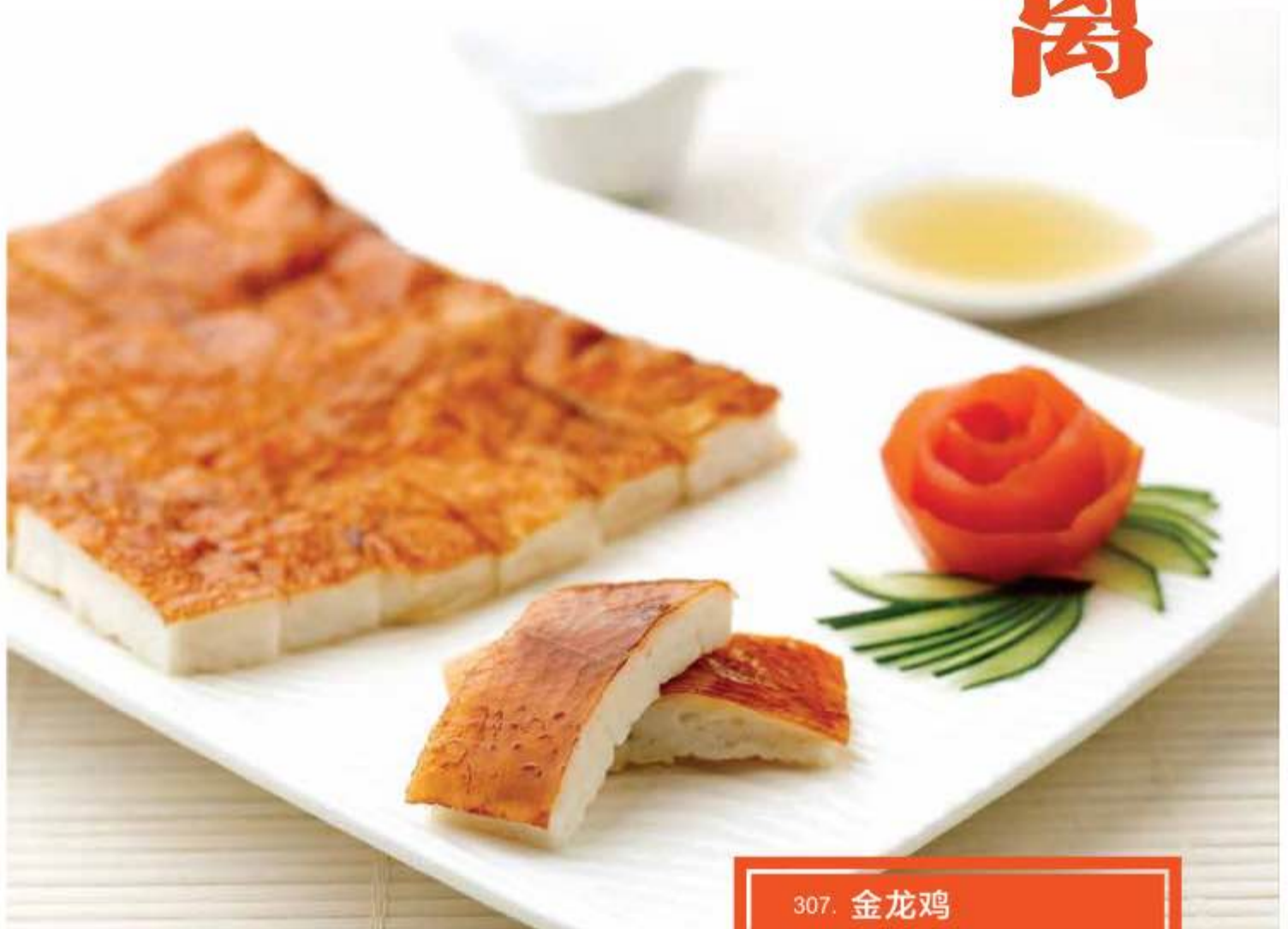
307. 金龙鸡 Golden Phoenix Chicken