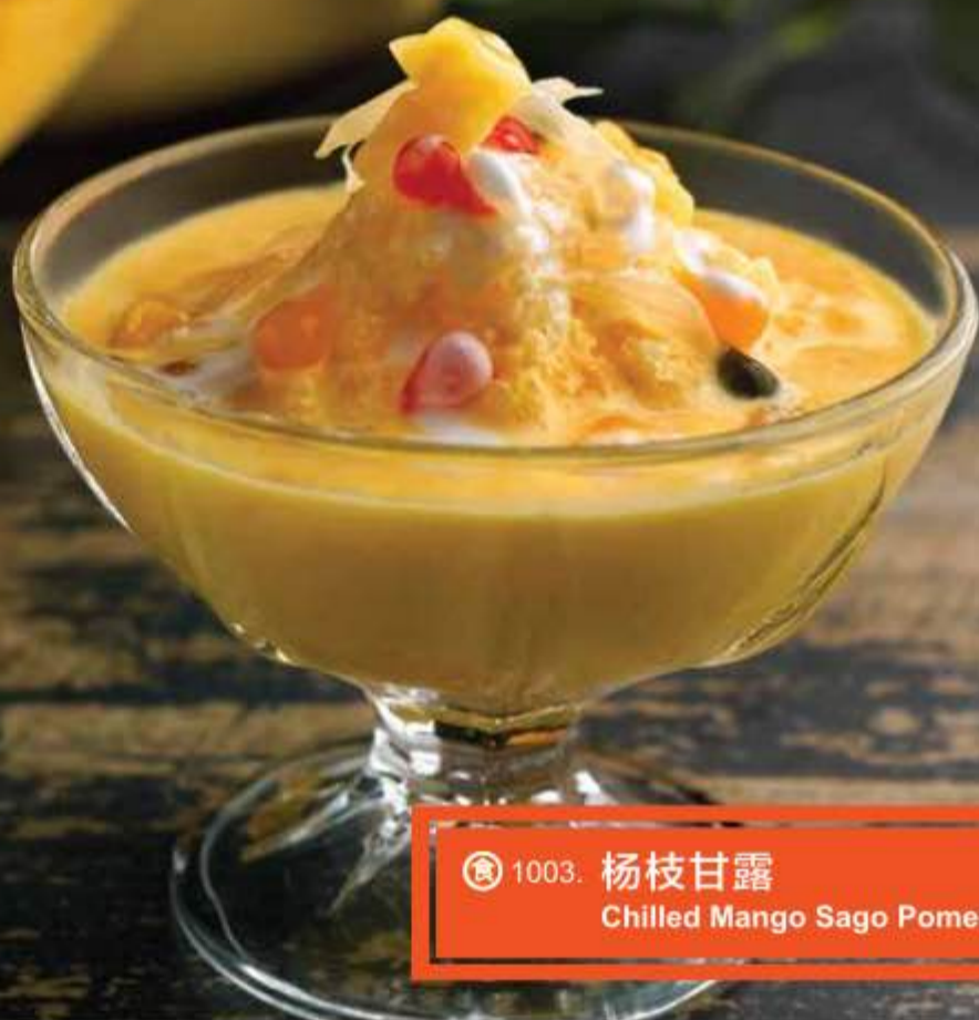
🍽️ 1003. 杨枝甘露 Chilled Mango Sago Pomelo