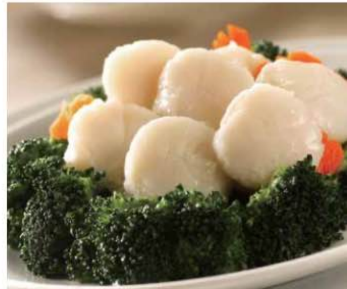
405. 带子炒西兰花 Broccoli Stir Fried with Scallops