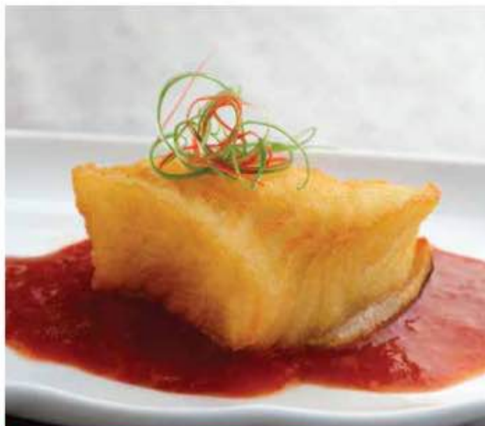
502. 娘惹脆香鳕鱼 Crispy Fried Cod Fish with Nonya Sauce