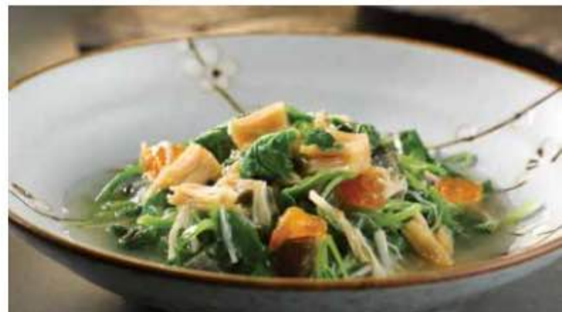
407. 干贝皮蛋苋菜苗 Chinese Spinach Braised with Conpoy and Century Egg