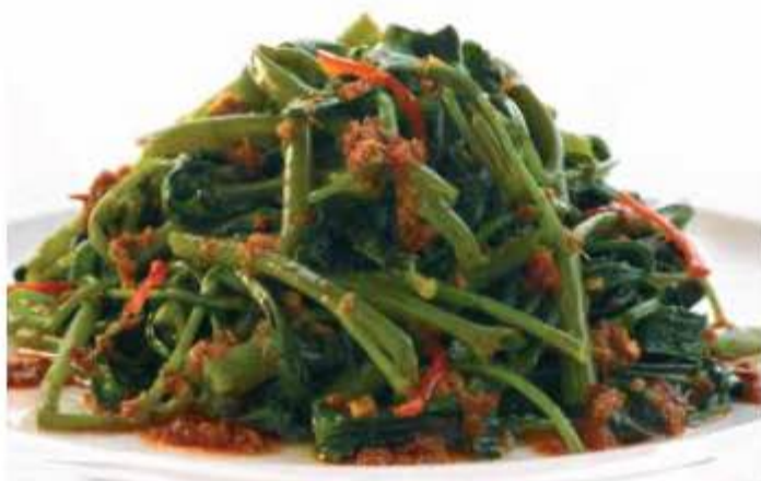
406. 马来风光 Kang Kong Stir Fried with Sambal