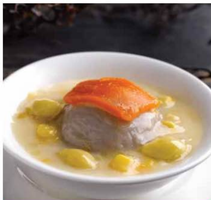
1001. 金瓜白果芋泥 Sweet Yam Paste with Ginkgo Nuts and Pumpkin