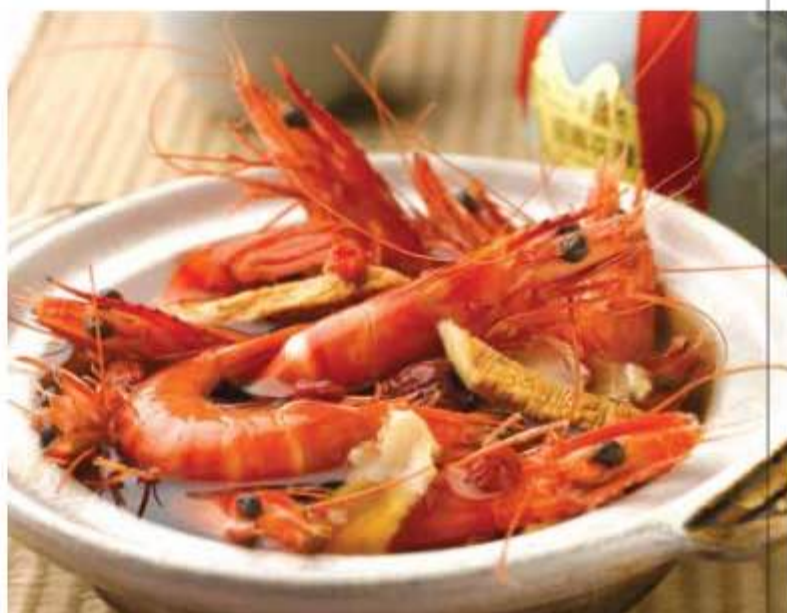
706. 药材醉活虾 Herbal Drunken Live Prawns