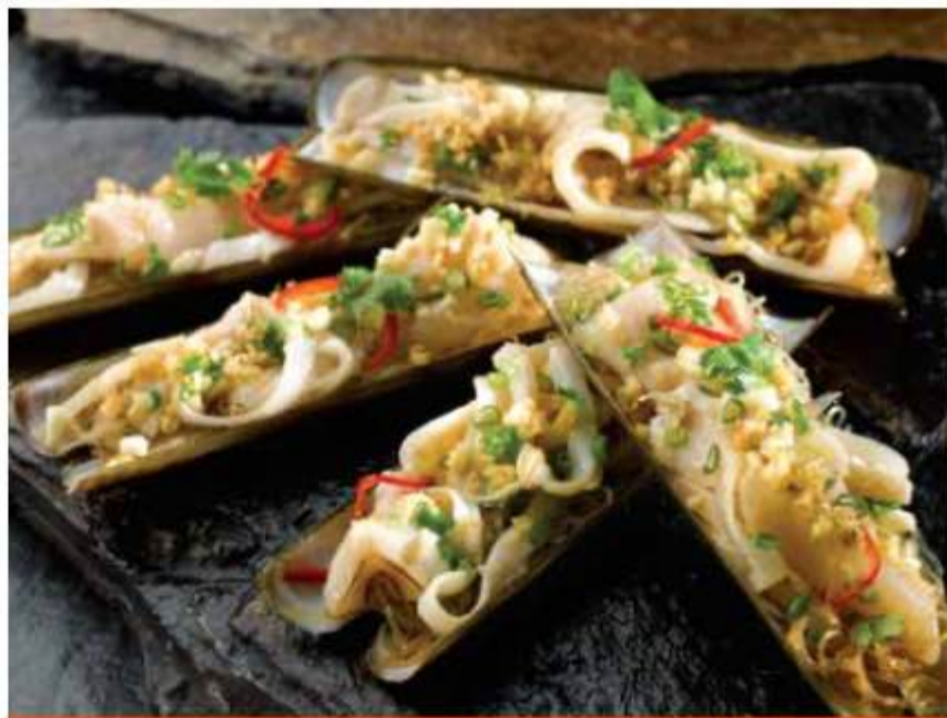
606. 蒜蓉蒸竹蚌 Bamboo Clam Steamed with Minced Garlic