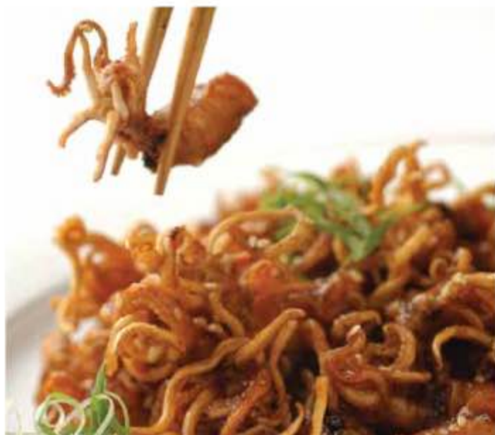
506. 脆炸苏东仔 Crispy Fried Baby Squid