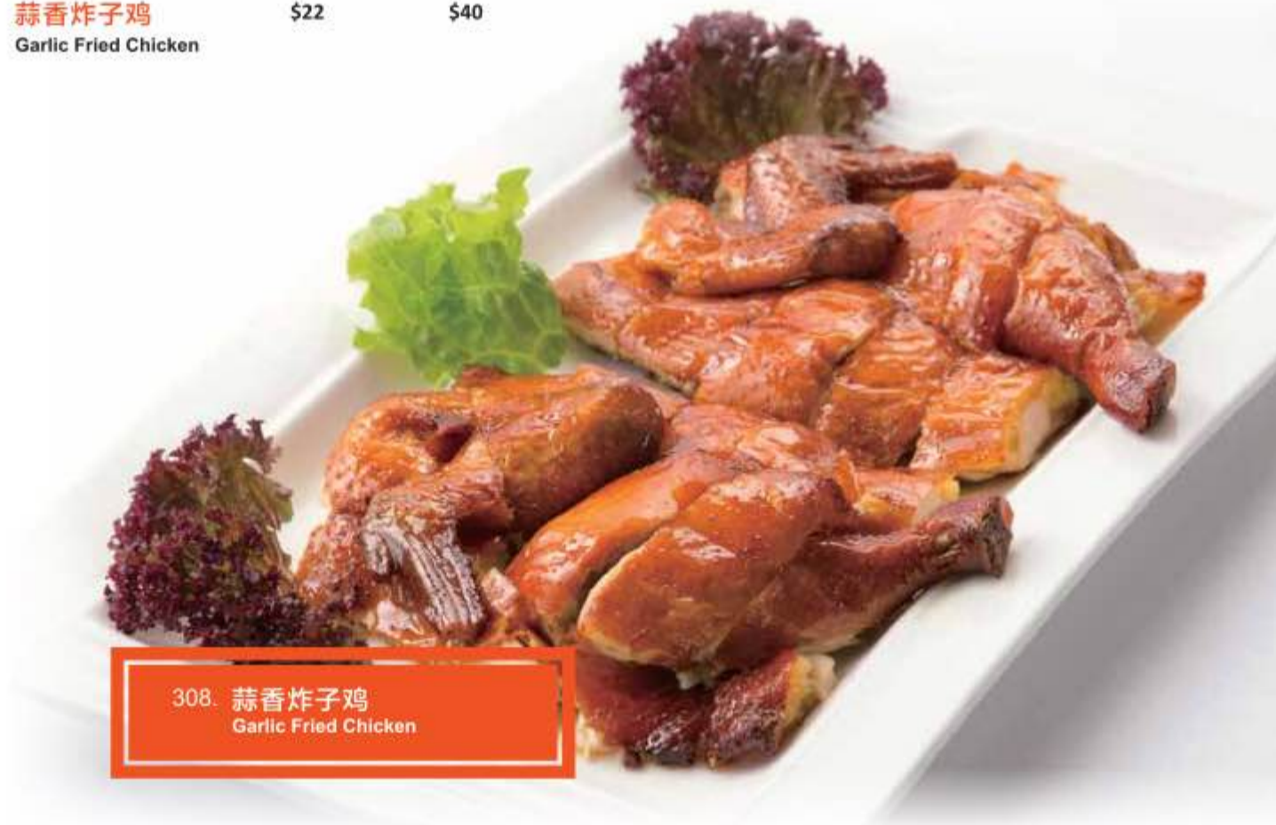
308. 蒜香炸子鸡 Garlic Fried Chicken