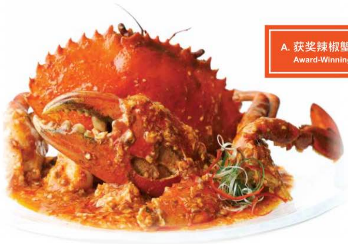
A. 获奖辣椒蟹 Award-Winning Chilli Crab