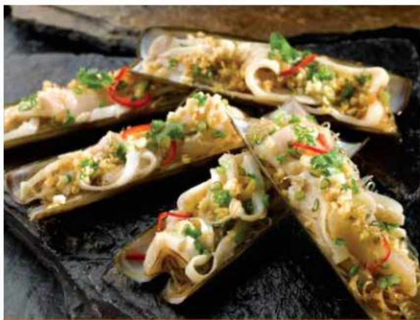
606. 蒜蓉蒸竹蚌 Bamboo Clam Steamed with Minced Garlic