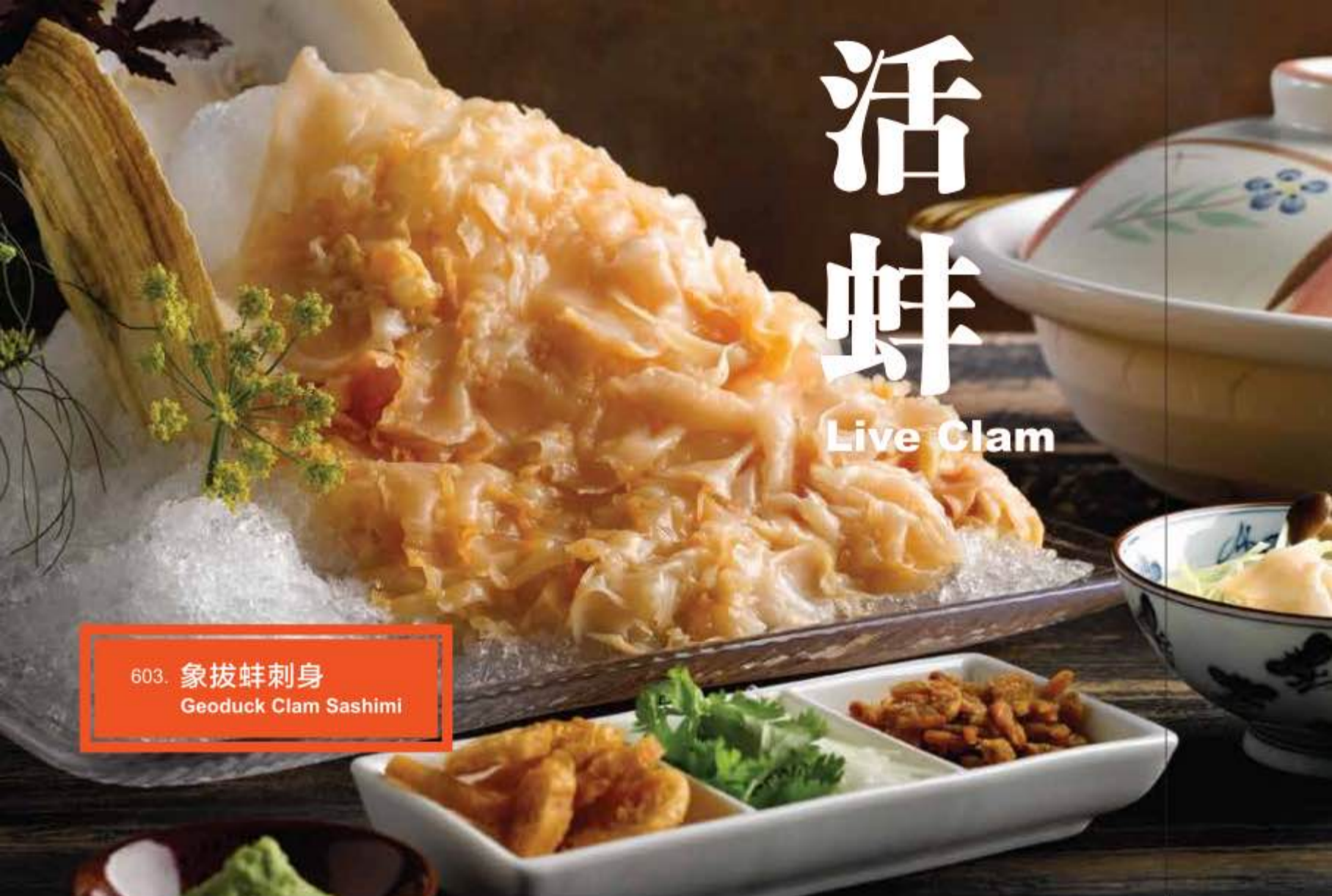
603. 象拔蚌刺身 Geoduck Clam Sashimi