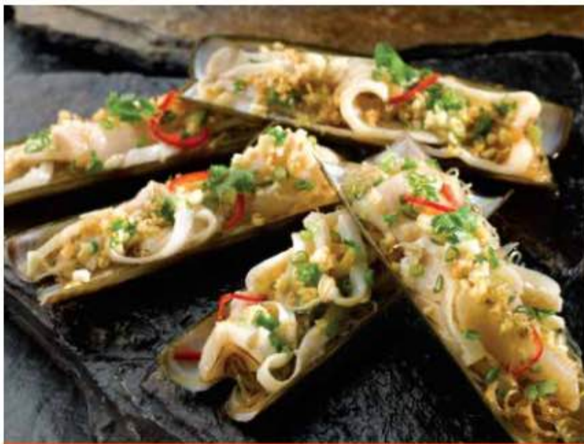
606. 蒜蓉蒸竹蚌 Bamboo Clam Steamed with Minced Garlic