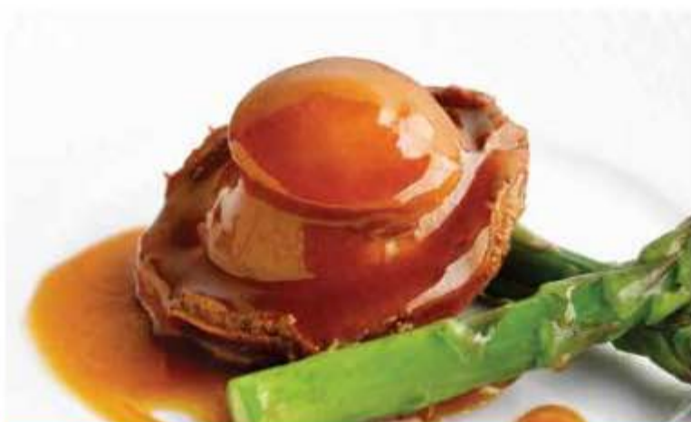
209. 红煨原只四头鲜鲍 Whole 4-Head Abalone Braised with Abalone Sauce and Seasonal Vegetable