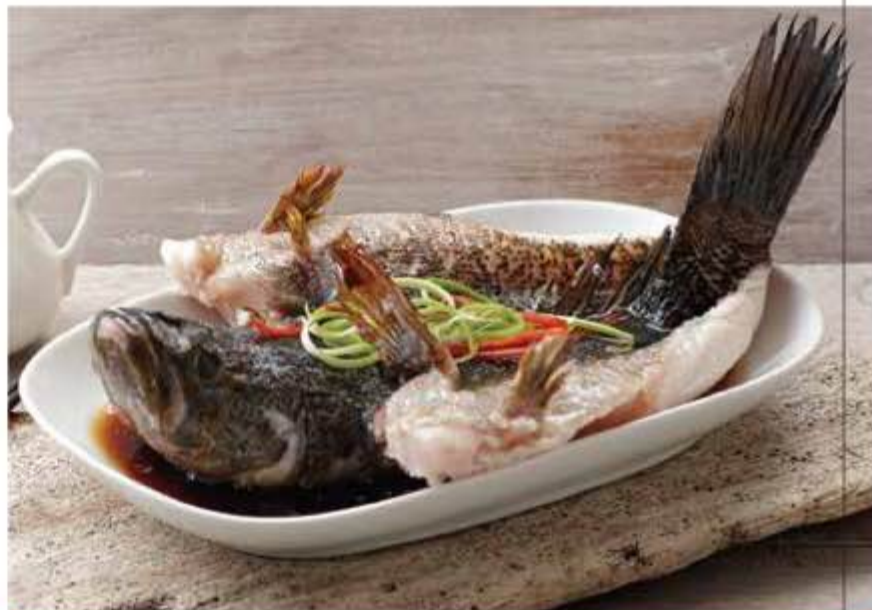
703A. 清蒸笋壳 Soon Hock (Marble Goby) Steamed with Soya Sauce