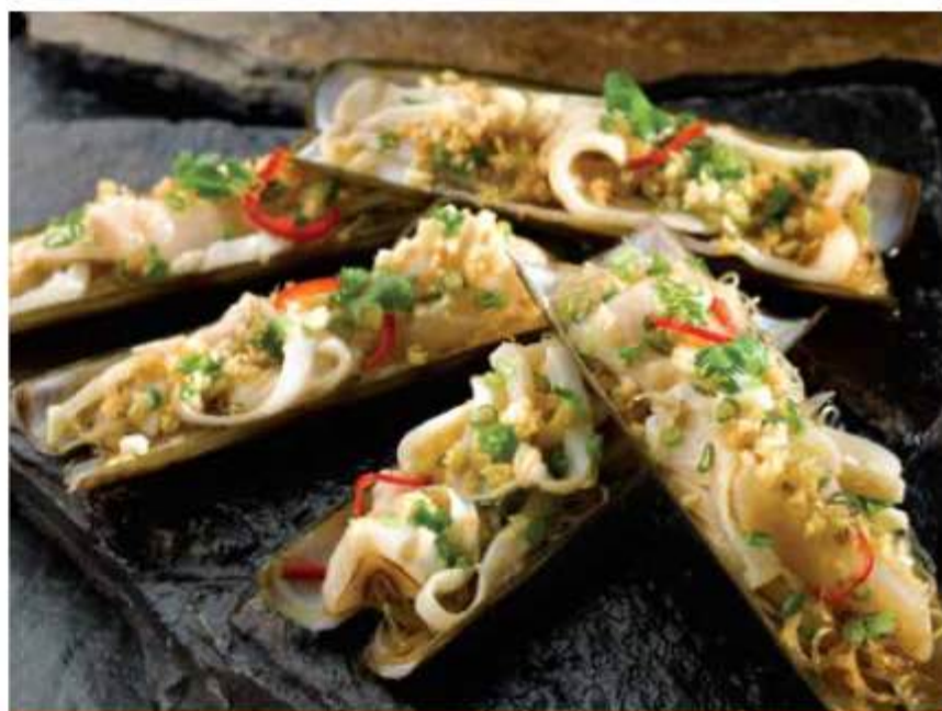
606. 蒜茸蒸竹蚌 Bamboo Clam Steamed with Minced Garlic