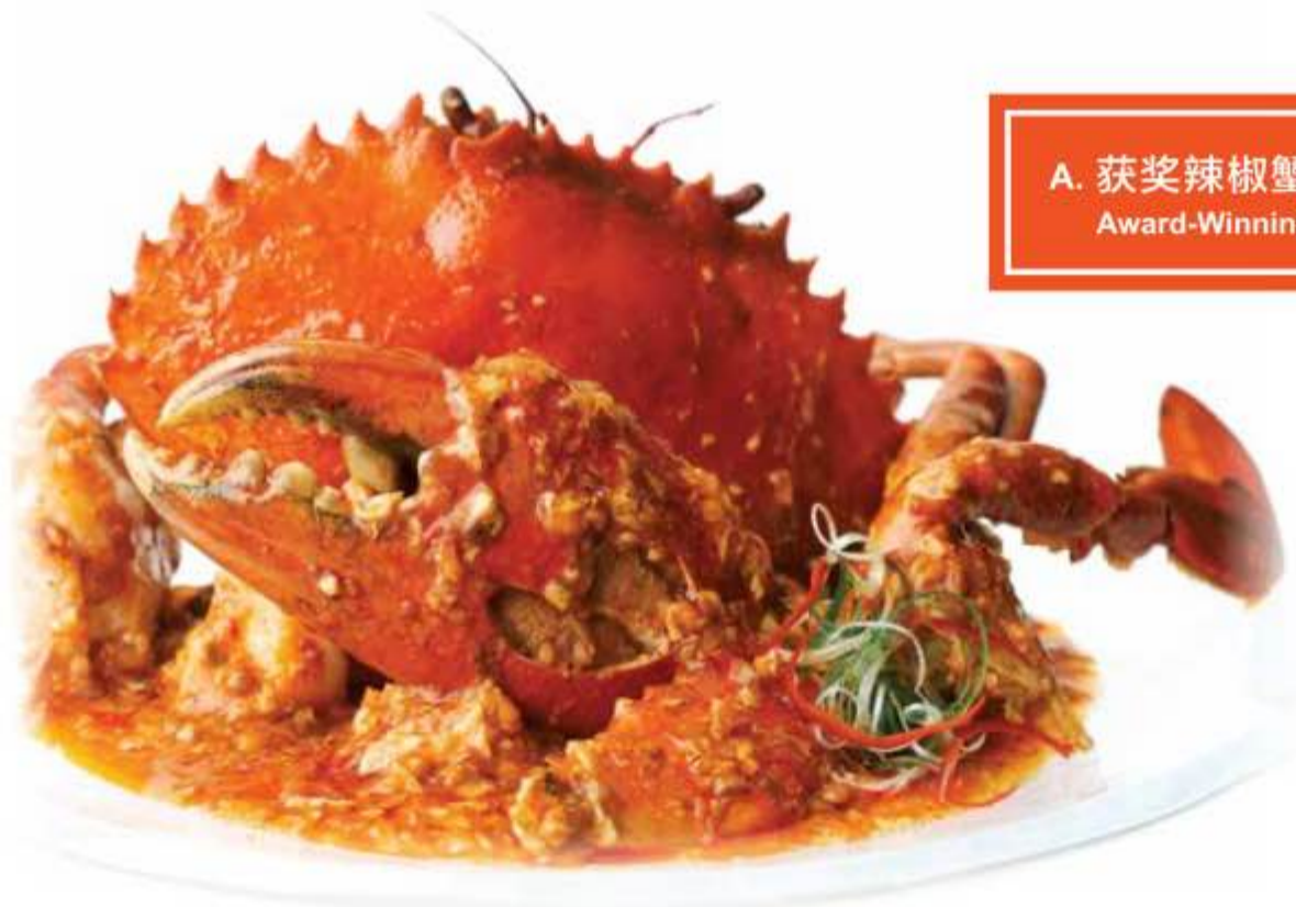
A. 获奖辣椒蟹 Award-Winning Chilli Crab