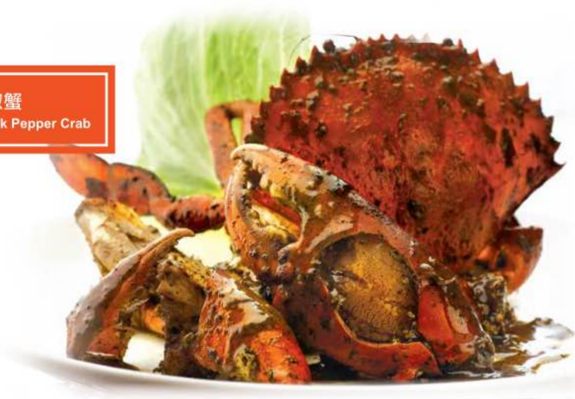
B. 招牌黑胡椒蟹 Signature Black Pepper Crab