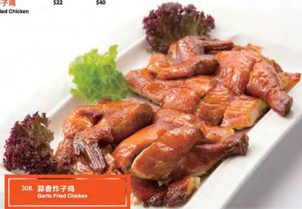
308. 蒜香炸子鸡 Garlic Fried Chicken