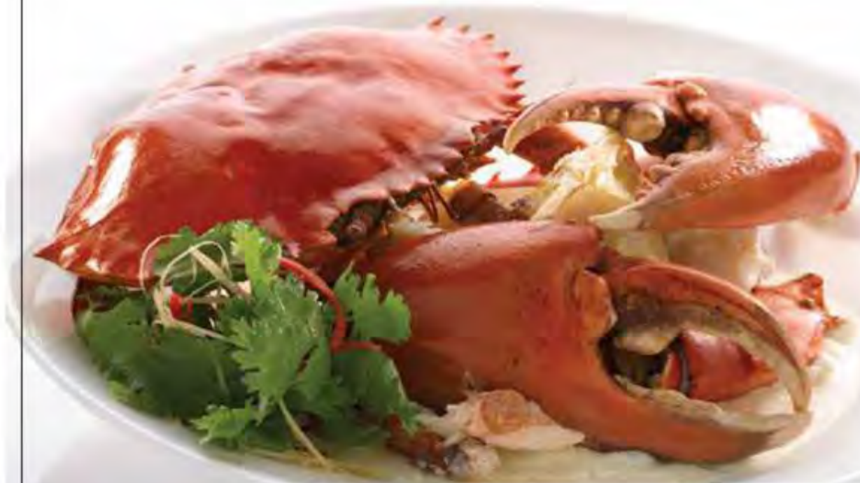
D. 花雕蛋白蒸蟹 Steamed Crab with Chinese Wine and Egg White

爱吃螃蟹的行家都会以螃蟹的鲜甜味为主，坚决选择吃蒸蟹。厨师们采用了豆浆，花雕酒和蛋白让蒸蟹显得更为突出。花雕酒不仅提升螃蟹的鲜味，也带出豆浆和蛋白的纤细口感，凸显出蟹肉的甜味。