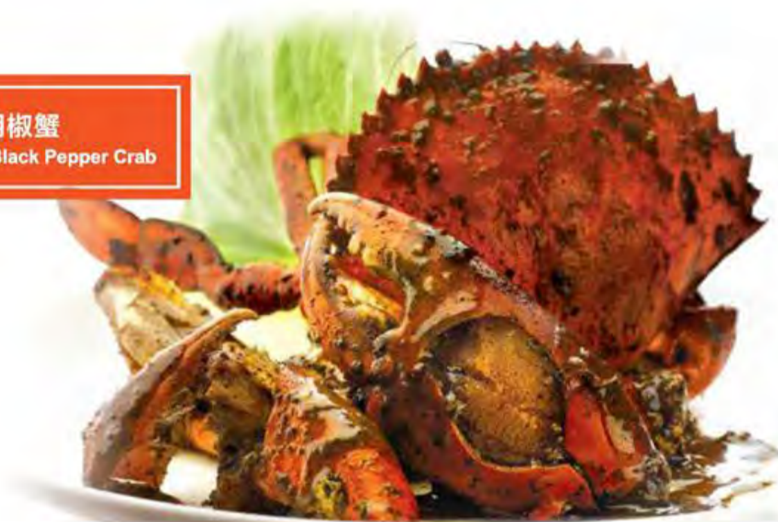
B. 招牌黑胡椒蟹 Signature Black Pepper Crab