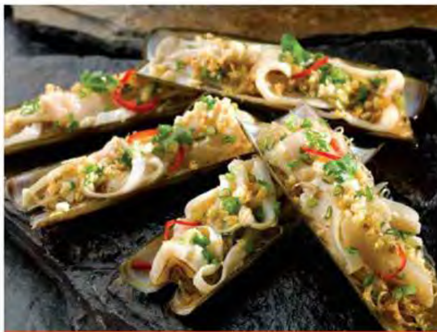
606. 蒜茸蒸竹蚌 Bamboo Clam Steamed with Minced Garlic