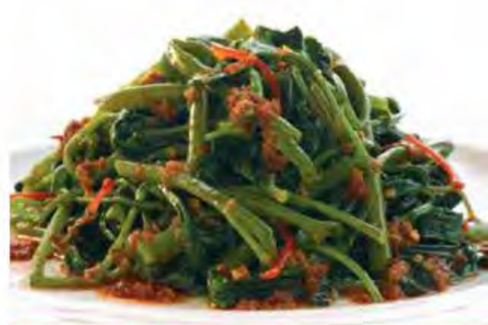
406. 马来风光 'Kang Kong' Stir Fried with Sambal