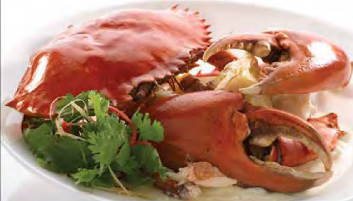
D. 花雕蛋白蒸蟹 Steamed Crab with Chinese Wine and Egg White

爱吃螃蟹的行家都会以螃蟹的鲜甜味为主，坚决选择吃蒸蟹。厨师们采用了豆浆，花雕酒和蛋白让蒸蟹显得更为突出。花雕酒不仅提升螃蟹的鲜味，也带出豆浆和蛋白的纤细口感，凸显出蟹肉的甜味。