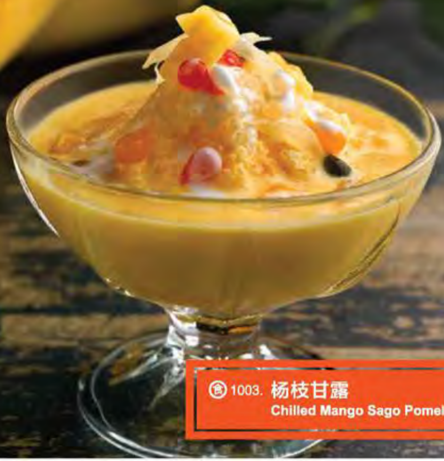
🍽️ 1003. 杨枝甘露 Chilled Mango Sago Pomelo