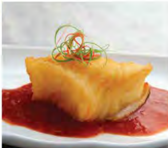
502. 娘惹脆香鳕鱼 Crispy Fried Cod Fish with Nonya Sauce