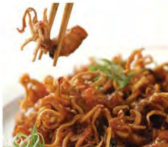
507. 脆炸苏东仔 Crispy Fried Baby Squid