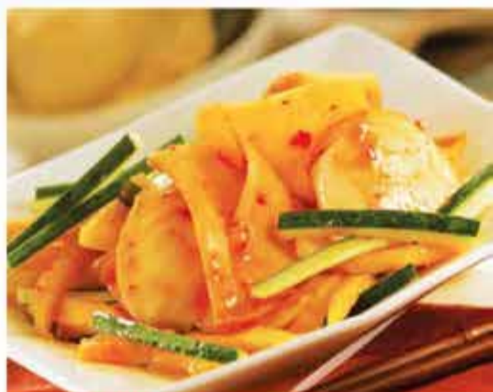
207. 生捞鲍片 Chilled Sliced Abalone with Chef's Special Sauce