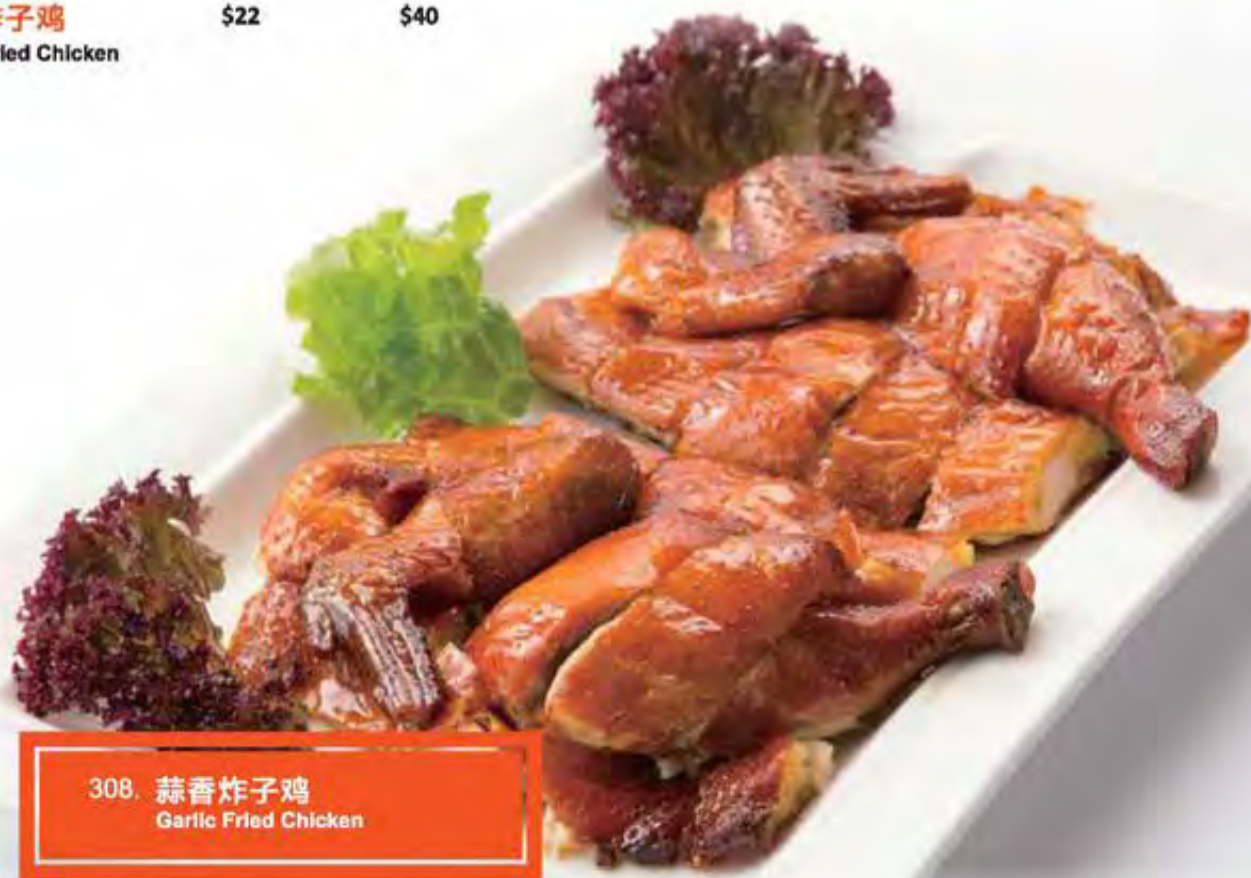
308. 蒜香炸子鸡 Garlic Fried Chicken