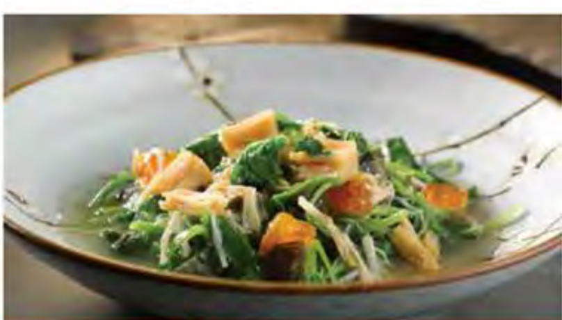
407. 干贝皮蛋苋菜苗 Chinese Spinach Braised with Conpoy and Century Egg