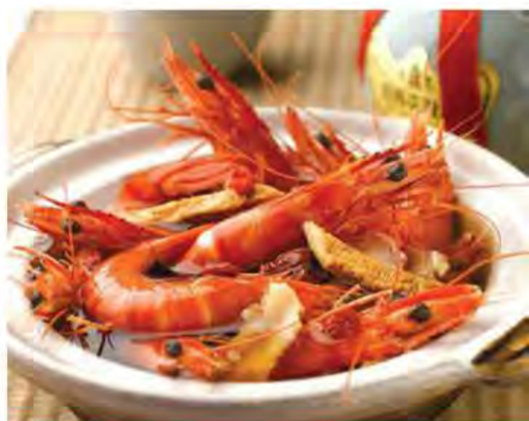
701. 药材醉活虾 Herbal Drunken Live Prawns