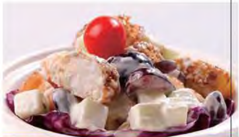
🍴 105. 鲜果生汁油条 Seafood Donut Tossed in Salad Cream