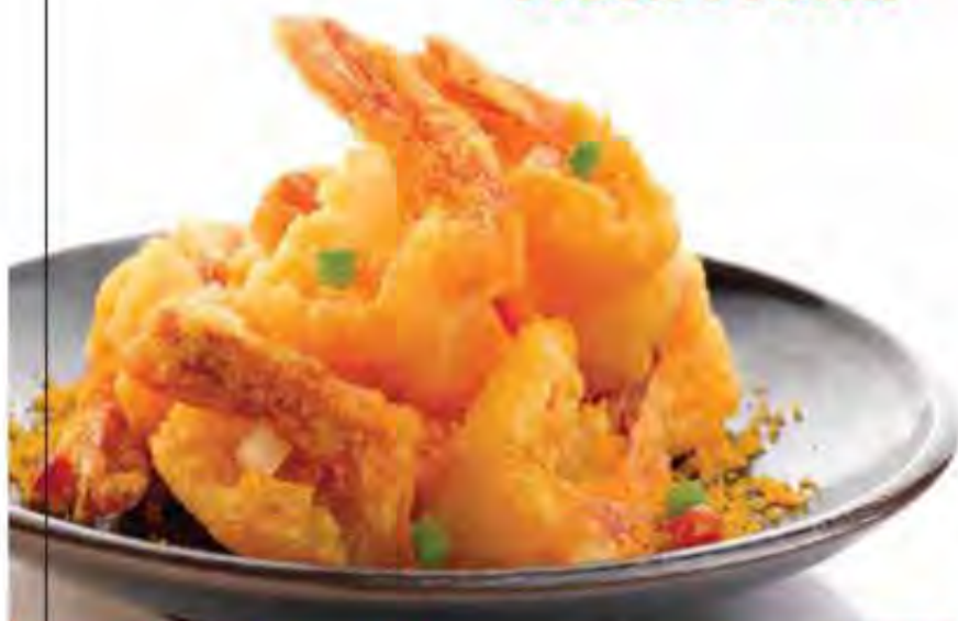
🍽️ 706. 咸蛋金沙虾球 Shelled Prawns Fried with Golden Salted Egg