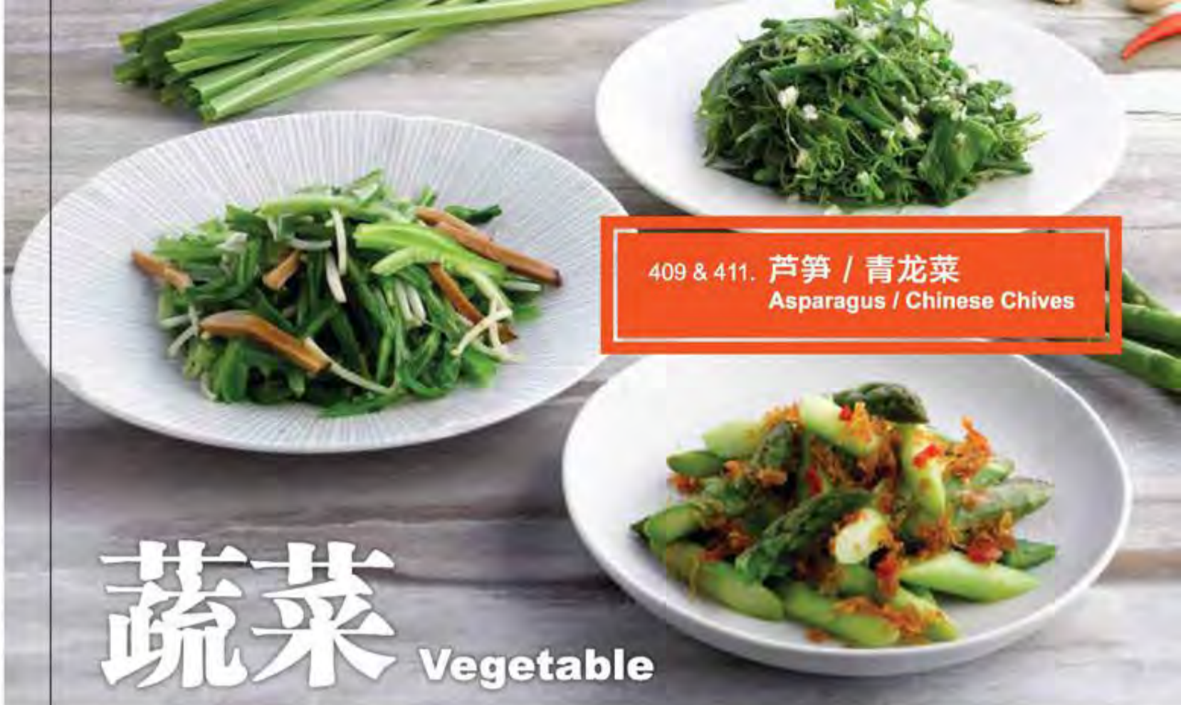
409 & 411. 芦笋 / 青龙菜 Asparagus / Chinese Chives