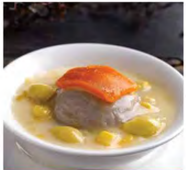
1001. 金瓜白果芋泥 Sweet Yam Paste with Ginkgo Nuts and Pumpkin