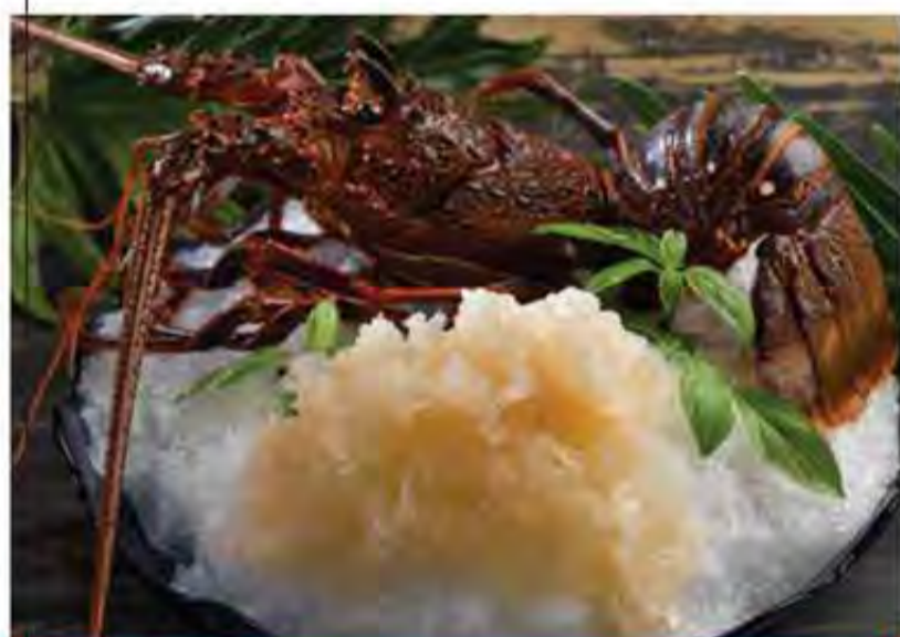
601A. 澳洲龙虾刺身 Australian Lobster Sashimi

A deceptively simple dish that truly exhibits the natural nectar of fresh, live seafood; Boston lobster is carefully braised in superior stock, the sweet broth itself brewed for at least 6 hours with a variety of rich ingredients including premium pork, Yunnan ham and pig skin.