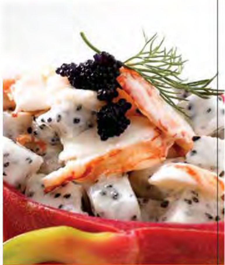
🍴 102. 鱼子酱龙珠果龙虾沙律 Dragonfruit Lobster Salad with Lumpfish Caviar