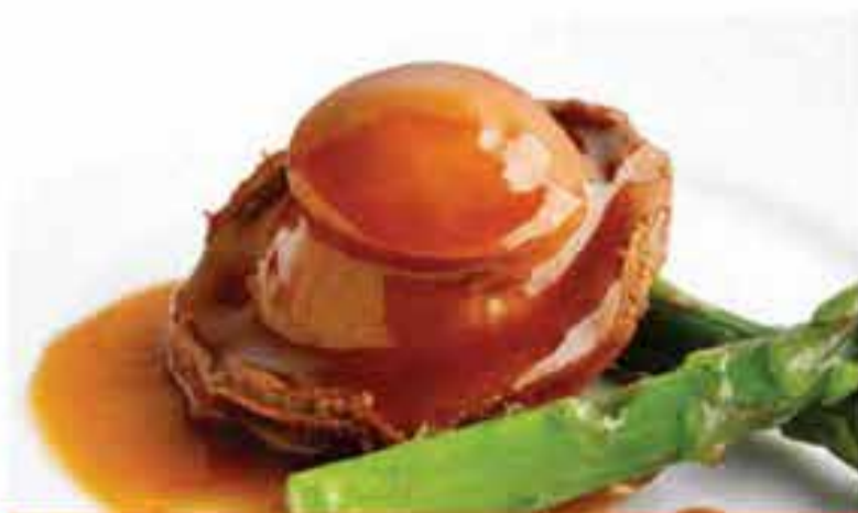
208. 蚝皇原只三头鲍鱼 Whole 3-Head Abalone Braised with Oyster Sauce