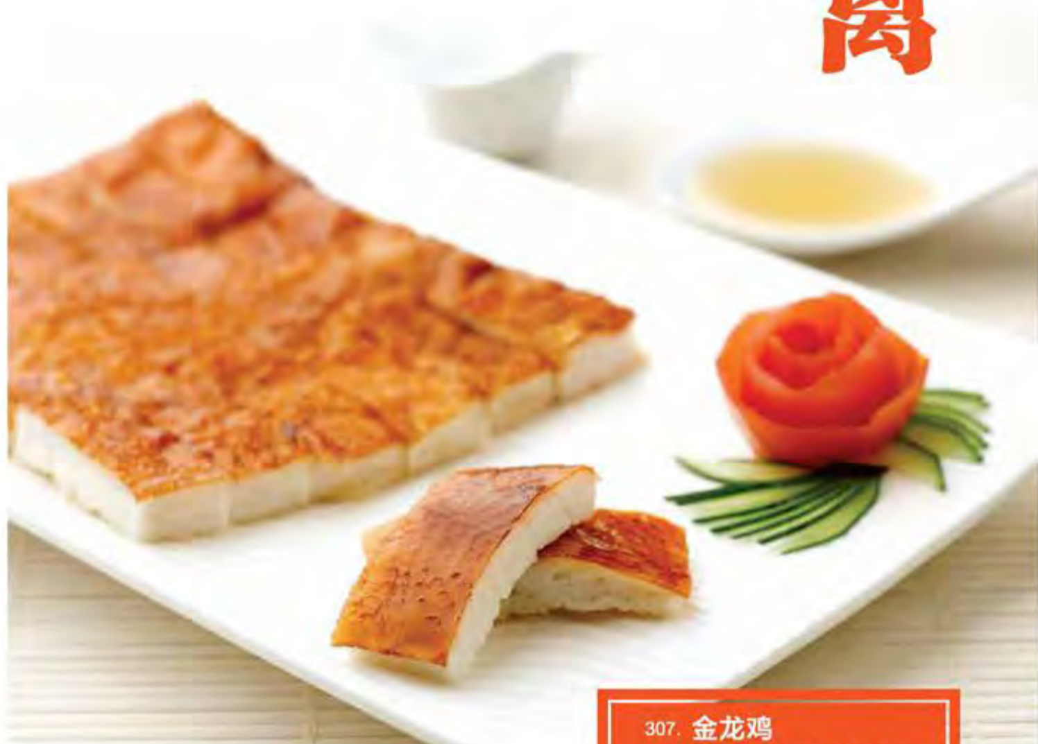
307. 金龙鸡 Golden Phoenix Chicken