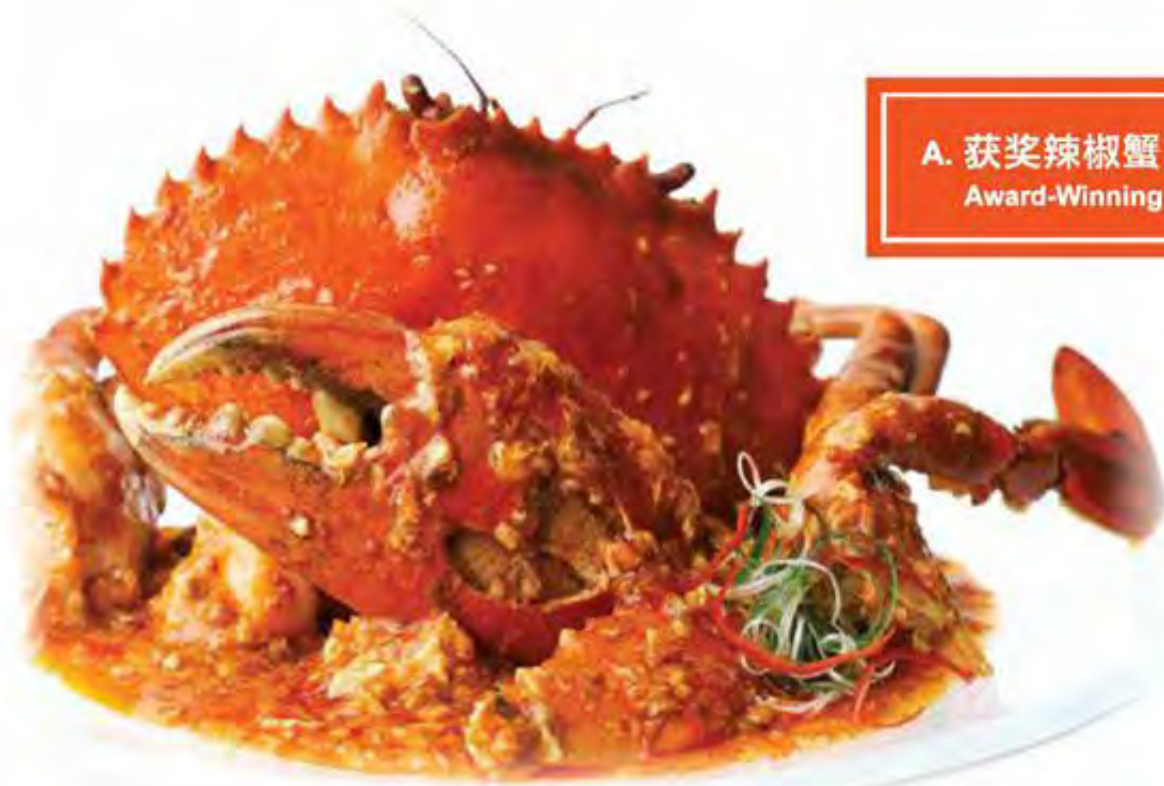
A. 获奖辣椒蟹 Award-Winning Chilli Crab