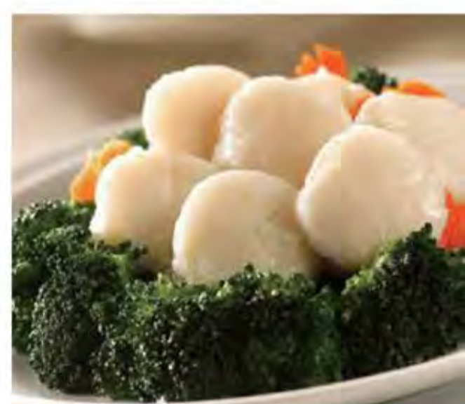
405. 带子炒西兰花 Broccoli Stir Fried with Scallops