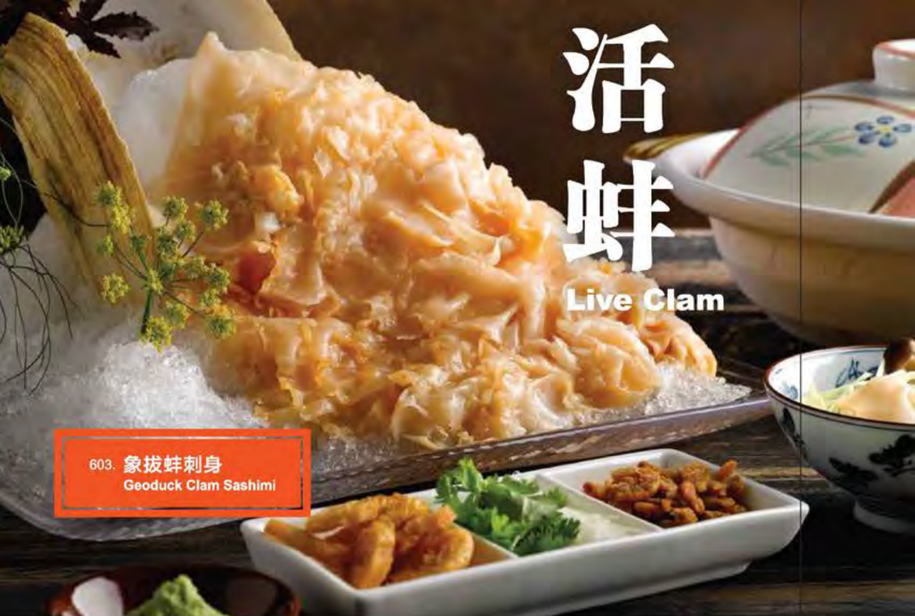
603. 象拔蚌刺身 Geoduck Clam Sashimi