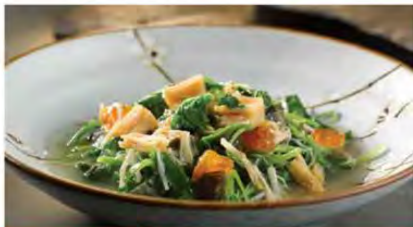
407. 干贝皮蛋苋菜苗 Chinese Spinach Braised with Conpoy and Century Egg