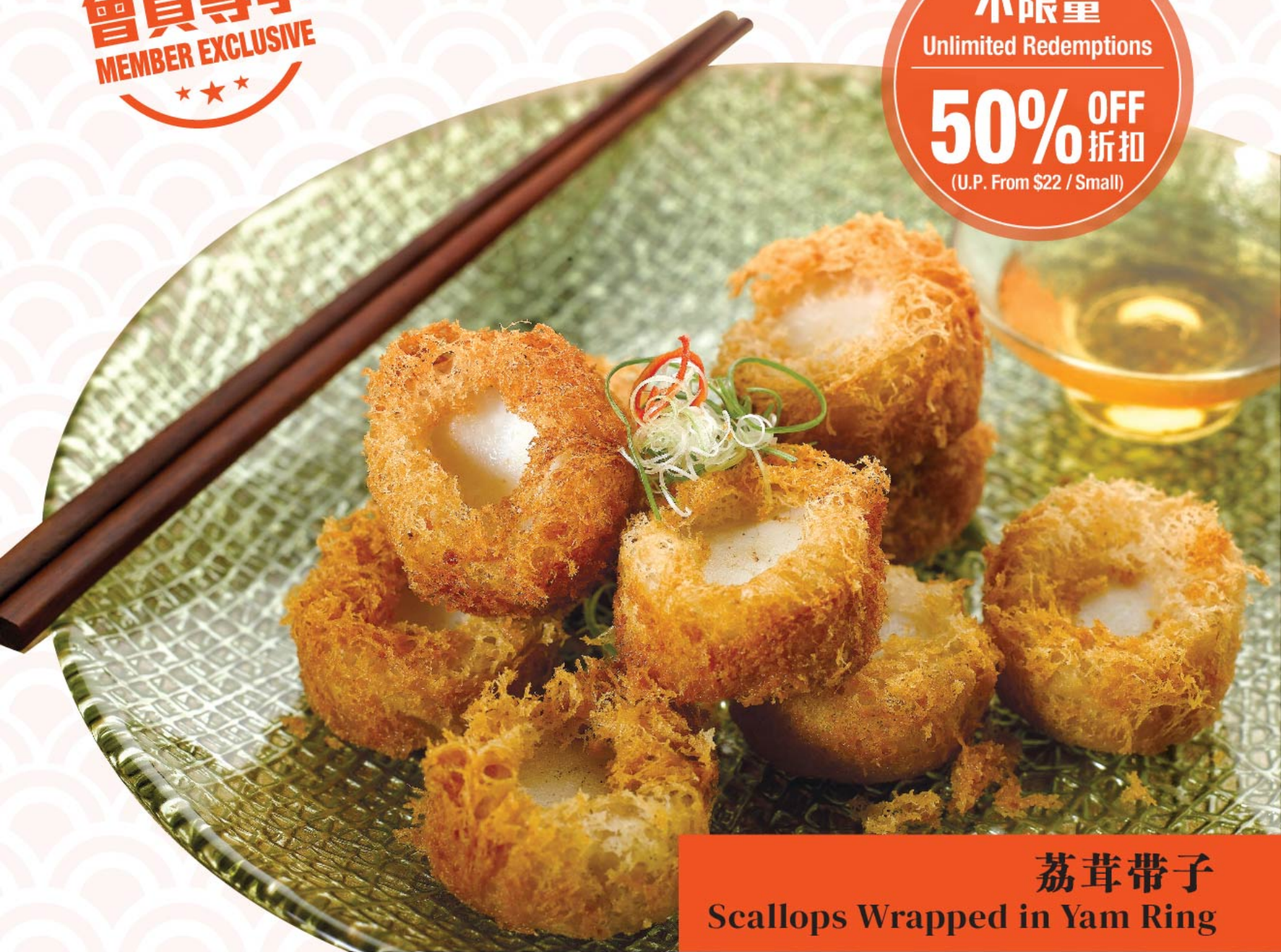
荔茸帶子 Scallops Wrapped in Yam Ring