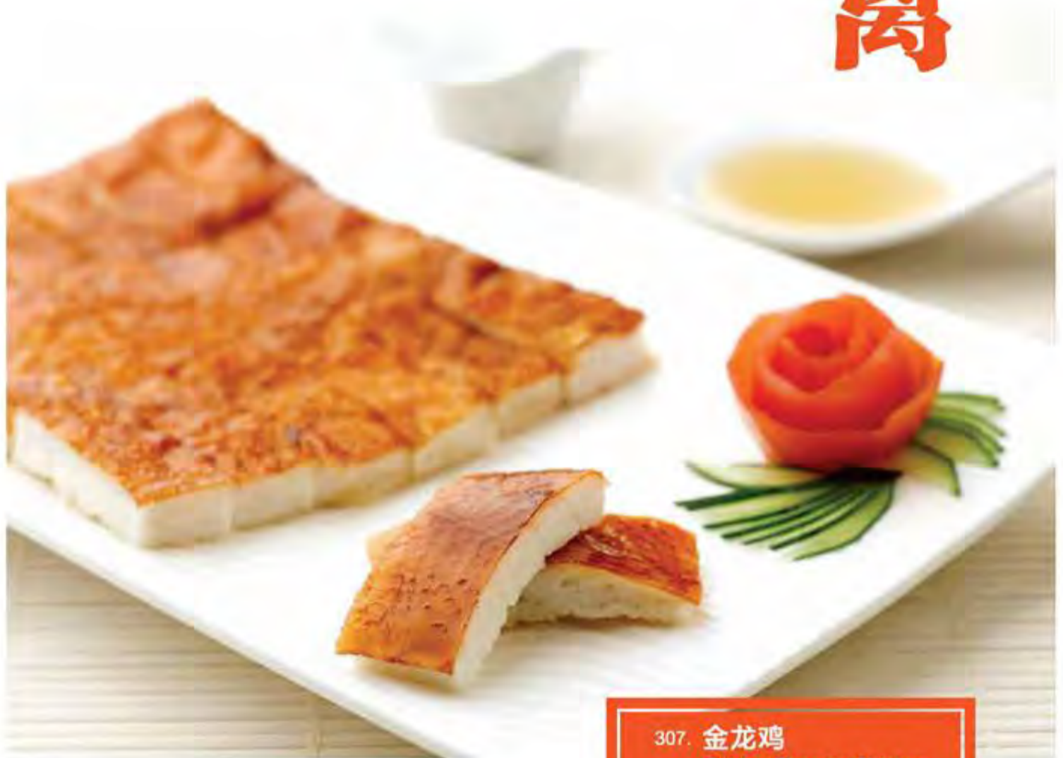
307. 金龙鸡 Golden Phoenix Chicken