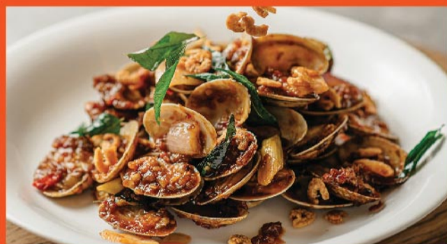
02 甘香啦啦 Live Korean Clam Stir Fried 'Kum Hiong' Style