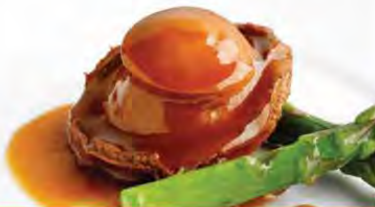
208. 蚝皇原只三头鲍鱼 Whole 3-Head Abalone Braised with Oyster Sauce