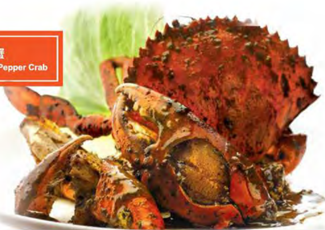
B. 招牌黑胡椒蟹 Signature Black Pepper Crab