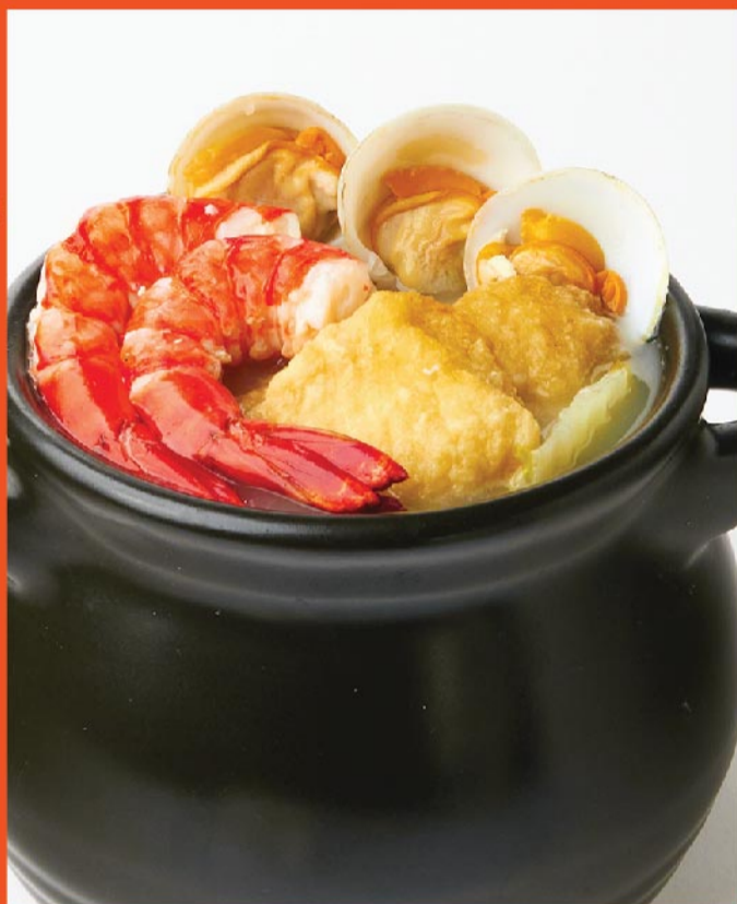
01 三宝汤 Trio Seafood Treasures in Superior Stock