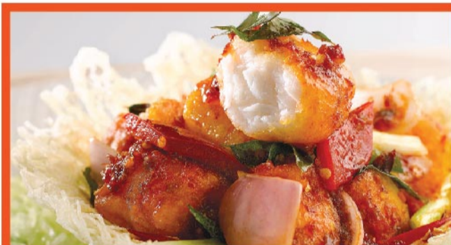
03 酱爆鳕鱼 Cod Fish Wok Fried with Chef's Special Sauce