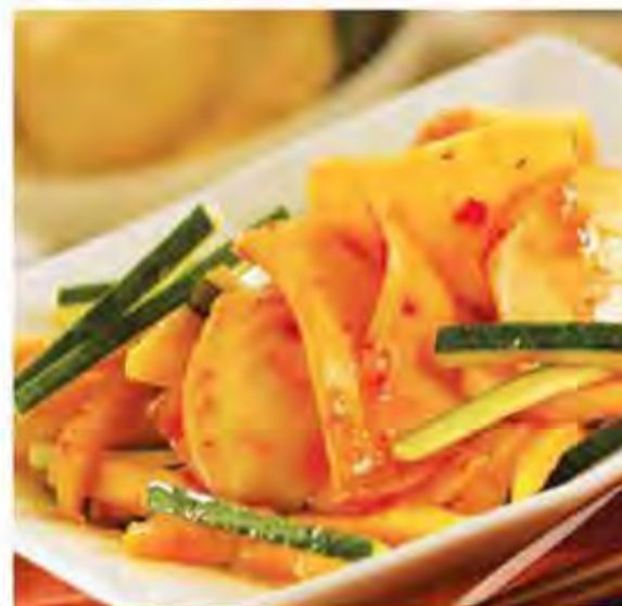
207. 生捞鲍片 Chilled Sliced Abalone with Chef's Special Sauce