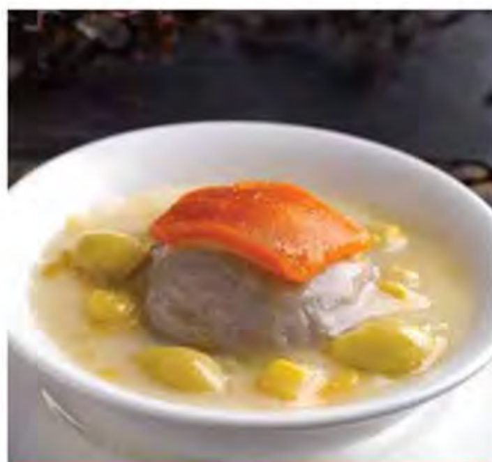
1001. 金瓜白果芋泥 Sweet Yam Paste with Ginkgo Nuts and Pumpkin