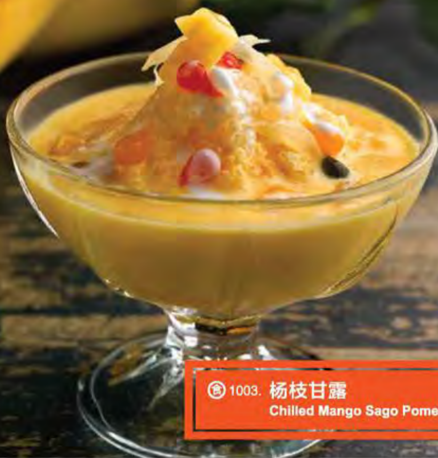
🍽️ 1003. 杨枝甘露 Chilled Mango Sago Pomelo