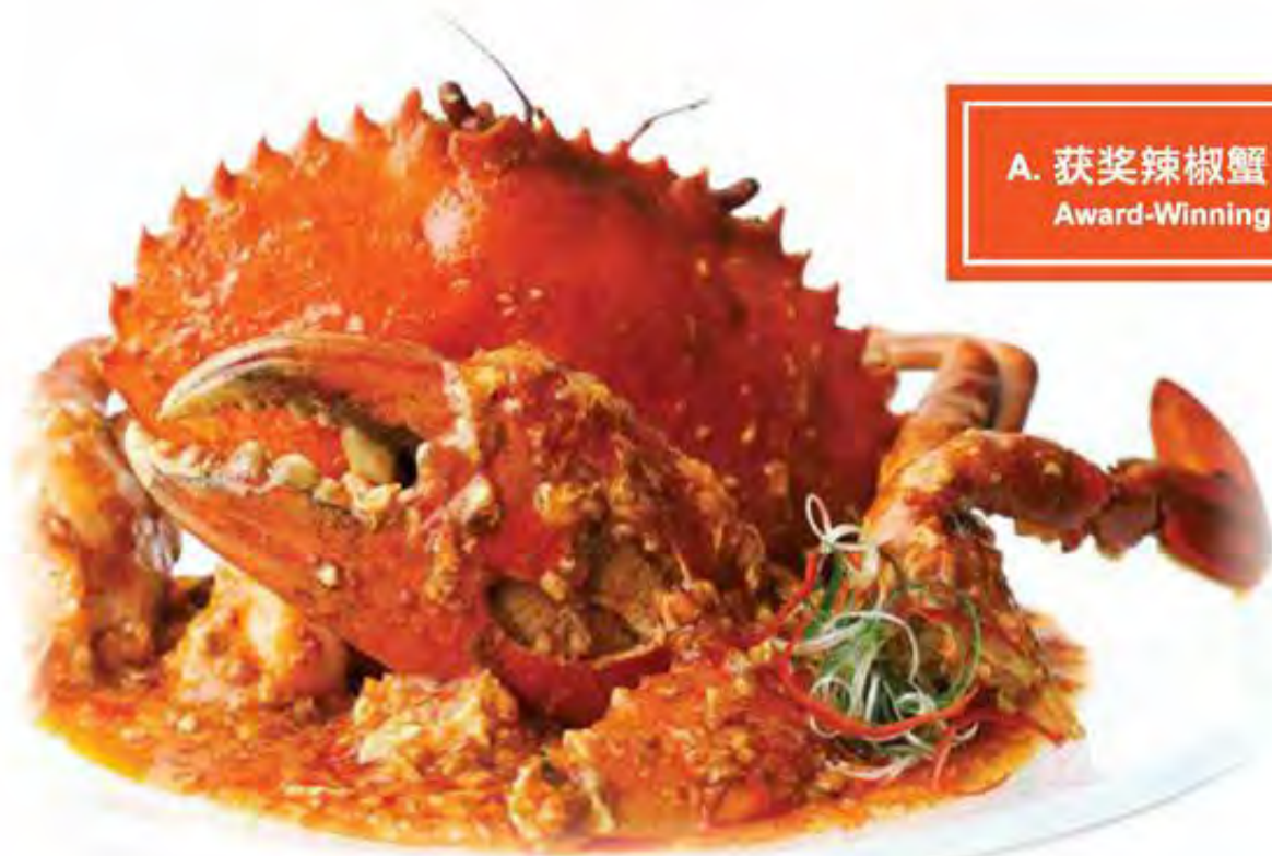
A. 获奖辣椒蟹 Award-Winning Chilli Crab