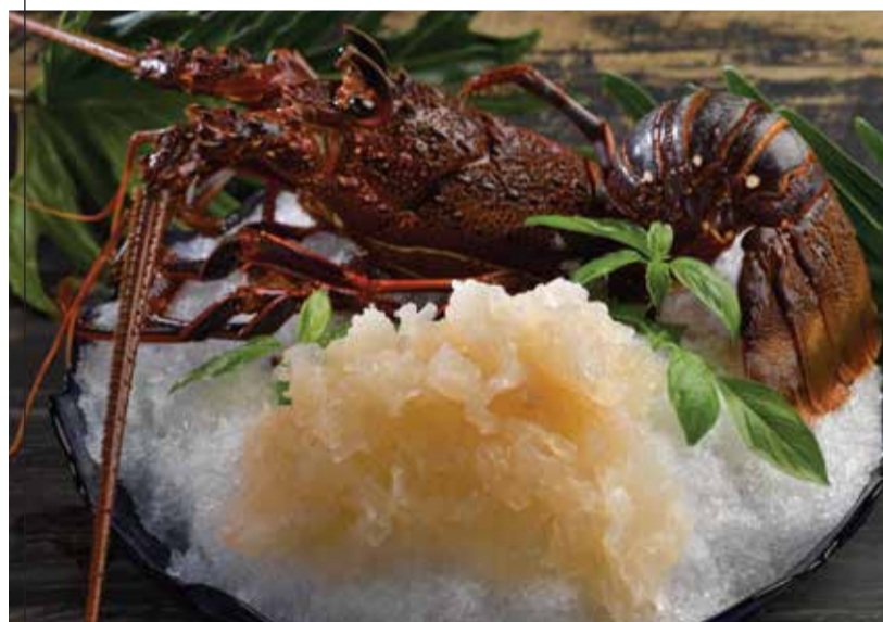
601A. 澳洲龙虾刺身 Australian Lobster Sashimi

A deceptively simple dish that truly exhibits the natural nectar of fresh, live seafood; Boston lobster is carefully braised in superior stock, the sweet broth itself brewed for at least 6 hours with a variety of rich ingredients including premium pork, Yunnan ham and pig skin.