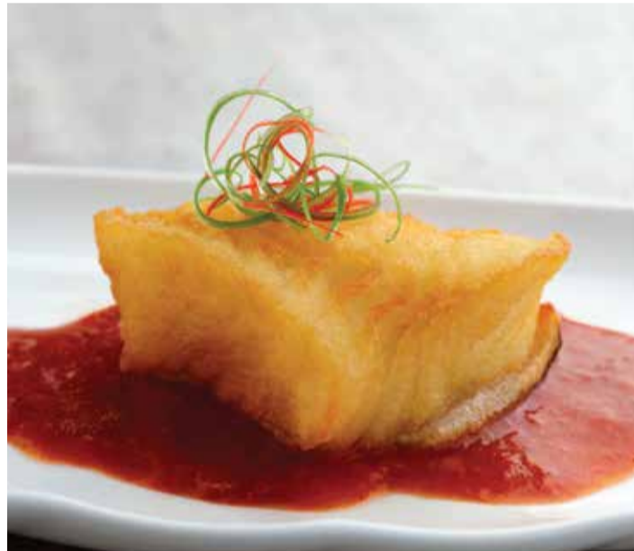
食 502. 娘惹脆香鳕鱼 Crispy Fried Cod Fish with Nonya Sauce