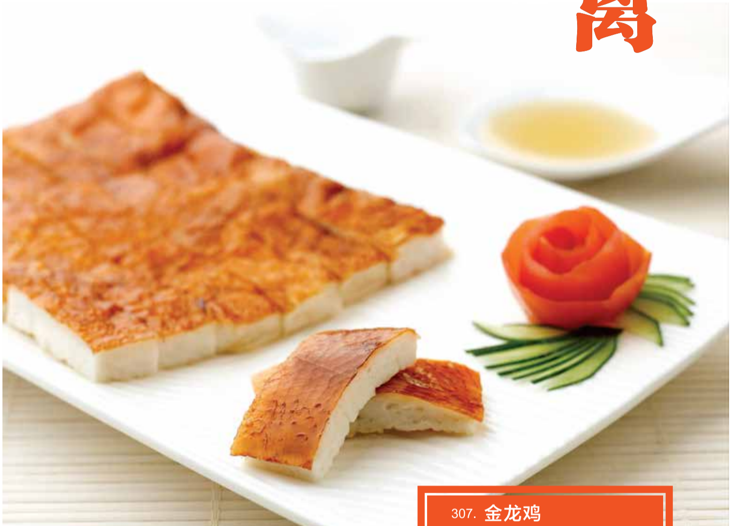
307. 金龙鸡 Golden Phoenix Chicken