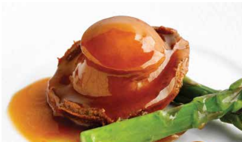
208. 蚝皇原只三头鲍鱼 Whole 3-Head Abalone Braised with Oyster Sauce

210. 蚝皇五头鲍鱼花菇 $30 5-Head Abalone and Shiitake Mushroom Braised with Oyster Sauce