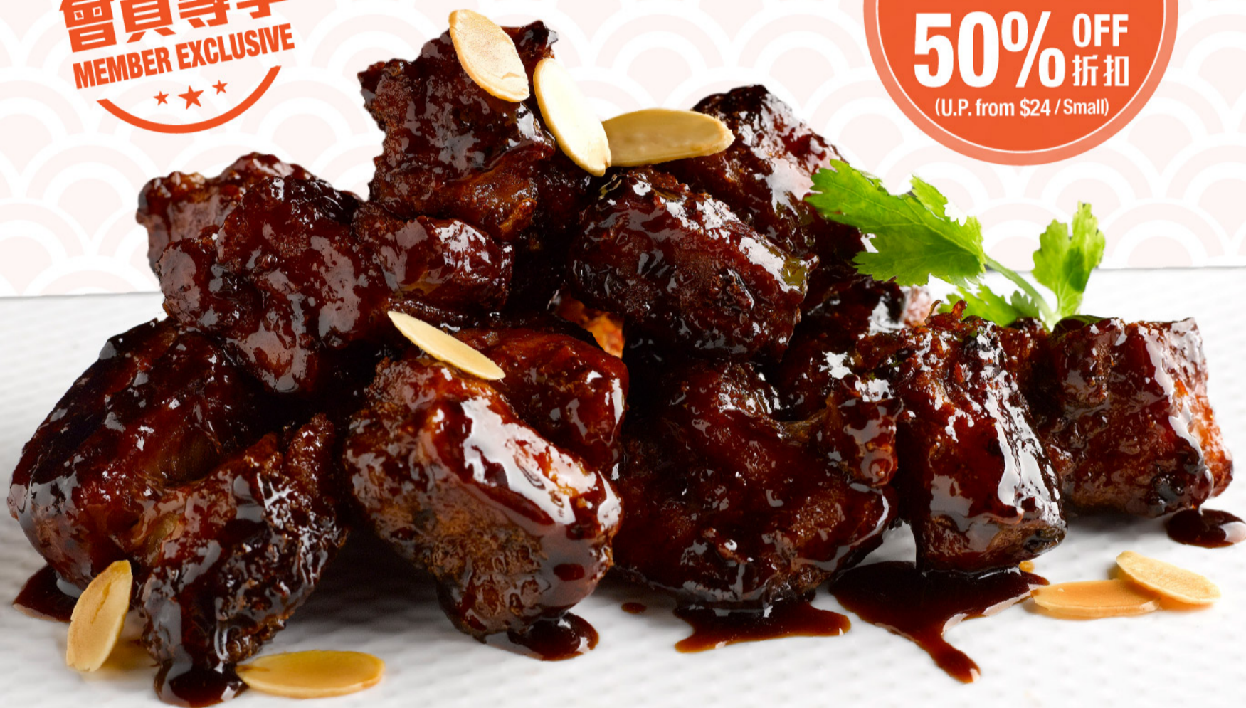
摩卡排骨 Mocha Pork Ribs