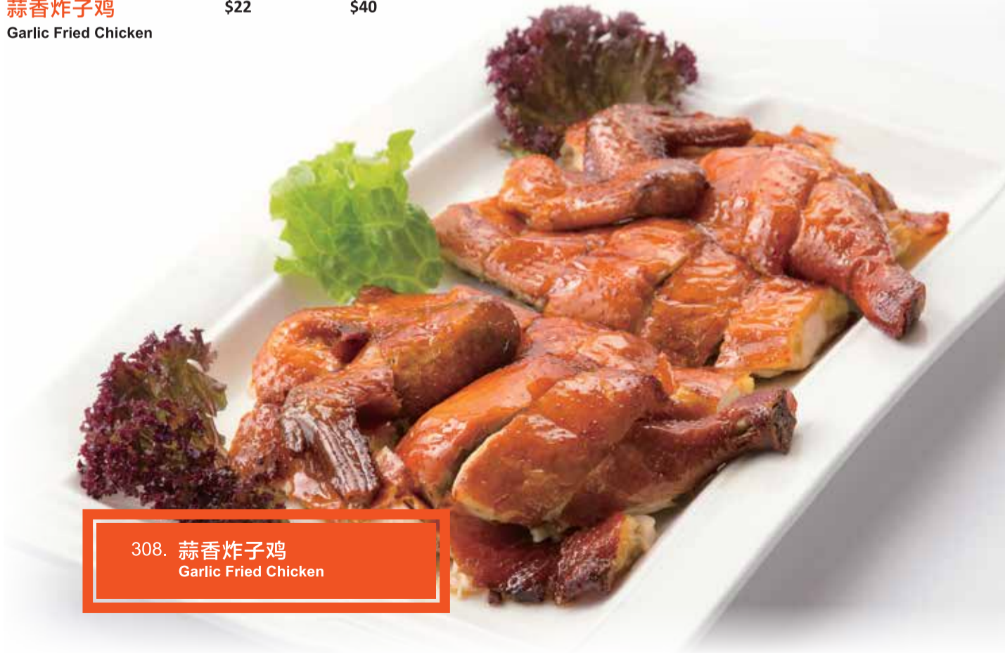
308. 蒜香炸子鸡 Garlic Fried Chicken