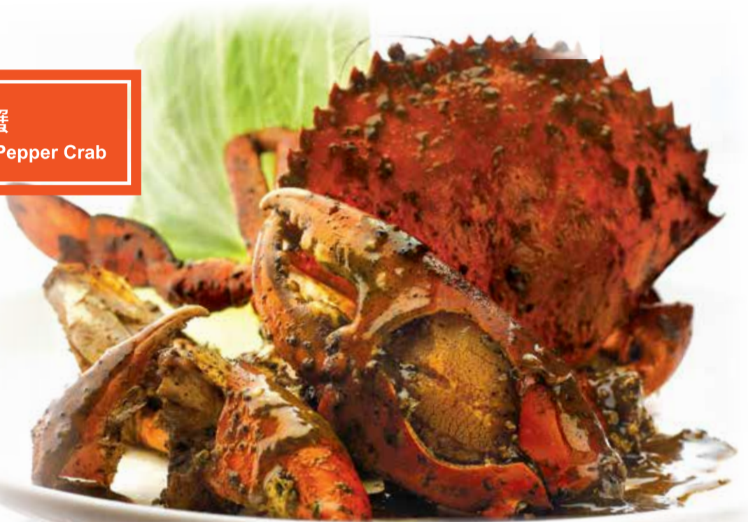
B. 招牌黑胡椒蟹 Signature Black Pepper Crab