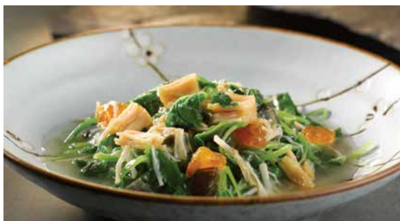
407. 干贝皮蛋苋菜苗 Chinese Spinach Braised with Conpoy and Century Egg