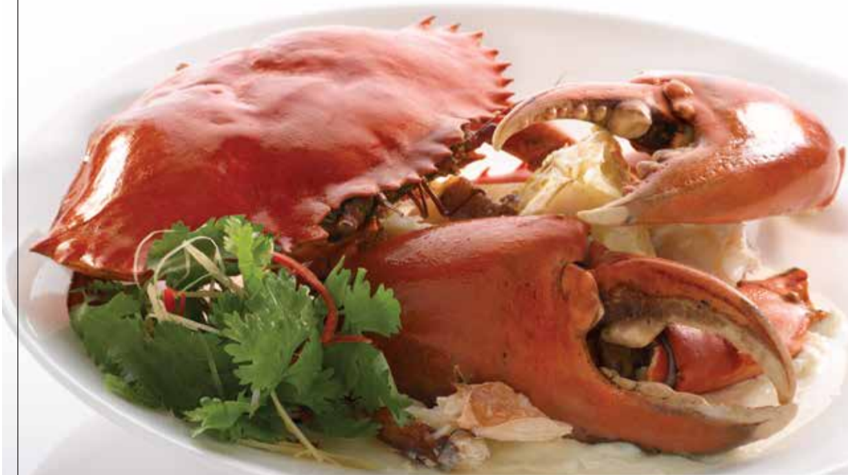
D. 花雕蛋白蒸蟹 Steamed Crab with Chinese Wine and Egg White

爱吃螃蟹的行家都会以螃蟹的鲜甜味为主，坚决选择吃蒸蟹。厨师们采用了豆浆，花雕酒和蛋白让蒸蟹显得更为突出。花雕酒不仅提升螃蟹的鲜味，也带出豆浆和蛋白的纤细口感，凸显出蟹肉的甜味。