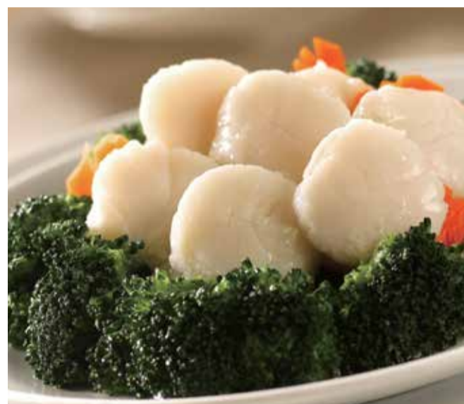
405. 带子炒西兰花 Broccoli Stir Fried with Scallops