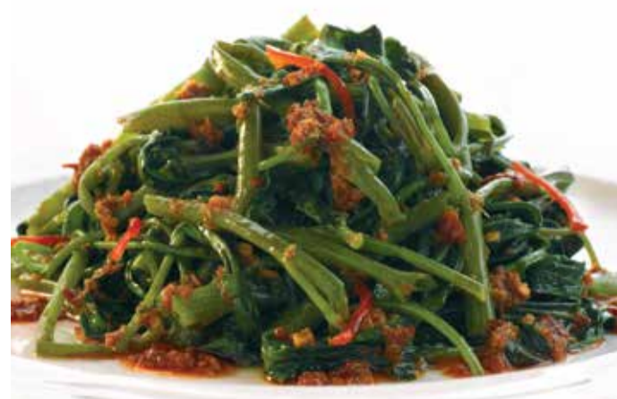
406. 马来风光 'Kang Kong' Stir Fried with Sambal