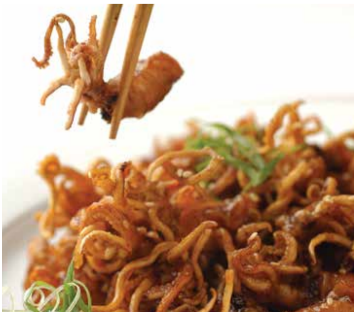
食 507. 脆炸苏东仔 Crispy Fried Baby Squid