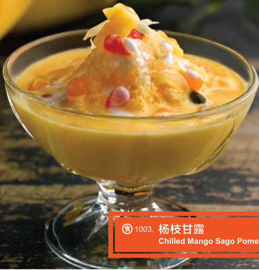
🍽️ 1003. 杨枝甘露 Chilled Mango Sago Pomelo