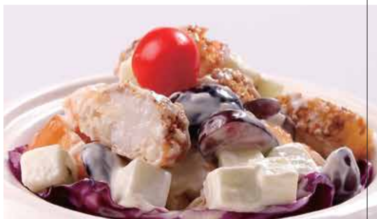
食 105. 鲜果生汁油条 Seafood Donut Tossed in Salad Cream