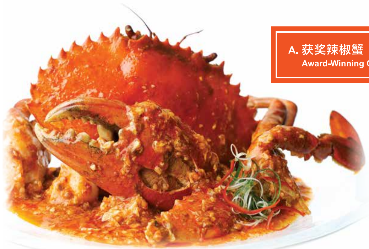
A. 获奖辣椒蟹 Award-Winning Chilli Crab