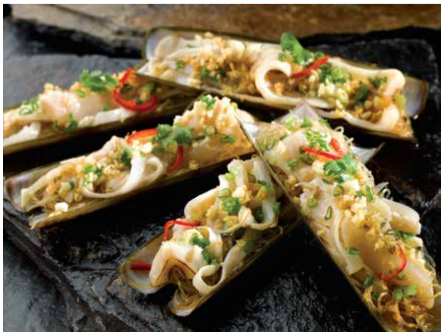
606. 蒜茸蒸竹蚌 Bamboo Clam Steamed with Minced Garlic