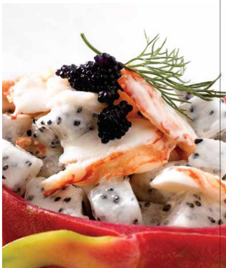
食 102. 鱼子酱龙珠果龙虾沙律 Dragonfruit Lobster Salad with Lumpfish Caviar

106. 咸蛋金沙虾吧 $9.80 Golden Salted Egg Prawn Chins