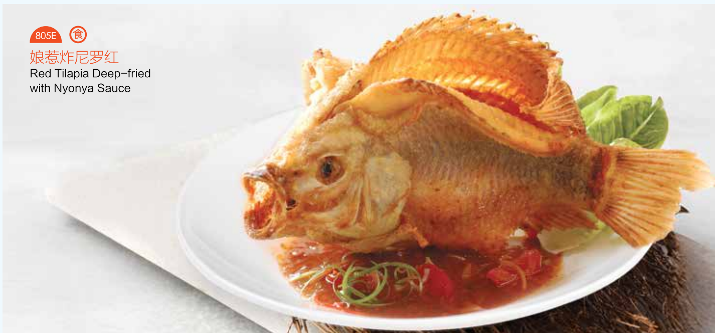
娘惹炸尼罗红 Red Tilapia Deep-fried with Nyonya Sauce