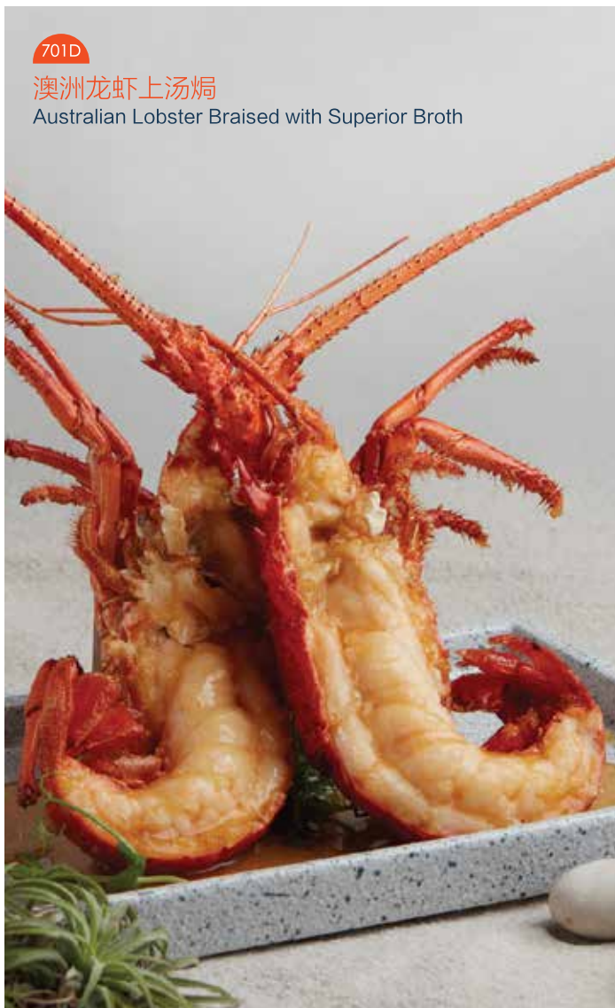
701D 澳洲龙虾上汤焗 Australian Lobster Braised with Superior Broth