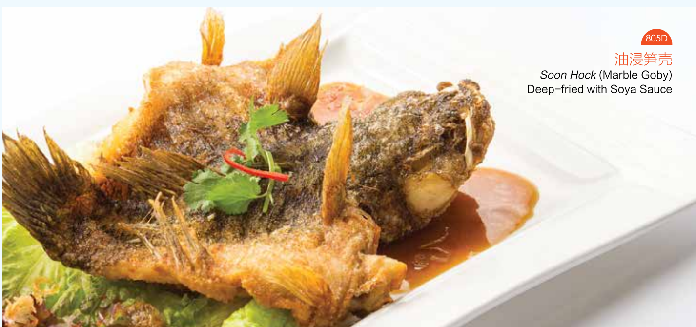
油浸笋壳 Soon Hock (Marble Goby) Deep-fried with Soya Sauce