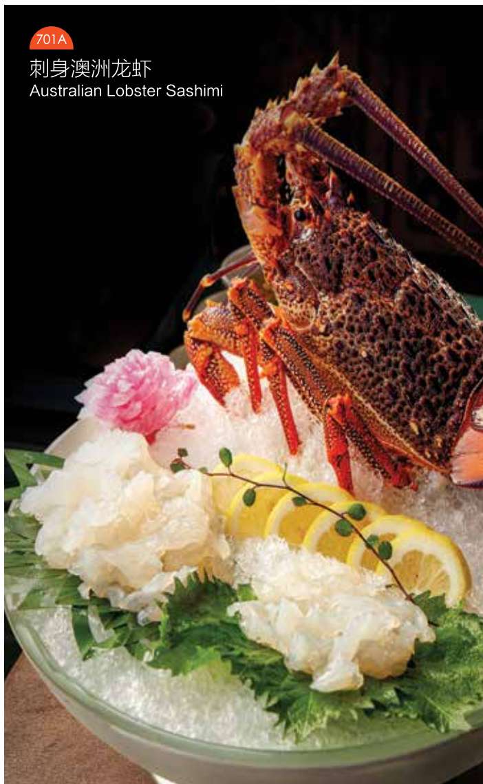
701A 刺身澳洲龙虾 Australian Lobster Sashimi