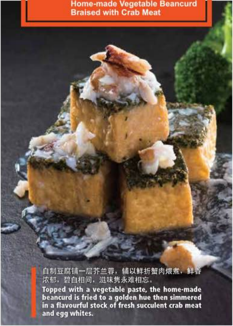
401. 蟹肉扒翡翠豆腐 Home-made Vegetable Beancurd Braised with Crab Meat

自制豆腐铺一层芥兰蓉，辅以鲜折蟹肉焗煮，鲜香浓郁，碧白相间，滋味隽永难相忘。 Topped with a vegetable paste, the home-made beancurd is fried to a golden hue then simmered in a flavourful stock of fresh succulent crab meat and egg whites.