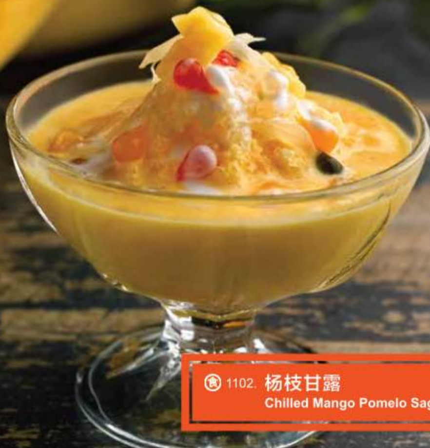
1102. 杨枝甘露 Chilled Mango Pomelo Sago