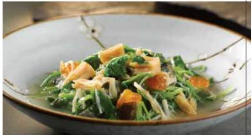
407. 干贝皮蛋苋菜苗 Chinese Spinach Braised with Conpoy and Century Egg