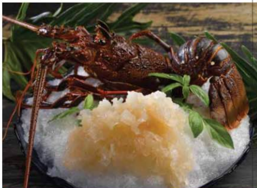
601A. 澳洲龙虾刺身 Australian Lobster Sashimi