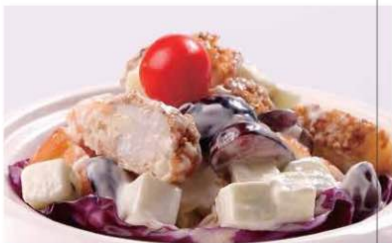
🍴 103. 鲜果生汁油条 Seafood Donut Tossed in Salad Cream