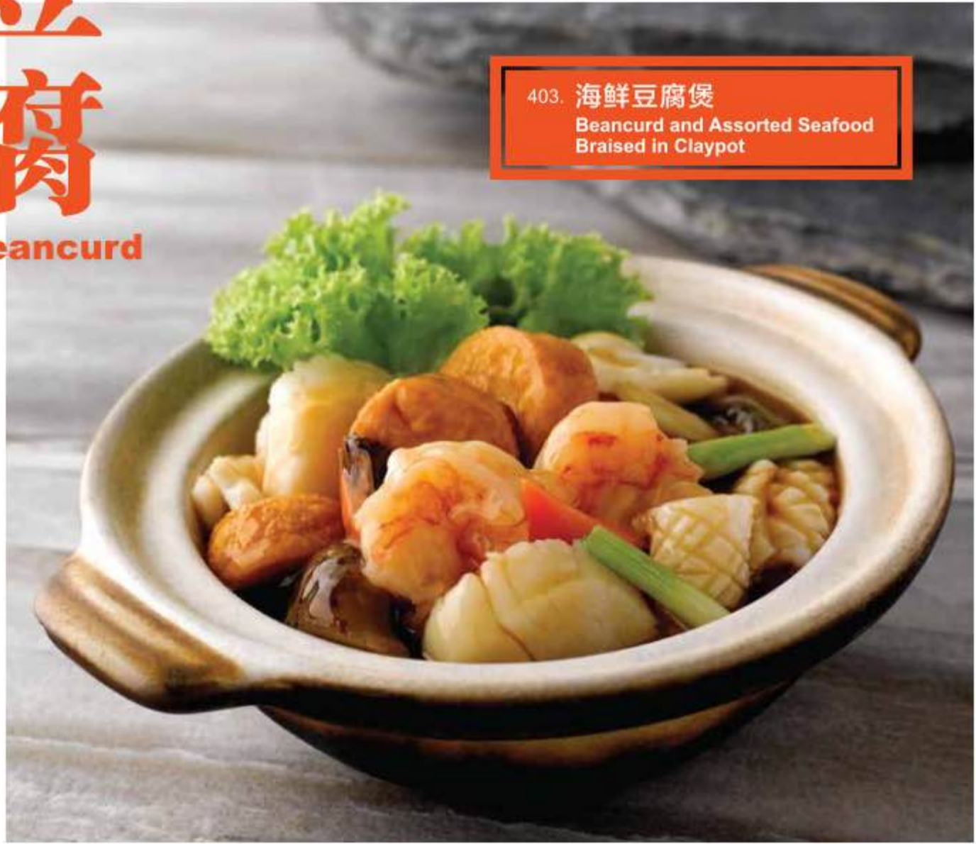
403. 海鲜豆腐煲 Beancurd and Assorted Seafood Braised in Claypot