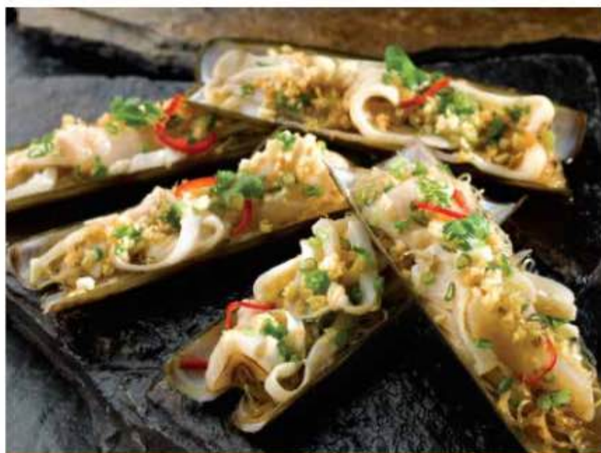
606. 蒜茸蒸竹蚌 Bamboo Clam Steamed with Minced Garlic