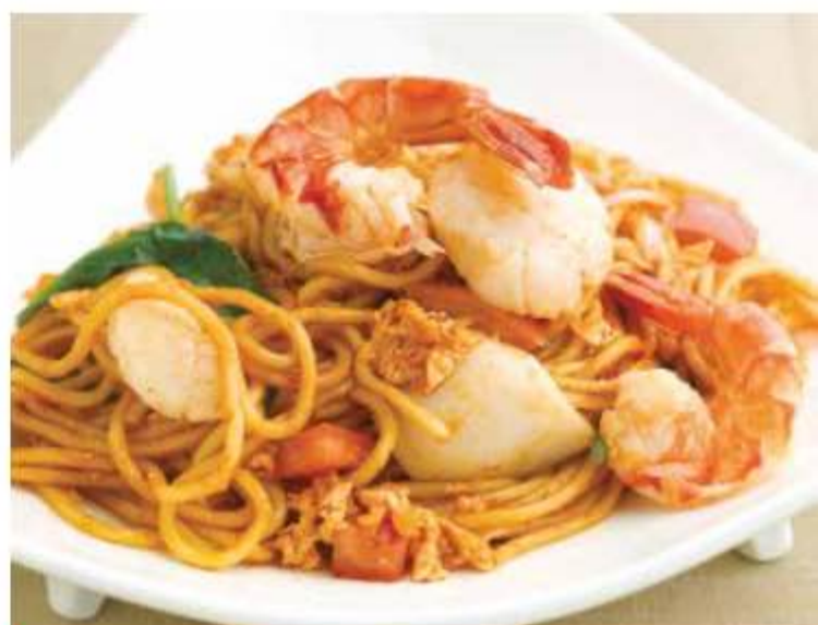
🍽️ 1004. 马来炒面 Mee Goreng - Fried Noodles Malay Style