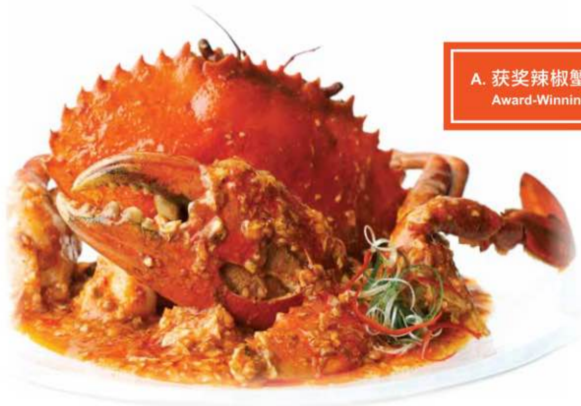
A. 获奖辣椒蟹 Award-Winning Chilli Crab