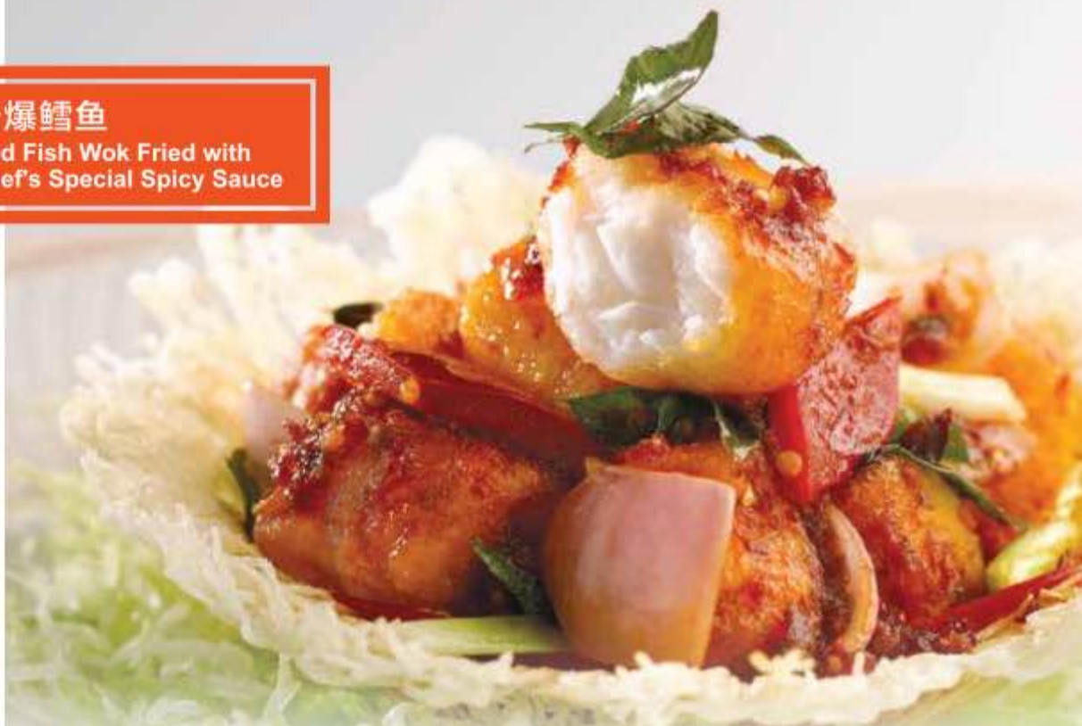
🍴 503. 酱爆鳕鱼 Cod Fish Wok Fried with Chef's Special Spicy Sauce

色泽金黄的鳕鱼块辅以辛辣的东南亚特色酱料，外层香辣酥脆，内里细腻鲜美！ This delicious creation of golden cod fish ingots is glazed with a piquant sauce made from a blend of exotic Southeast Asian spices, crusty on the outside, whilst moist and tender within.