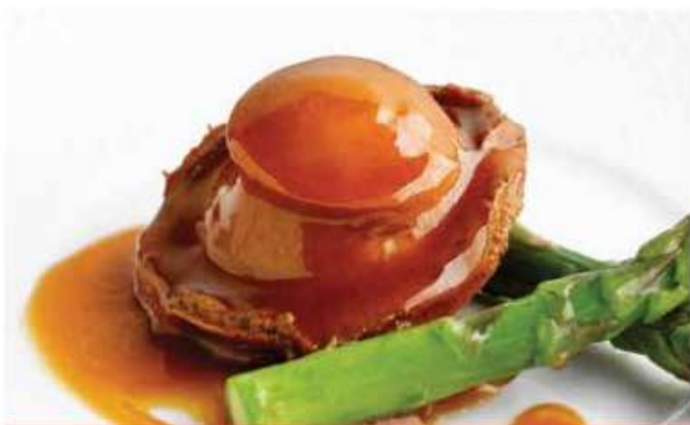
207. 红煨原只四头鲜鲍 Whole 4-Head Abalone Braised with Abalone Sauce and Seasonal Vegetable