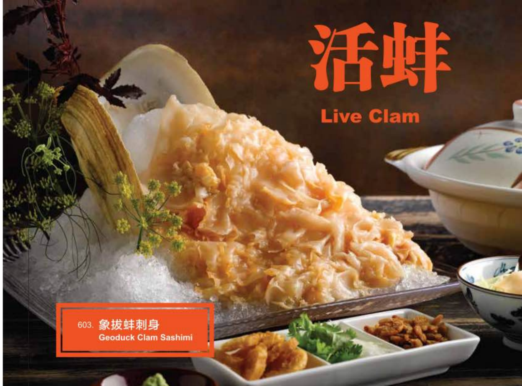
603. 象拔蚌刺身 Geoduck Clam Sashimi