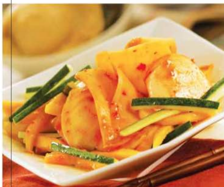
206. 生捞鲍片 Chilled Sliced Abalone with Chef's Special Sauce

Whet your appetite with a pot of liquid sunshine: this rich, velvety golden soup showcases a medley of premium seafood ingredients; the sweetness of fresh scallops and prawns against a backdrop of creamy, ambrosial pumpkin.