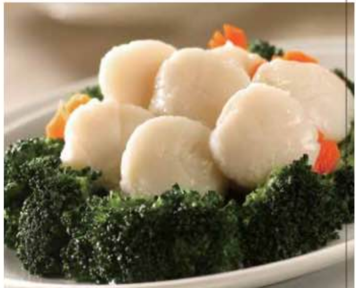
405. 带子炒西兰花 Broccoli Stir Fried with Scallops