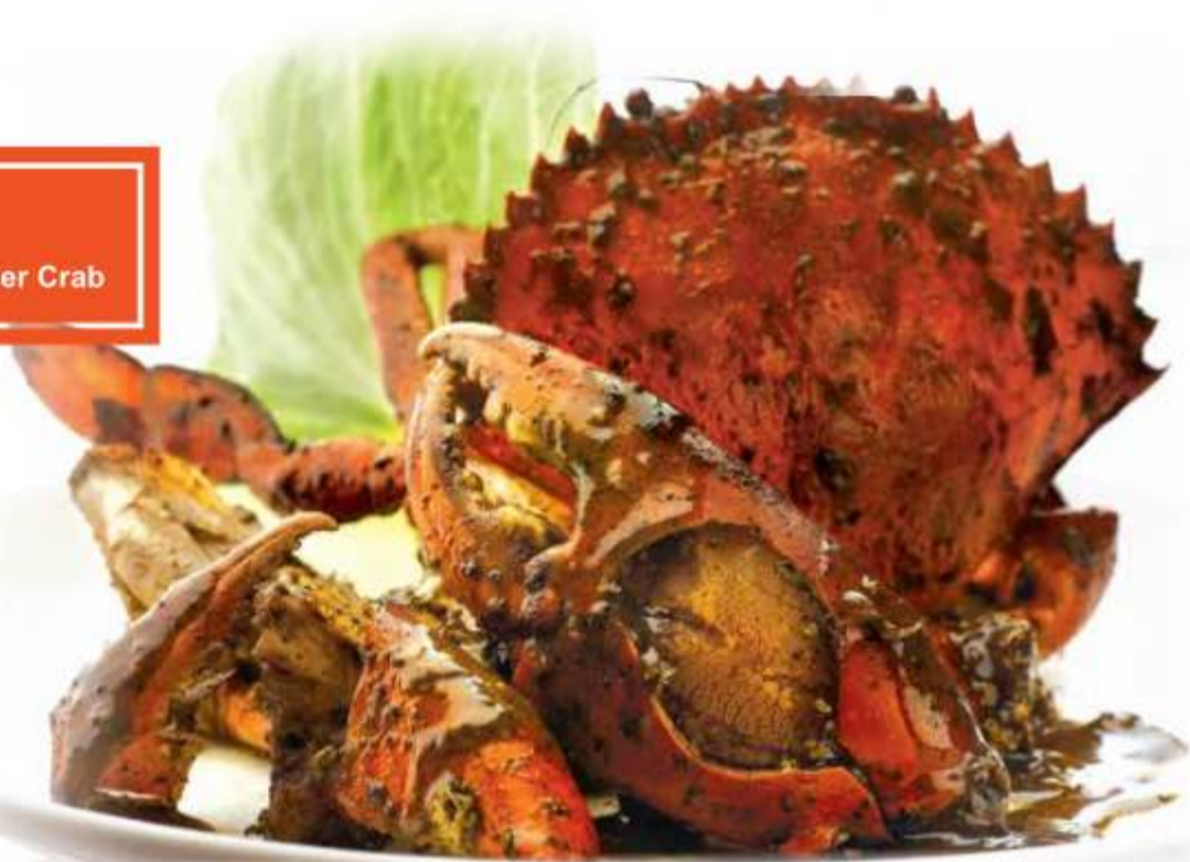
B. 招牌黑胡椒蟹 Signature Black Pepper Crab