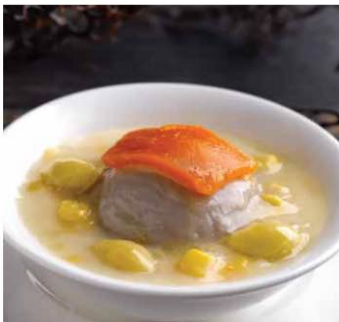
1101. 金瓜白果芋泥 Sweet Yam Paste with Gingko Nuts and Pumpkin

1104. 鲜果青柠冻 $6 Chilled Lime Jelly with Mixed Fruits