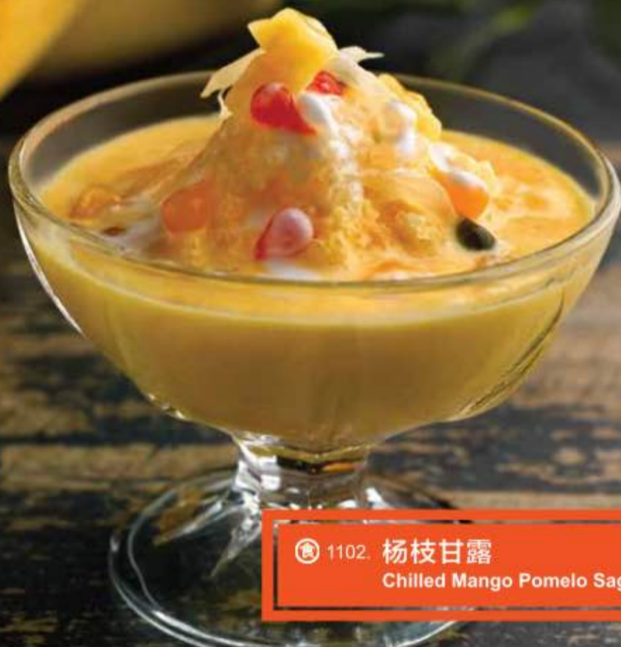
1102. 杨枝甘露 Chilled Mango Pomelo Sago