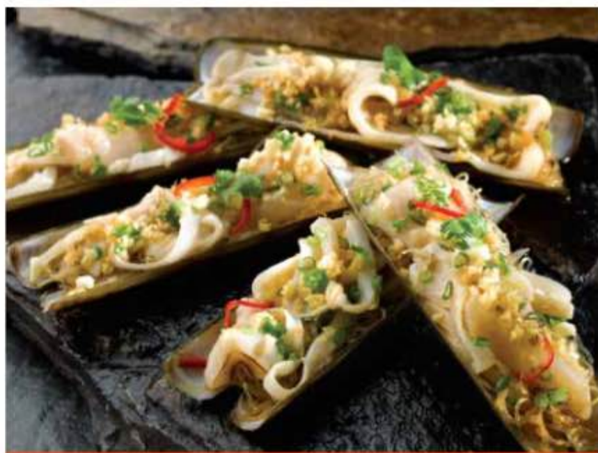
606. 蒜茸蒸竹蚌 Bamboo Clam Steamed with Minced Garlic