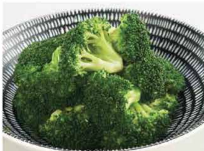
410A. 蒜茸炒西兰花 Broccoli Stir Fried with Minced Garlic