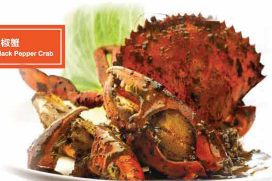
B. 招牌黑胡椒蟹 Signature Black Pepper Crab