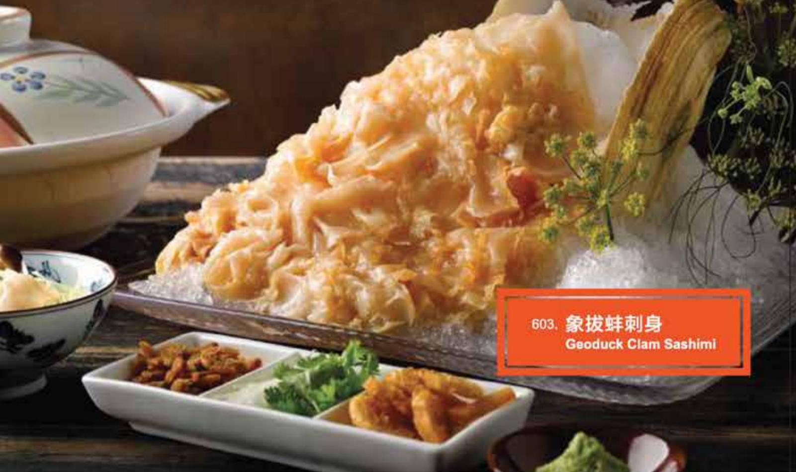
603. 象拔蚌刺身 Geoduck Clam Sashimi