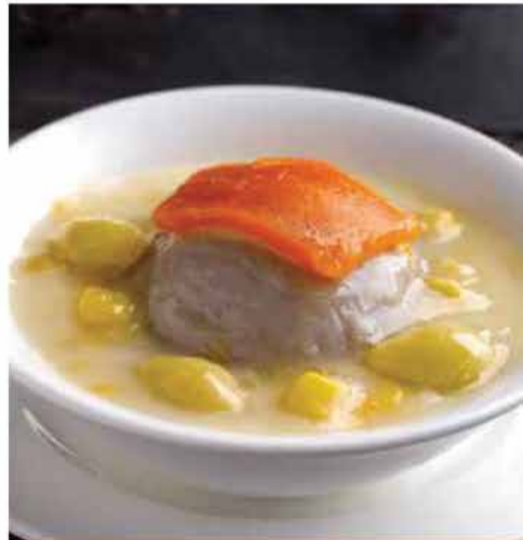
1001. 金瓜白果芋泥 Sweet Yam Paste with Gingko Nuts and Pumpkin