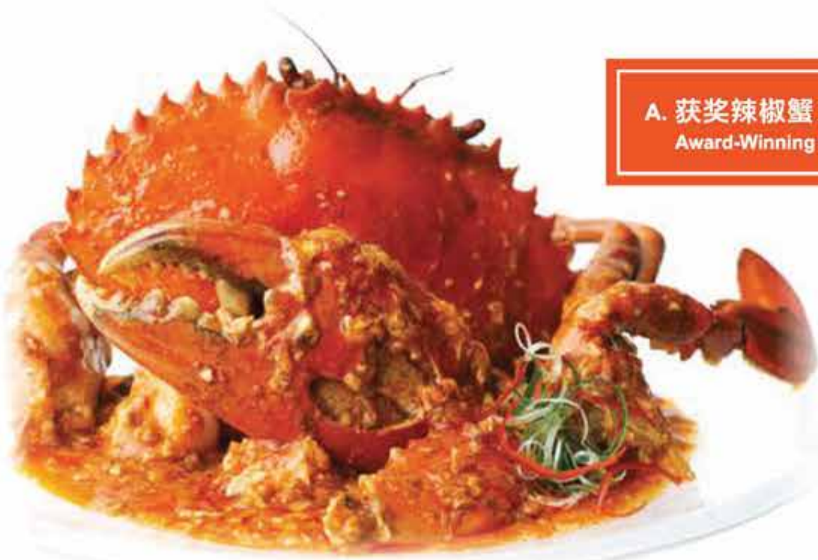
A. 获奖辣椒蟹 Award-Winning Chilli Crab