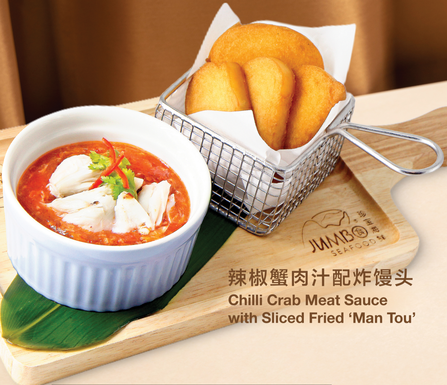
辣椒蟹肉汁配炸馒头 Chilli Crab Meat Sauce with Sliced Fried 'Man Tou'