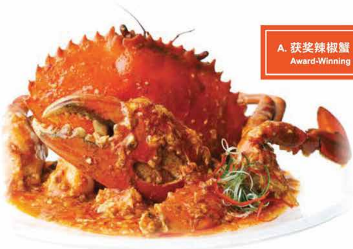
A. 获奖辣椒蟹 Award-Winning Chilli Crab