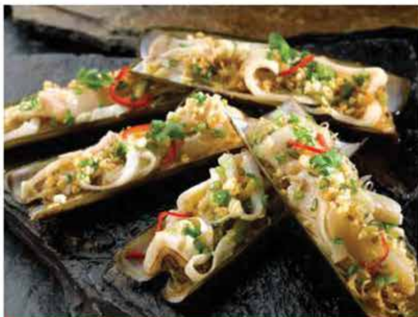
606. 蒜茸蒸竹蚌 Bamboo Clam Steamed with Minced Garlic