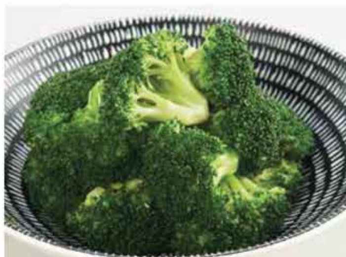
410A. 蒜茸炒西兰花 Broccoli Stir Fried with Minced Garlic