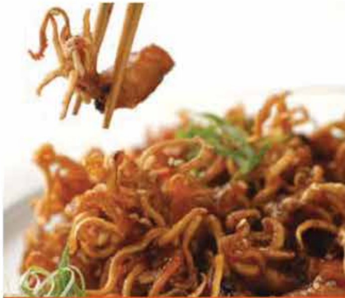
507. 脆炸苏东仔 Crispy Fried Baby Squid