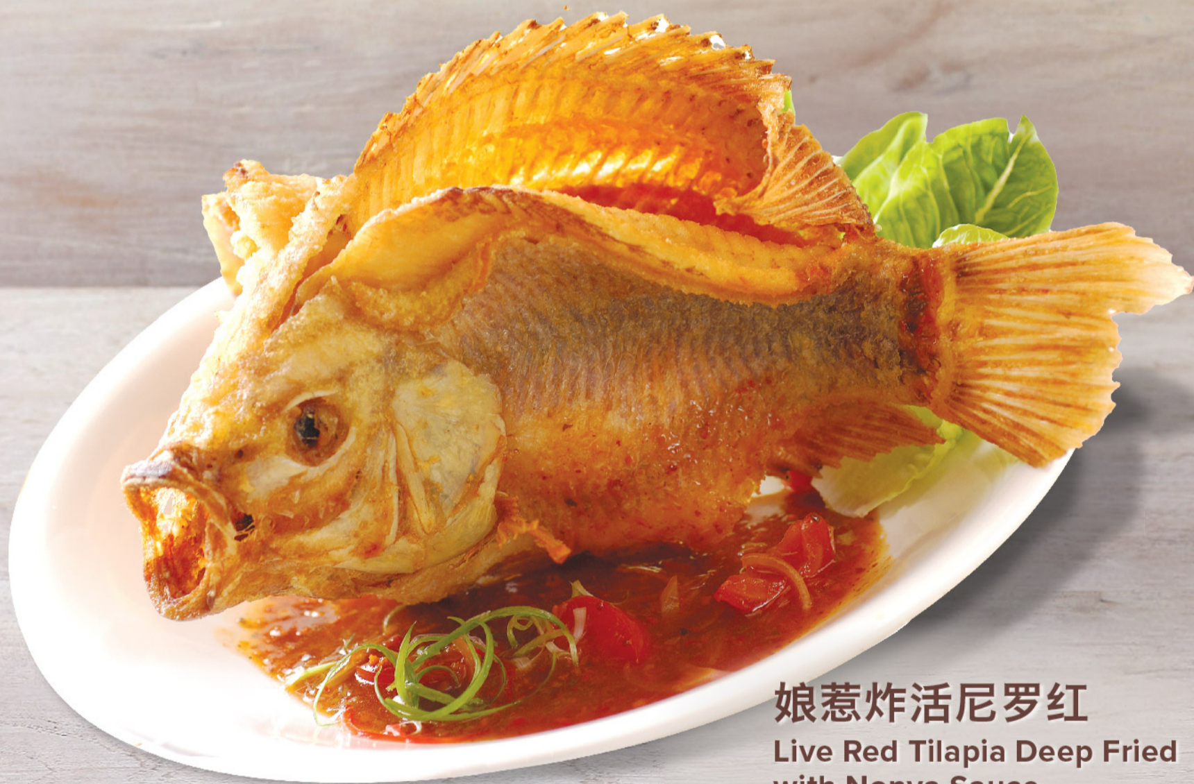
娘惹炸活尼罗红 Live Red Tilapia Deep Fried with Nonya Sauce