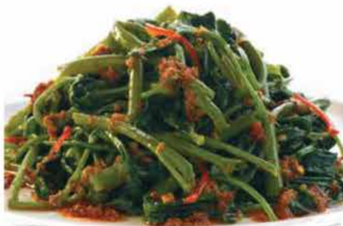
412C. 叁巴应菜 'Kang Kong' Stir Fried with Sambal