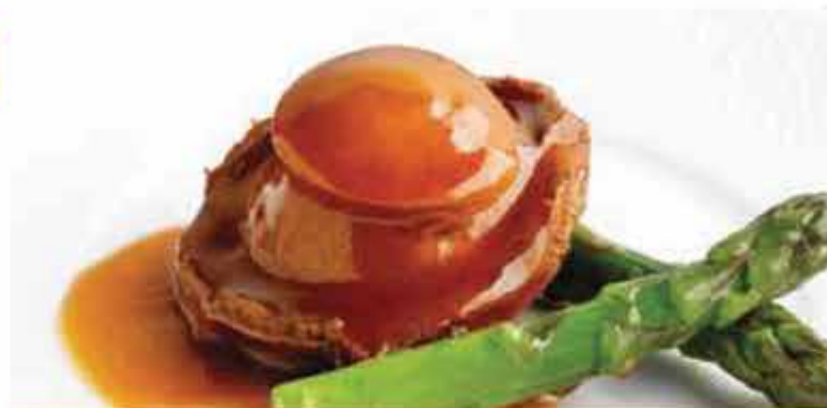
209. 蚝皇原只三头鲍鱼 Whole 3-Head Abalone Braised with Oyster Sauce