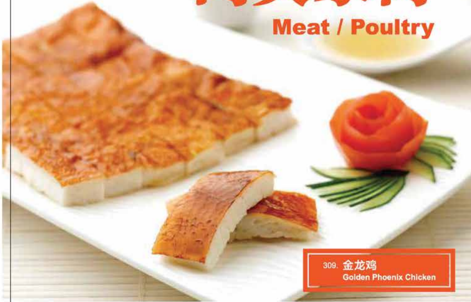
309. 金龙鸡 Golden Phoenix Chicken