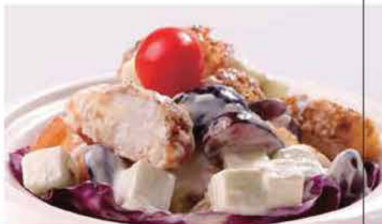
🍴 105. 鲜果生汁油条 Seafood Donut Tossed in Salad Cream