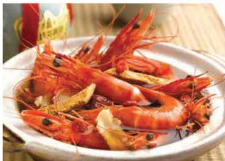
706. 药材醉活虾 Herbal Drunken Live Prawns