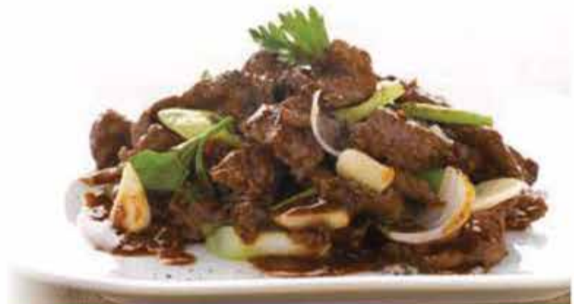
305. 姜葱炒鹿肉 Venison (Deer Meat) Stir Fried with Ginger and Spring Onions