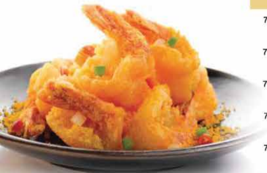
🍴 716. 咸蛋金沙虾球 Shelled Prawns Fried with Golden Salted Egg