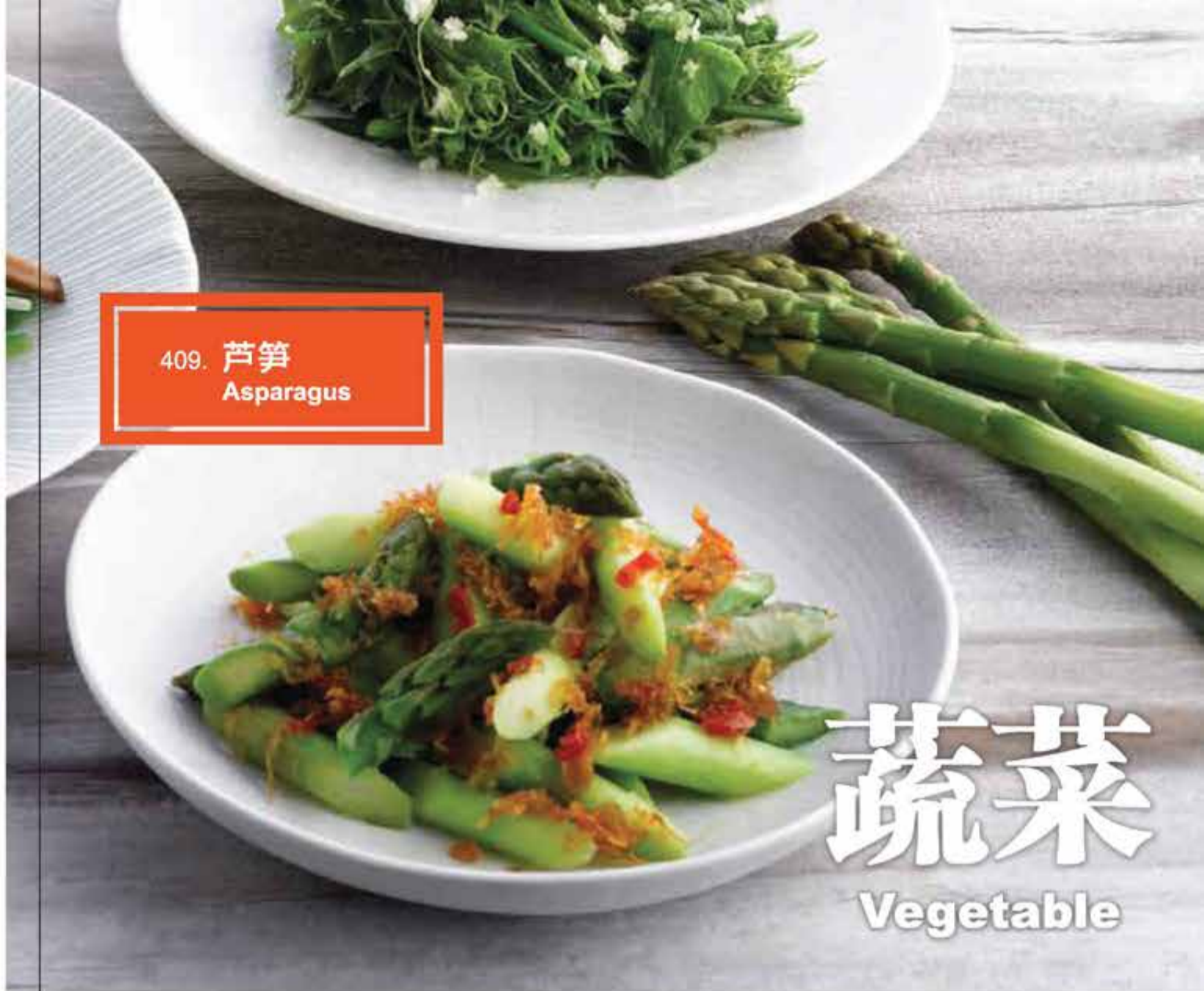
409. 芦笋 Asparagus