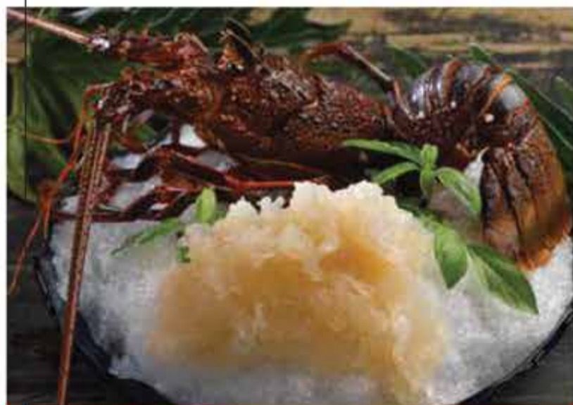
601A. 澳洲龙虾刺身 Australian Lobster Sashimi

A deceptively simple dish that truly exhibits the natural nectar of fresh, live seafood; Boston lobster is carefully braised in superior stock, the sweet broth itself brewed for at least 6 hours with a variety of rich ingredients including premium pork, Yunnan ham and pig skin.