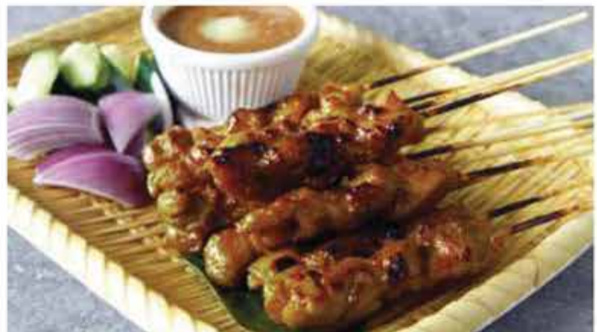
308. 特制沙爹(鸡肉/猪肉) Jumbo Satay (Chicken / Pork)