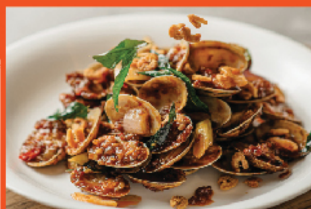
02 Live Korean Clam Stir Fried 'Kum Hiong' Style