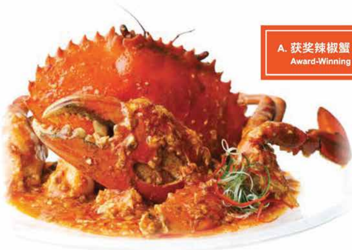
A. 获奖辣椒蟹 Award-Winning Chilli Crab