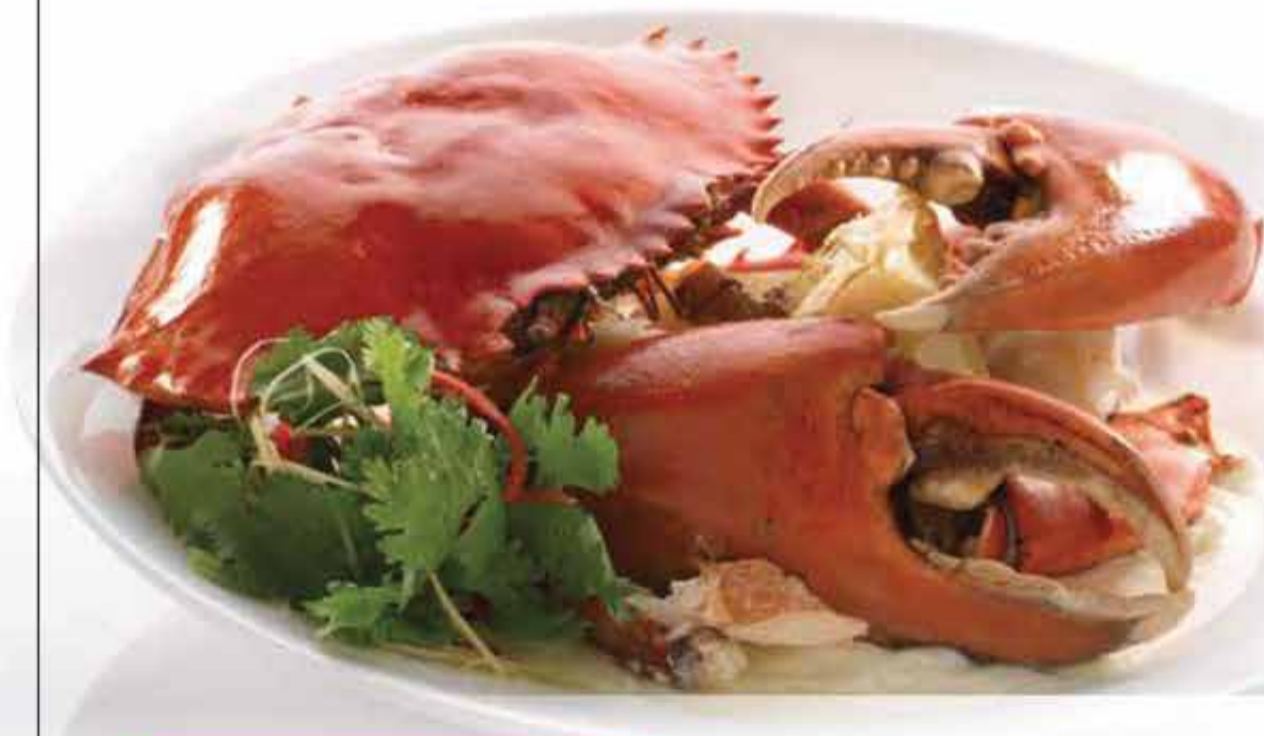
D. 花雕蛋白蒸蟹 Steamed Crab with Chinese Wine and Egg White

爱吃螃蟹的行家都会以螃蟹的鲜甜味为主，坚决选择吃蒸蟹。厨师们采用了豆浆，花雕酒和蛋白让蒸蟹显得更为突出。花雕酒不仅提升螃蟹的鲜味，也带出豆浆和蛋白的纤细口感，凸显出蟹肉的甜味。