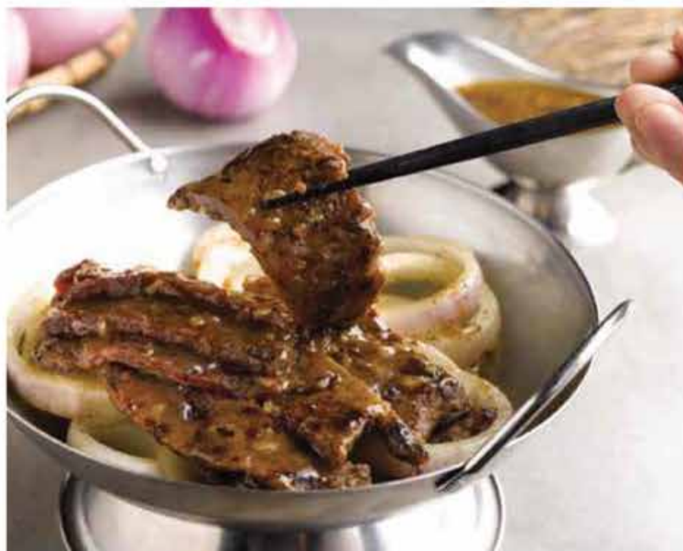
302. 鑊仔牛柳 Beef Fillet with Black Pepper Sauce