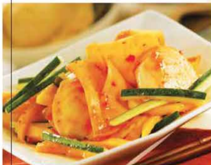
208. 生捞鲍片 Chilled Sliced Abalone with Chef's Special Sauce

Whet your appetite with a pot of liquid sunshine: this rich, velvety golden soup showcases a medley of premium seafood ingredients; the sweetness of fresh scallops and prawns against a backdrop of creamy, ambrosial pumpkin.