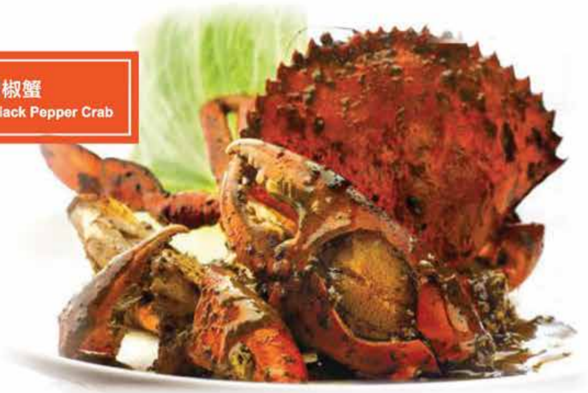
B. 招牌黑胡椒蟹 Signature Black Pepper Crab