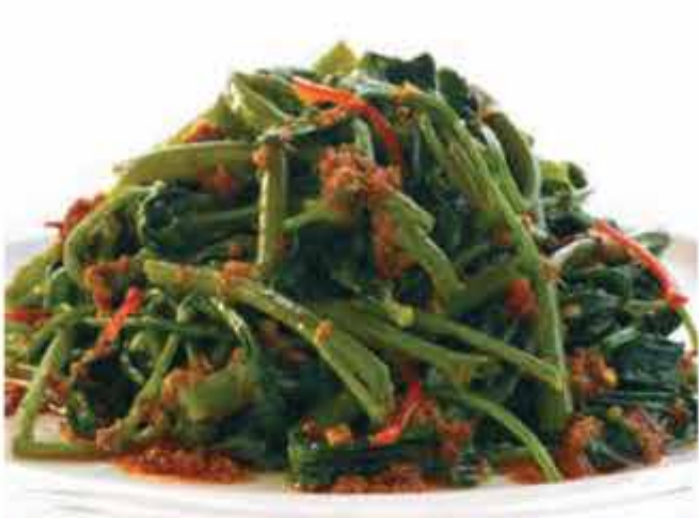
412C. 叁巴应菜 'Kang Kong' Stir Fried with Sambal