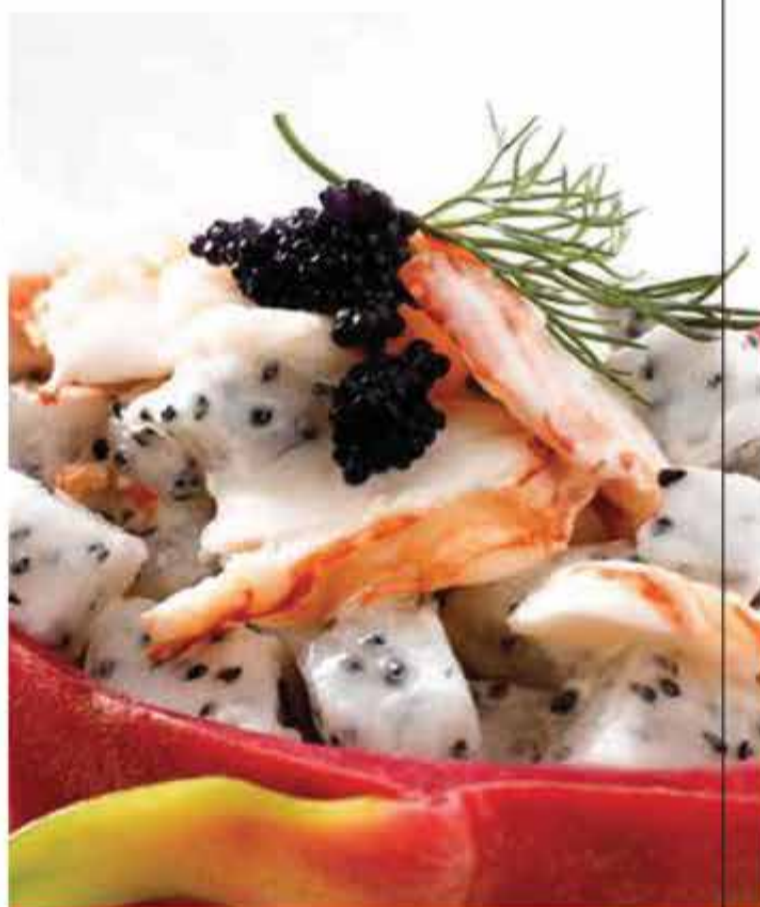
🍴 102. 鱼子酱龙珠果龙虾沙律 Dragonfruit Lobster Salad with Lumpfish Caviar