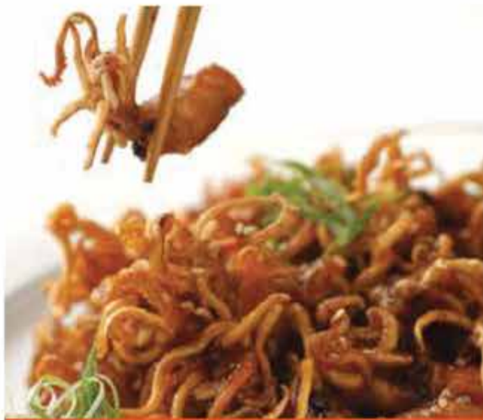
507. 脆炸苏东仔 Crispy Fried Baby Squid