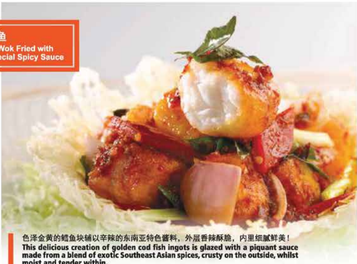
503. 酱爆鳕鱼 Cod Fish Wok Fried with Chef's Special Spicy Sauce

色泽金黄的鳕鱼块辅以辛辣的东南亚特色酱料，外层香辣酥脆，内里细腻鲜美！ This delicious creation of golden cod fish ingots is glazed with a piquant sauce made from a blend of exotic Southeast Asian spices, crusty on the outside, whilst moist and tender within.