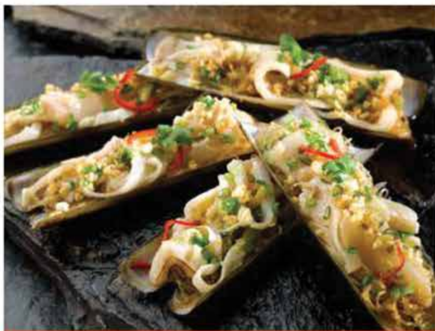
606. 蒜茸蒸竹蚌 Bamboo Clam Steamed with Minced Garlic