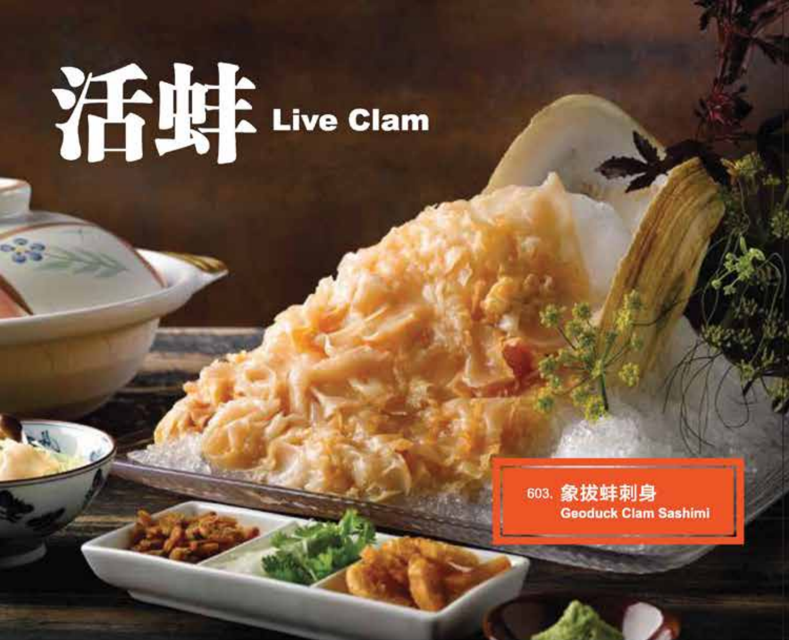
603. 象拔蚌刺身 Geoduck Clam Sashimi