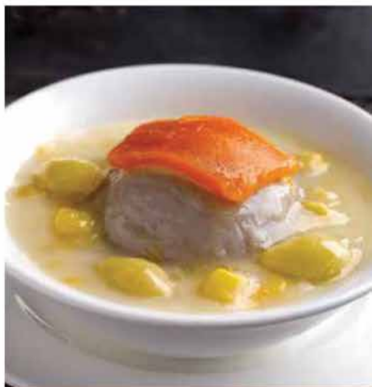
1001. 金瓜白果芋泥 Sweet Yam Paste with Gingko Nuts and Pumpkin