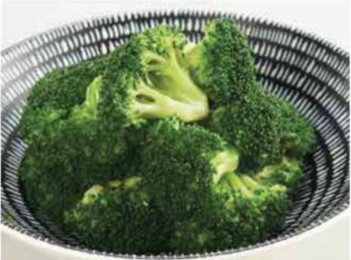
410A. 蒜茸炒西兰花 Broccoli Stir Fried with Minced Garlic