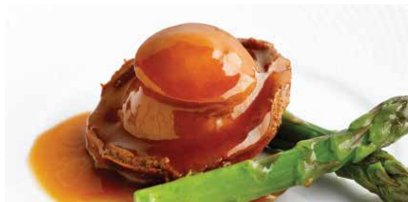
209. 蚝皇原只三头鲍鱼 Whole 3-Head Abalone Braised with Oyster Sauce

210. 三头鲍鱼扒时蔬(切片) $62 Sliced 3-Head Abalone Braised with Seasonal Vegetable