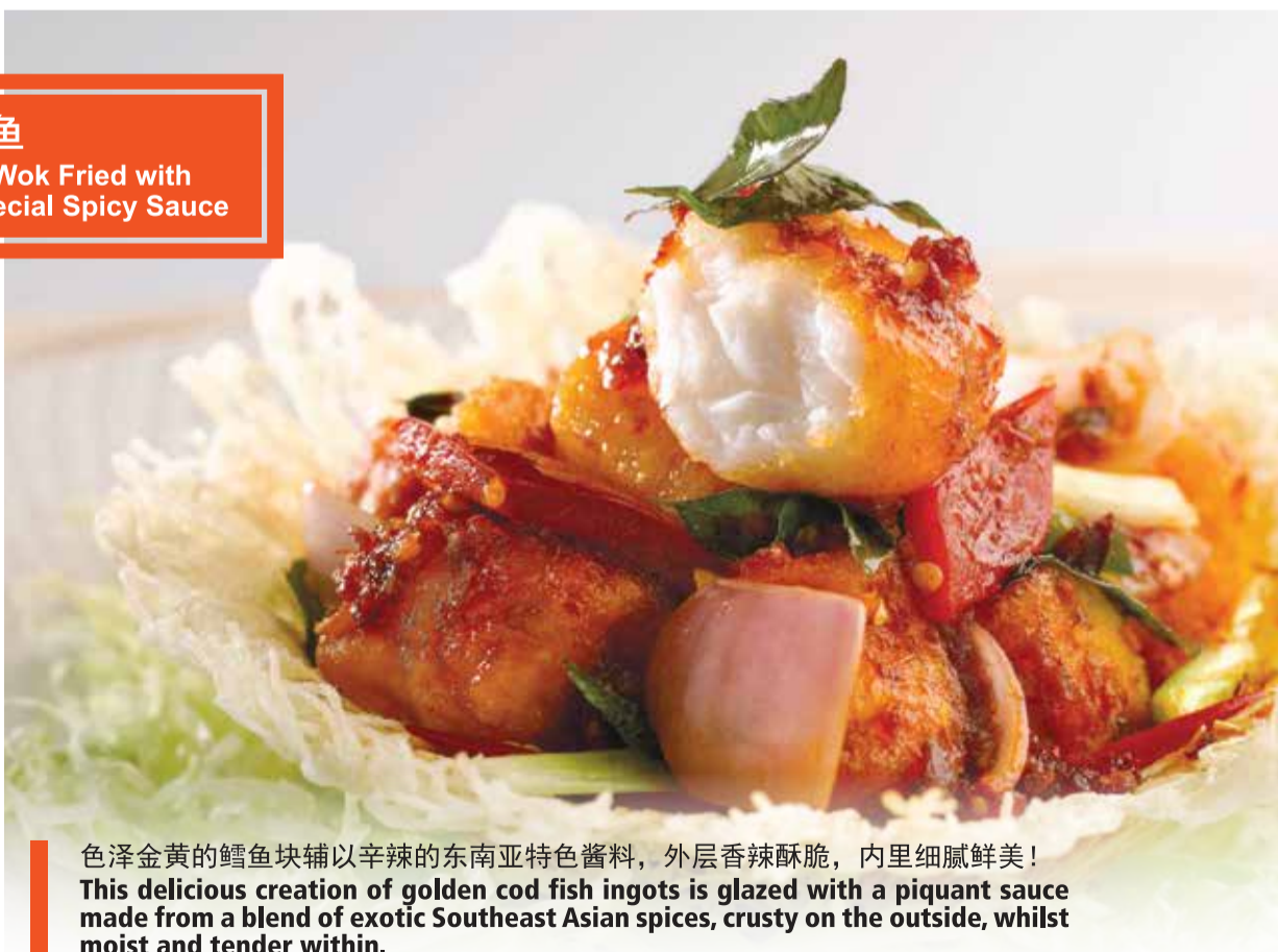
🍴 503. 酱爆鳕鱼 Cod Fish Wok Fried with Chef's Special Spicy Sauce

色泽金黄的鳕鱼块辅以辛辣的东南亚特色酱料，外层香辣酥脆，内里细腻鲜美！ This delicious creation of golden cod fish ingots is glazed with a piquant sauce made from a blend of exotic Southeast Asian spices, crusty on the outside, whilst moist and tender within.