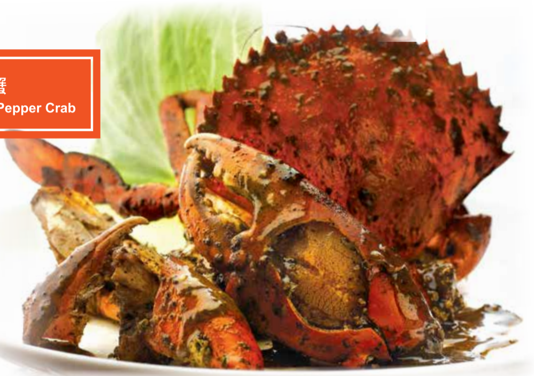
B. 招牌黑胡椒蟹 Signature Black Pepper Crab