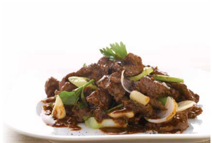
305. 姜葱炒鹿肉 Venison (Deer Meat) Stir Fried with Ginger and Spring Onions