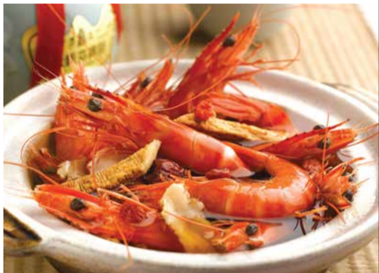
706. 药材醉活虾 Herbal Drunken Live Prawns