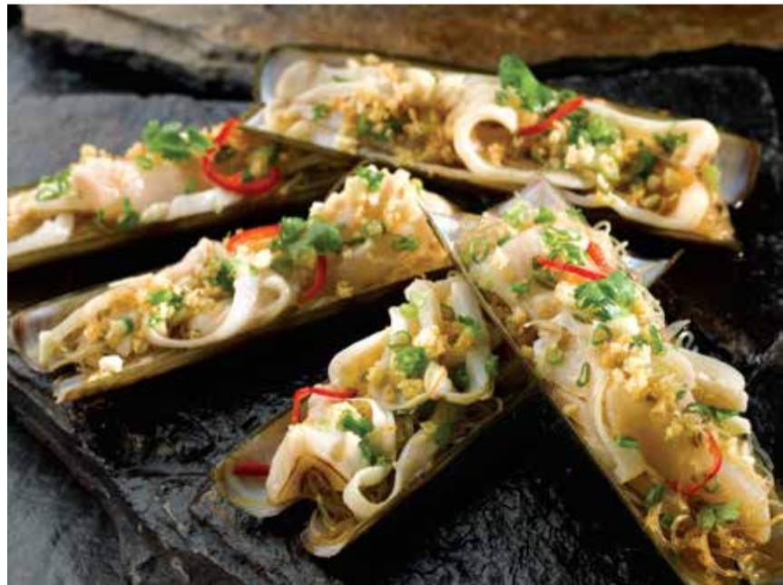
606. 蒜茸蒸竹蚌 Bamboo Clam Steamed with Minced Garlic