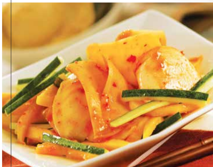
208. 生捞鲍片 Chilled Sliced Abalone with Chef's Special Sauce

Whet your appetite with a pot of liquid sunshine: this rich, velvety golden soup showcases a medley of premium seafood ingredients; the sweetness of fresh scallops and prawns against a backdrop of creamy, ambrosial pumpkin.