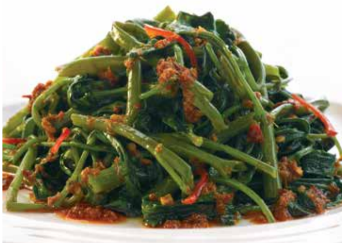
412C. 叁巴应菜 'Kang Kong' Stir Fried with Sambal