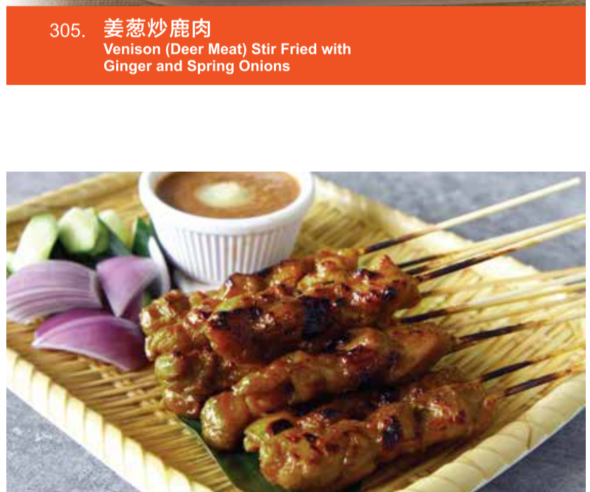
308. 特制沙爹(鸡肉/猪肉) Jumbo Satay (Chicken / Pork)