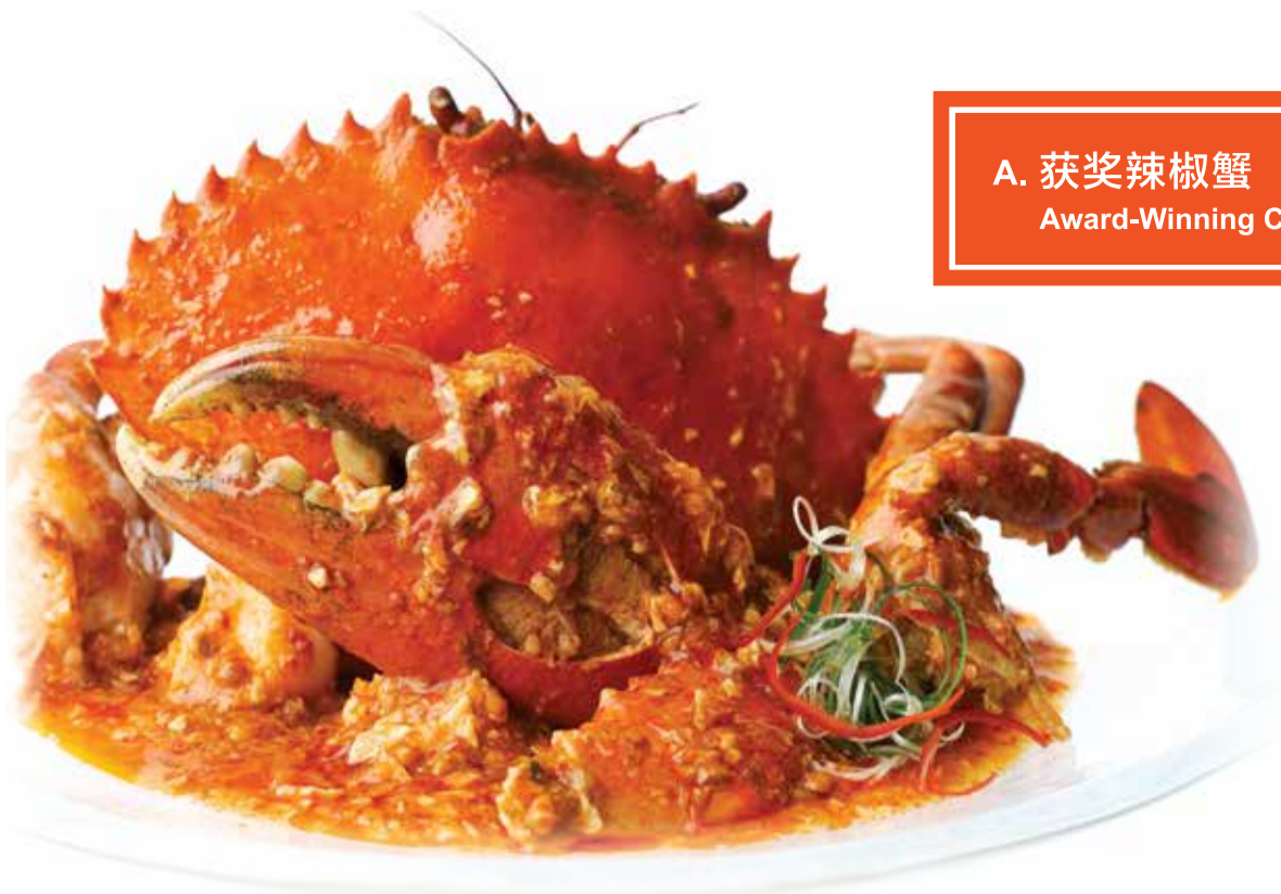
A. 获奖辣椒蟹 Award-Winning Chilli Crab