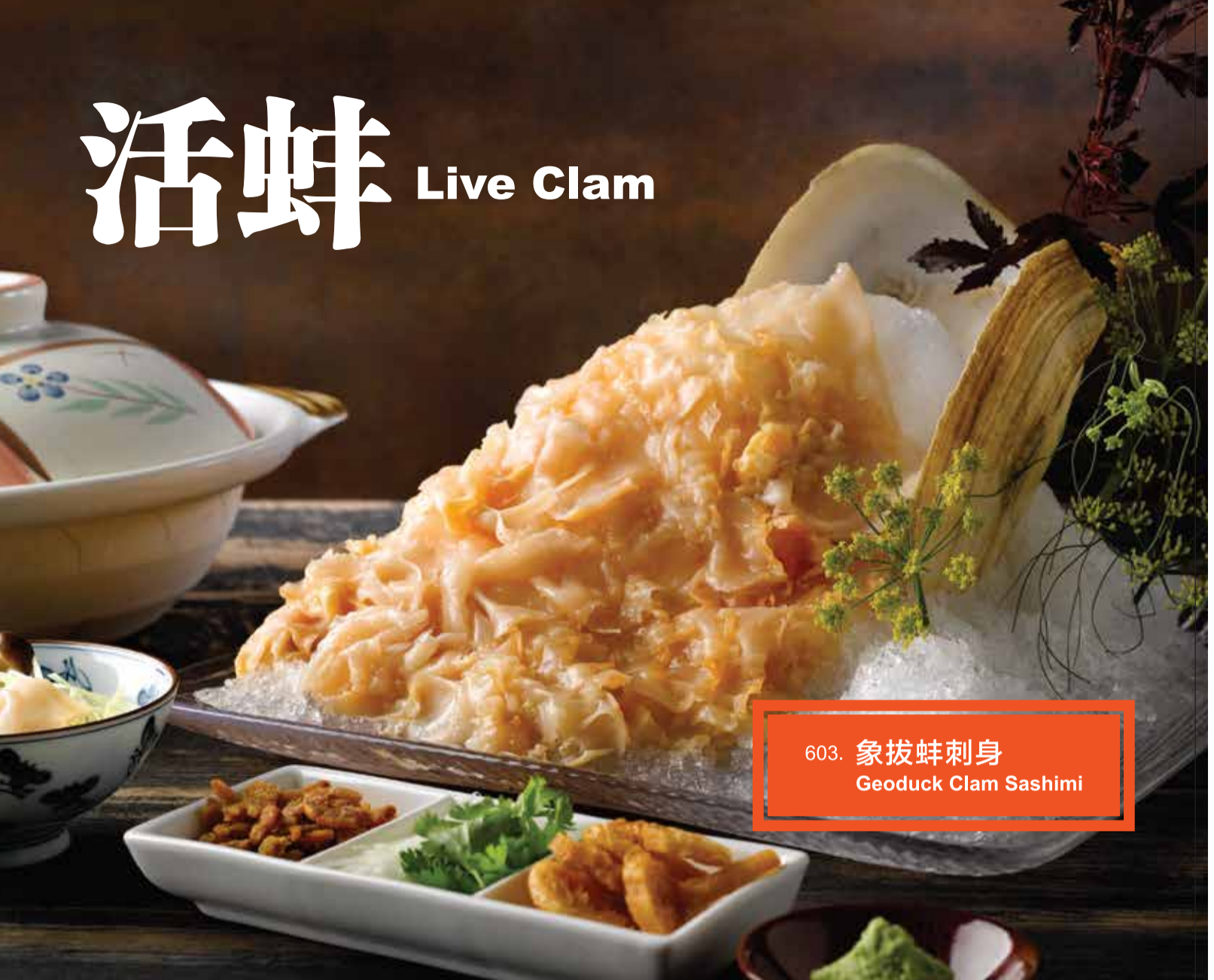
603. 象拔蚌刺身 Geoduck Clam Sashimi