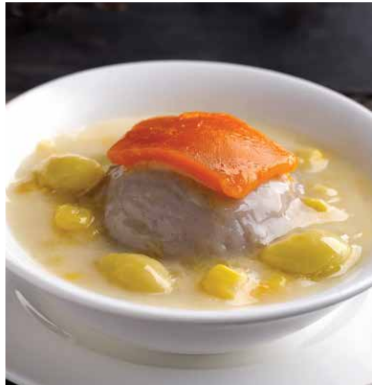
1001. 金瓜白果芋泥 Sweet Yam Paste with Gingko Nuts and Pumpkin