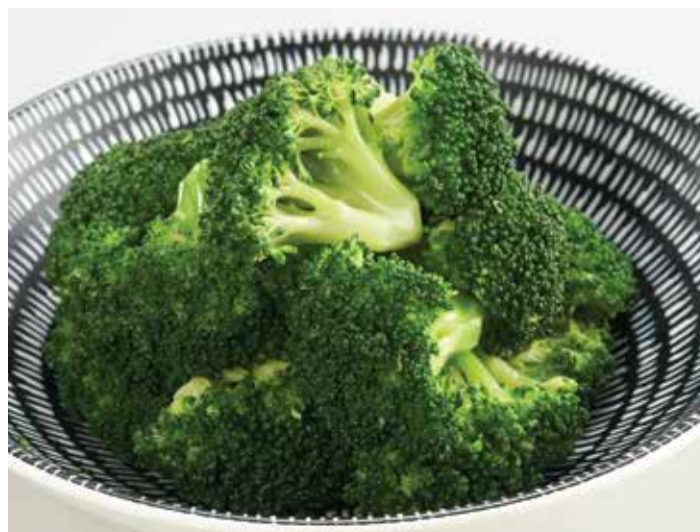
410A. 蒜茸炒西兰花 Broccoli Stir Fried with Minced Garlic