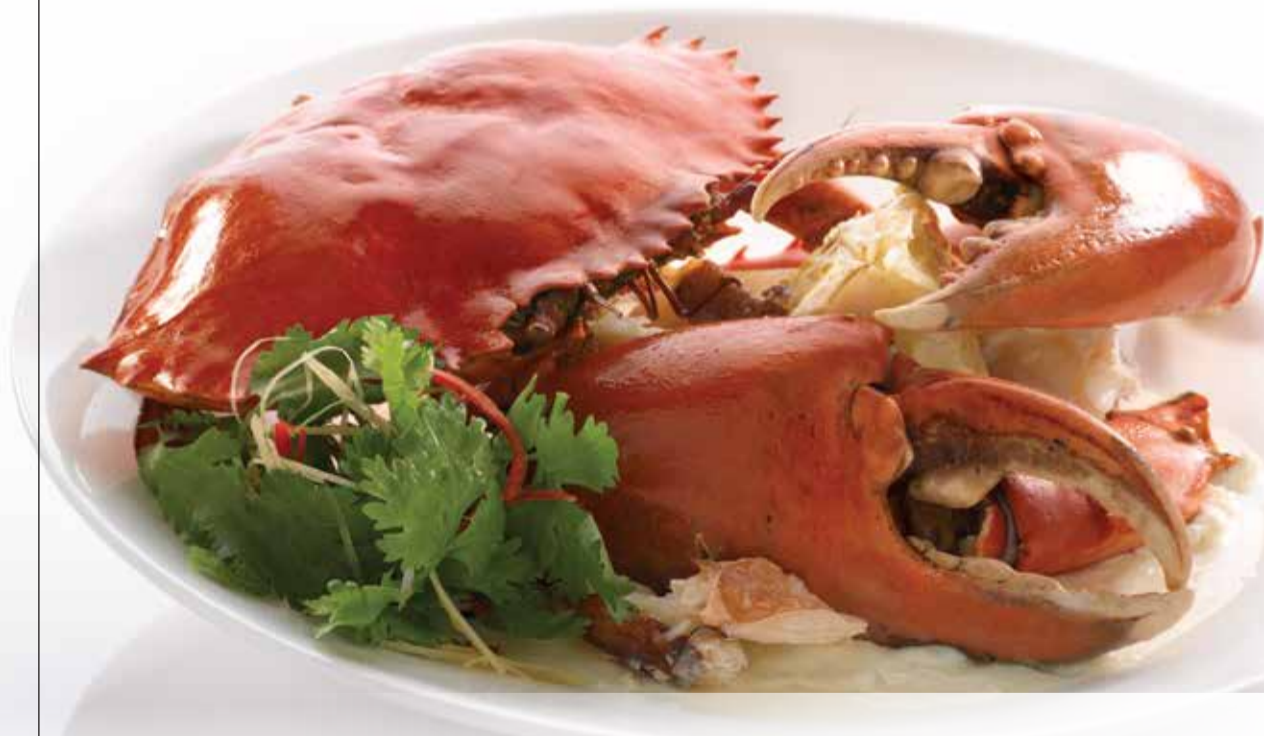
D. 花雕蛋白蒸蟹 Steamed Crab with Chinese Wine and Egg White

爱吃螃蟹的行家都会以螃蟹的鲜甜味为主，坚决选择吃蒸蟹。厨师们采用了豆浆，花雕酒和蛋白让蒸蟹显得更为突出。花雕酒不仅提升螃蟹的鲜味，也带出豆浆和蛋白的纤细口感，凸显出蟹肉的甜味。