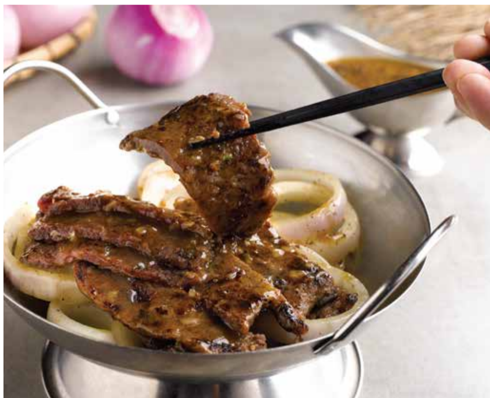
食 302. 鑊仔牛柳 Beef Fillet with Black Pepper Sauce