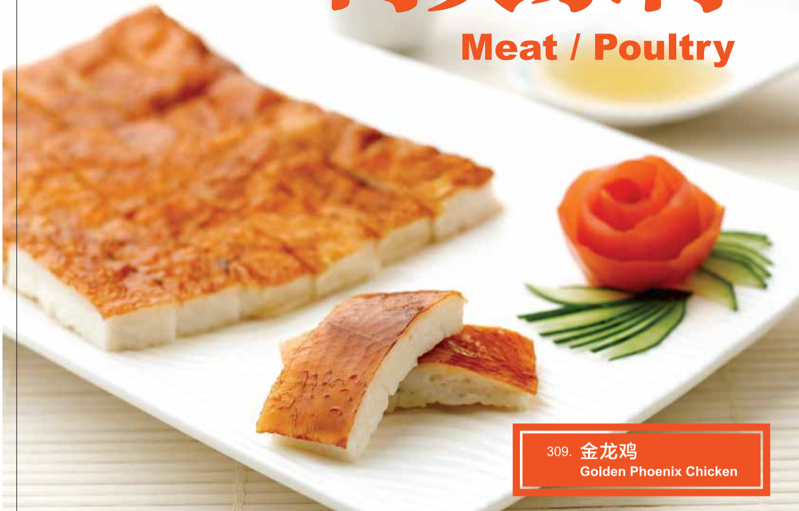
309. 金龙鸡 Golden Phoenix Chicken