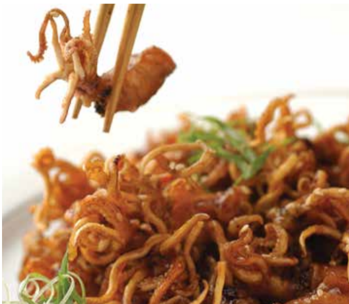
🍴 507. 脆炸苏东仔 Crispy Fried Baby Squid