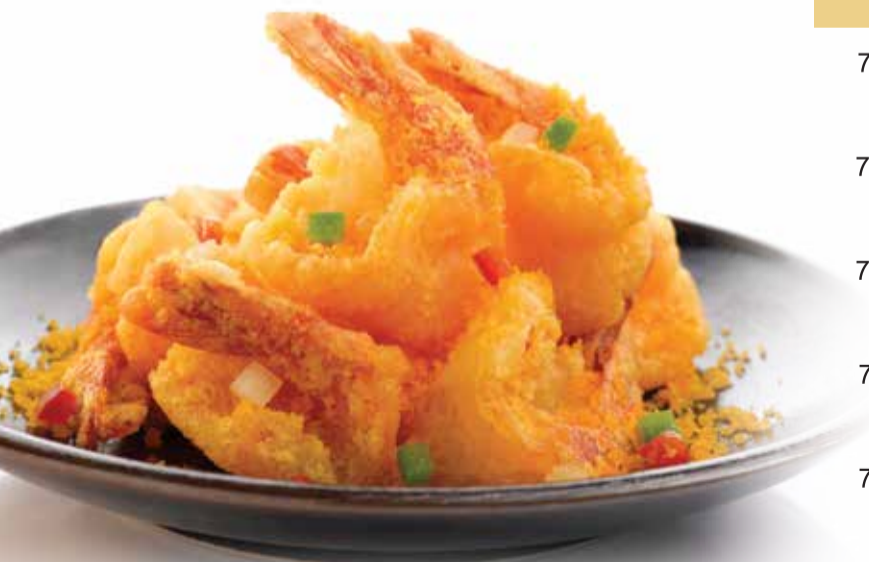
食 716. 咸蛋金沙虾球 Shelled Prawns Fried with Golden Salted Egg