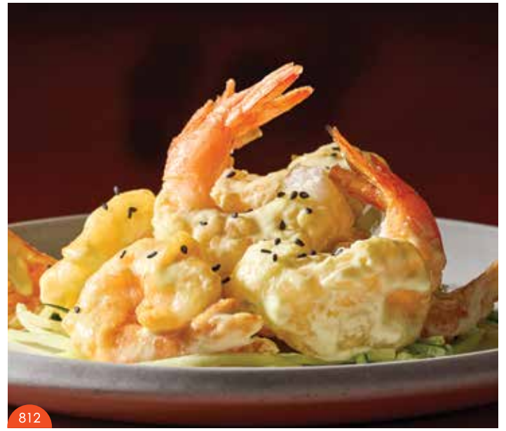
812 芥末沙律虾球 Deep-fried Shelled Prawns with Wasabi-Mayo $ 26 小/S | $ 39 中/M | $ 52 大/L