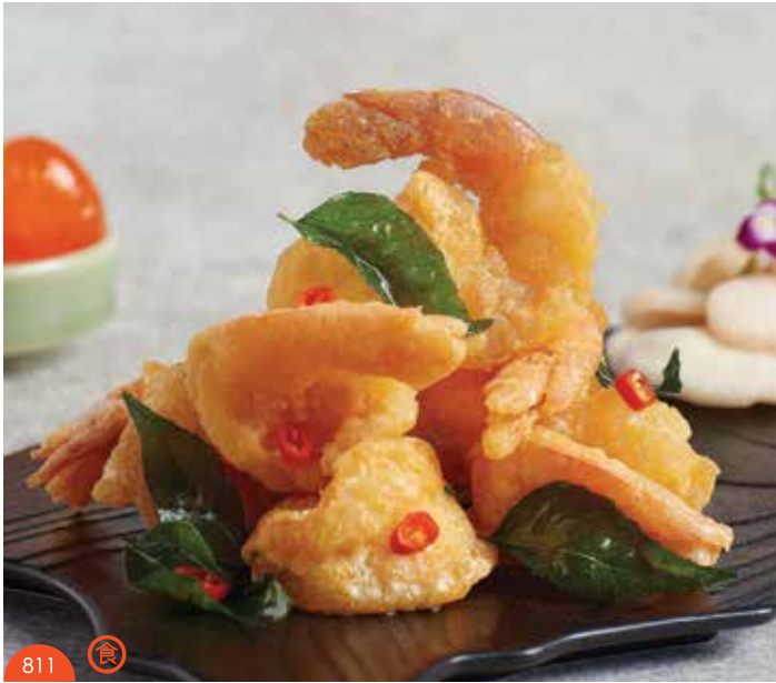
811 咸蛋金沙虾球 Shelled Prawns Stir-fried with Golden Salted Egg $ 26 小/S | $ 39 中/M | $ 52 大/L