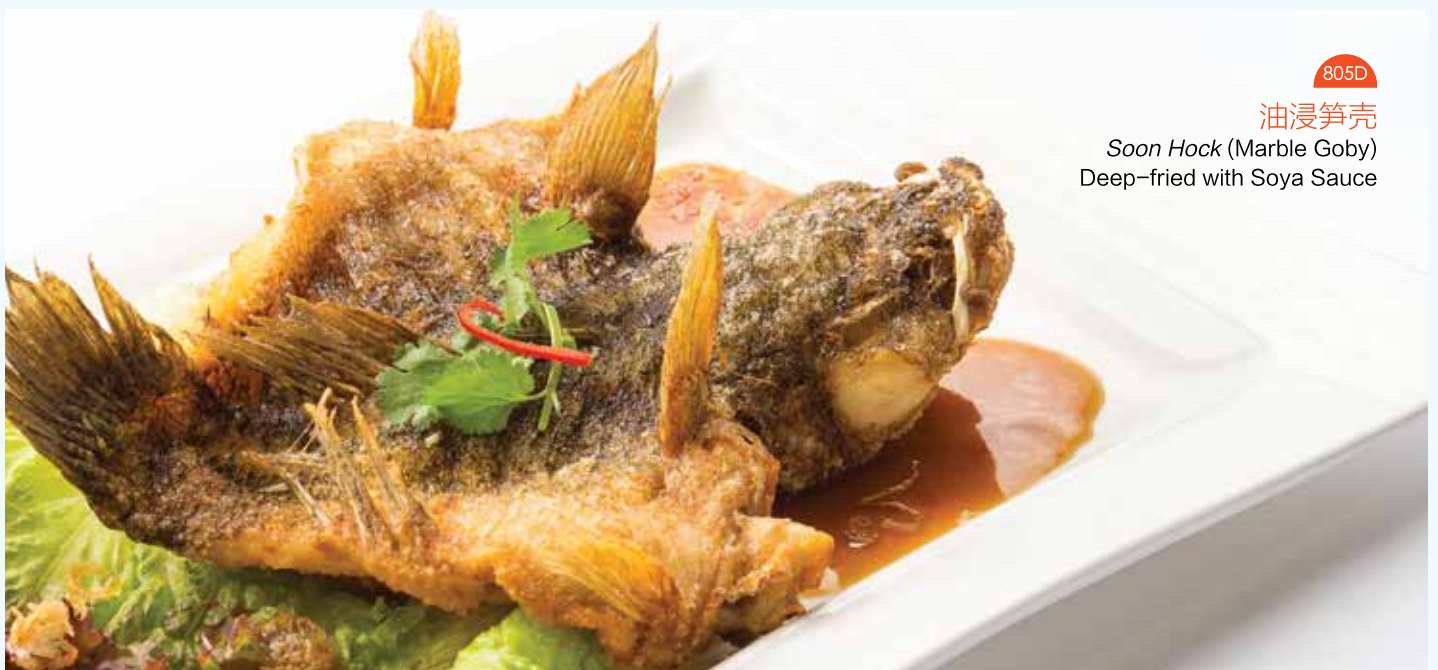
油浸笋壳 Soon Hock (Marble Goby) Deep-fried with Soya Sauce