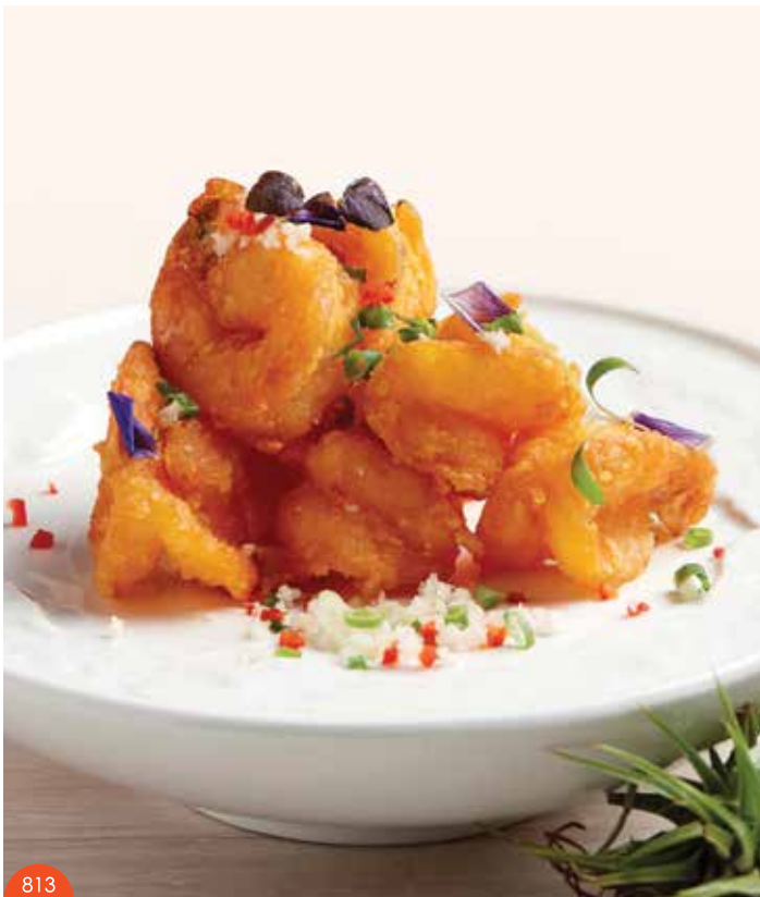
813 椒盐虾球 Shelled Prawns Stir-fried with Pepper and Spiced Salt $ 26 小/S | $ 39 中/M | $ 52 大/L