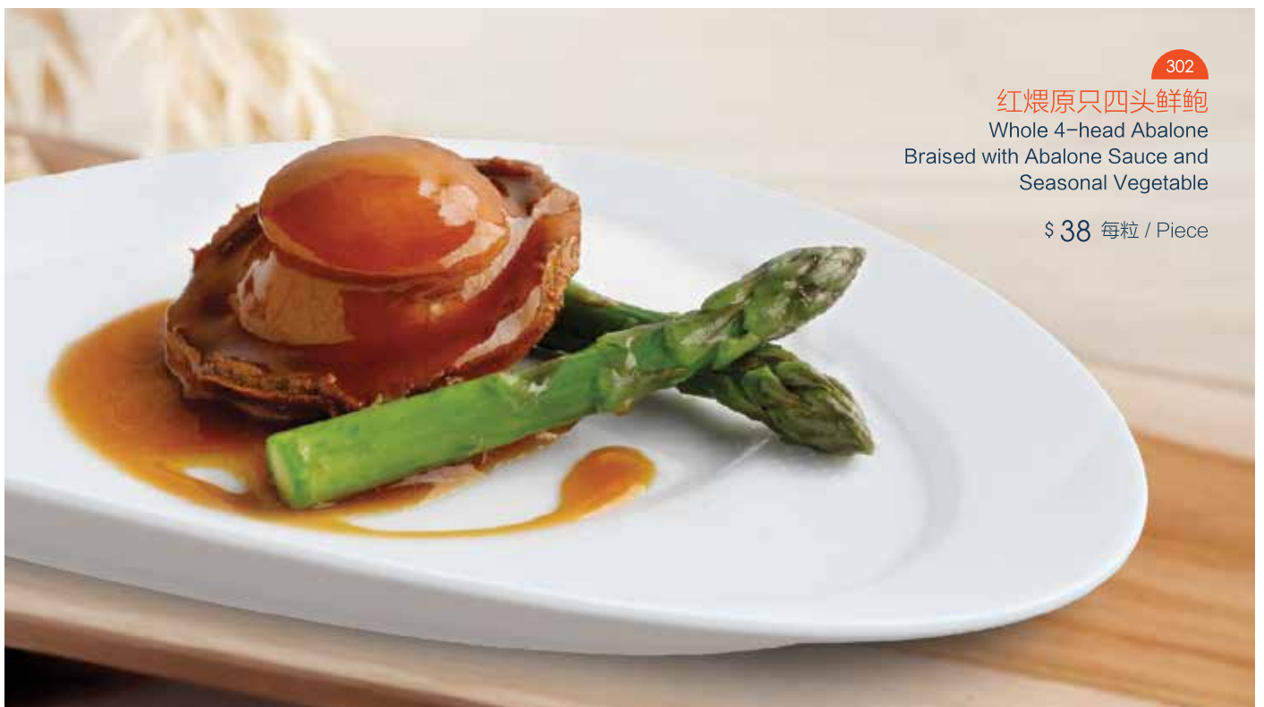
302 红煨原只四头鲜鲍 Whole 4-head Abalone Braised with Abalone Sauce and Seasonal Vegetable $ 38 每粒 / Piece