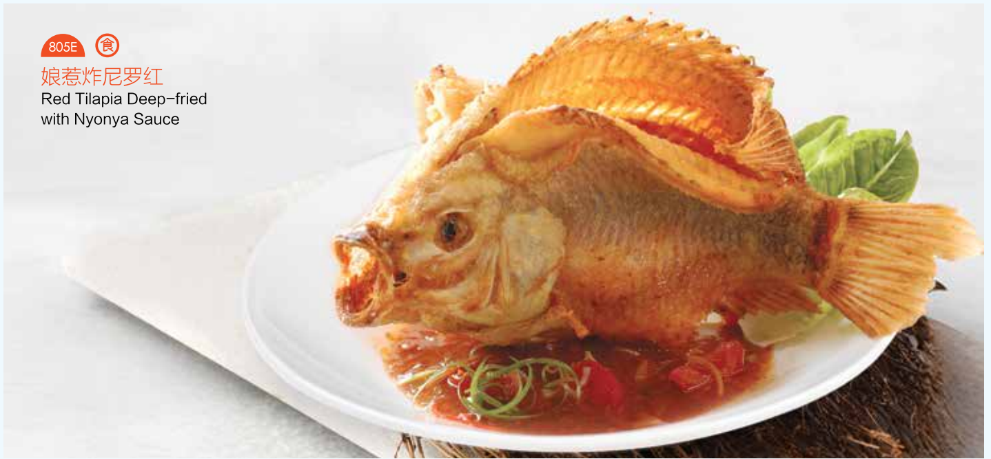
娘惹炸尼罗红 Red Tilapia Deep-fried with Nyonya Sauce