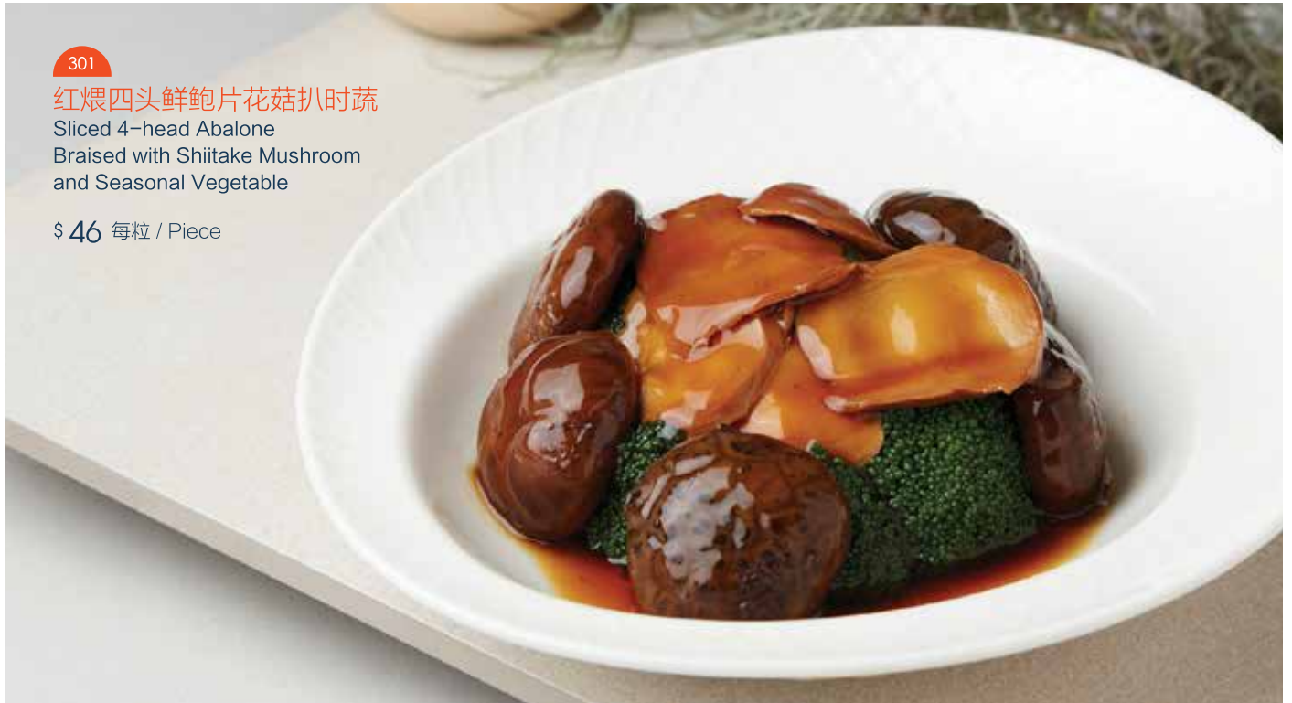
301 红煨四头鲜鲍片花菇扒时蔬 Sliced 4-head Abalone Braised with Shiitake Mushroom and Seasonal Vegetable $ 46 每粒 / Piece