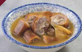
猪尾汤 Pig's Tail Soup