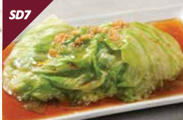
油玻璃生菜 Blanched Lettuce in Garlic Oil