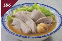
鲜灼猪肝 Blanched Pig's Liver