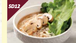
面线 Mee Sua