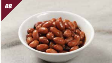
卤水花生 Braised Peanuts $ 2.80