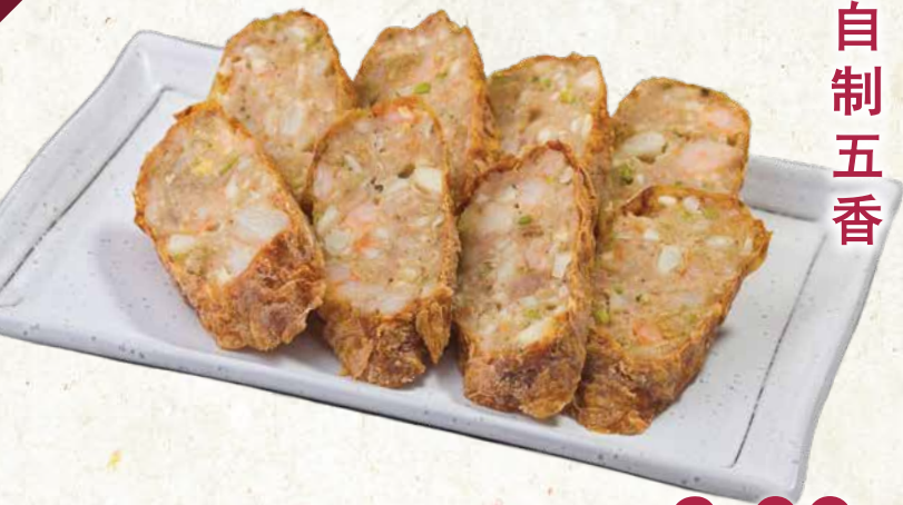
Home-made Ngoh Hiang