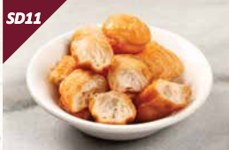
炸油条 Fried You Tiao