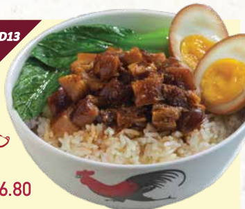
潮州卤猪手饭 Teochew Style Braised Pig's Trotter Rice