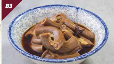
卤粉肠 Braised Small Intestine $ 6.80