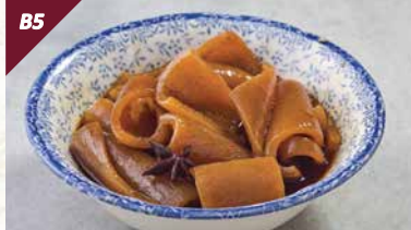
卤猪皮 Braised Pig's Skin $ 3.80