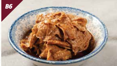
卤腐皮 Braised Beancurd Skin (Tau Kee) $ 4.80