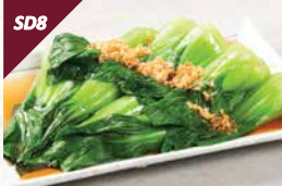
油小白菜 Blanched Xiao Bai Cai in Garlic Oil