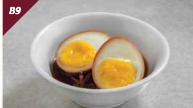
潮州卤糖心蛋 Teochew Braised Onsen Egg $ 1.20