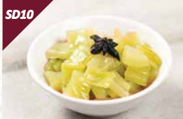
菜尾 Preserved Vegetables