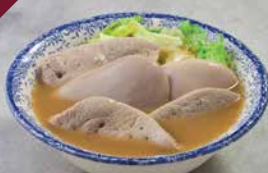
鲜灼猪腰猪肝 Blanched Pig's Kidney & Liver Combo