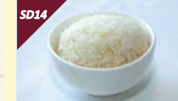
白饭 Steamed Rice