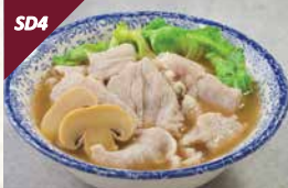
鲜灼猪肉片 Blanched Sliced Pork