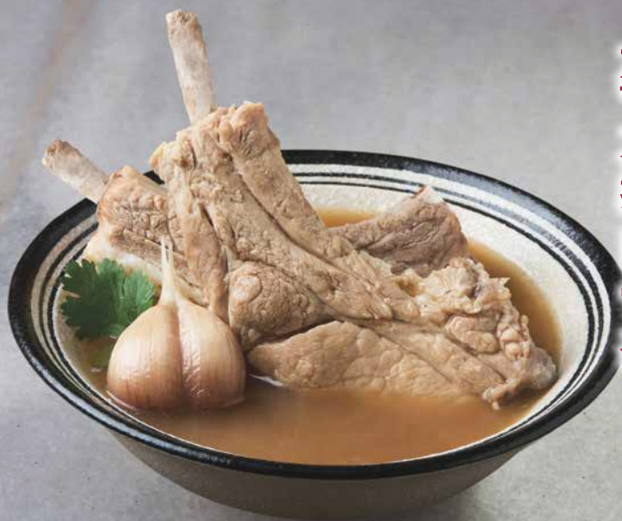
Premium Loin Ribs Soup