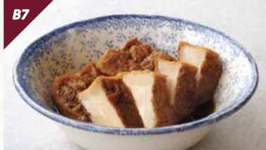
卤豆腐豆卜 Braised Beancurd & Tau Pok $ 3.80