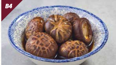
卤鲜冬菇 Braised Fresh Winter Mushrooms $ 4.80