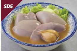
鲜灼猪腰 Blanched Pig's Kidney